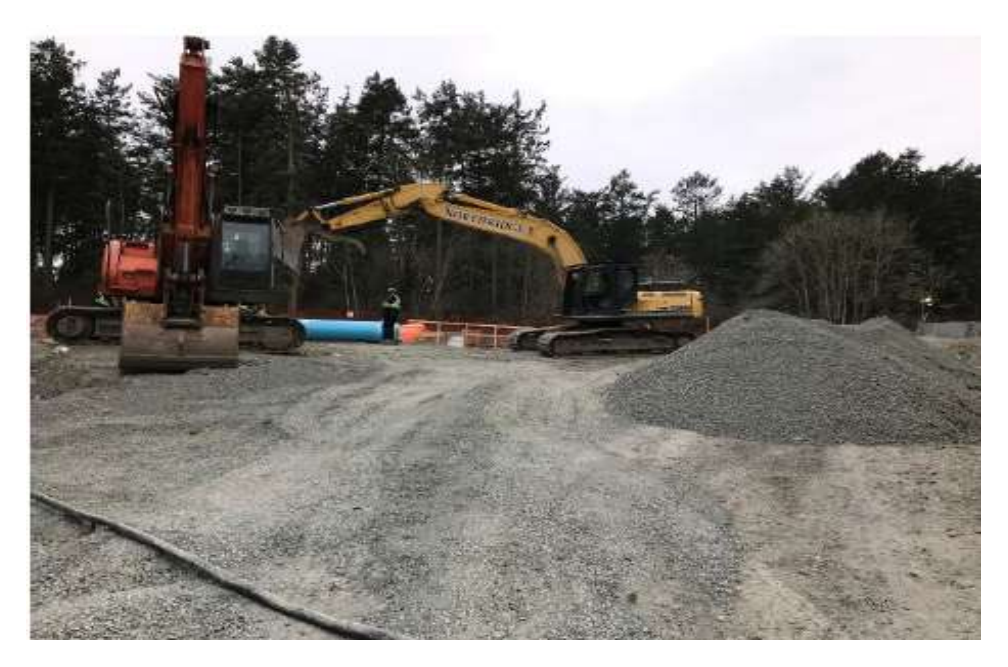
Figure 8-Arbutus Attenuation Tank- Site view facing north.

Photographs of construction progress during the month of February at the Arbutus Attenuation Tank are shown in Figures 8 and 9.