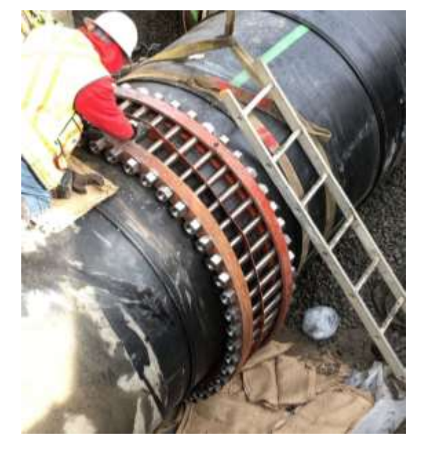
Figure 10-Trent Forcemain- Seawall Flange Bolt up