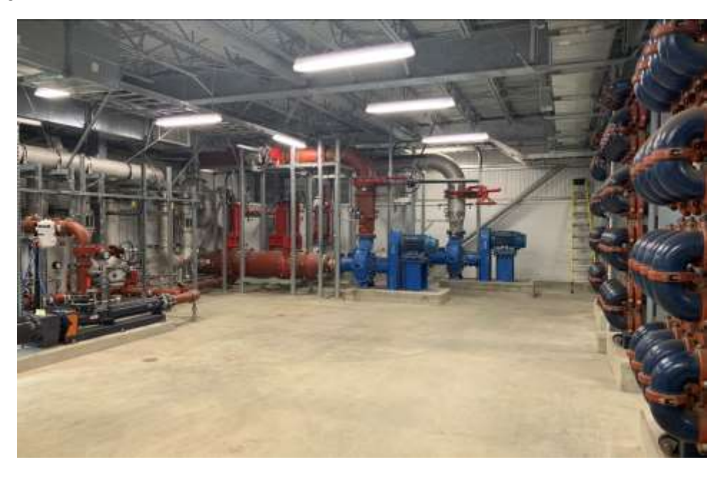
Figure 2- Residuals Treatment Facility- Digester building equipment.

Photographs of progress over the month of February at the Residuals Treatment Facility are shown in Figures 2 and 3.