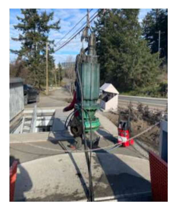
Figure 6-Residual Solids Pump Stations- Pump removed from the wet well at Pump Station 1 for inspection