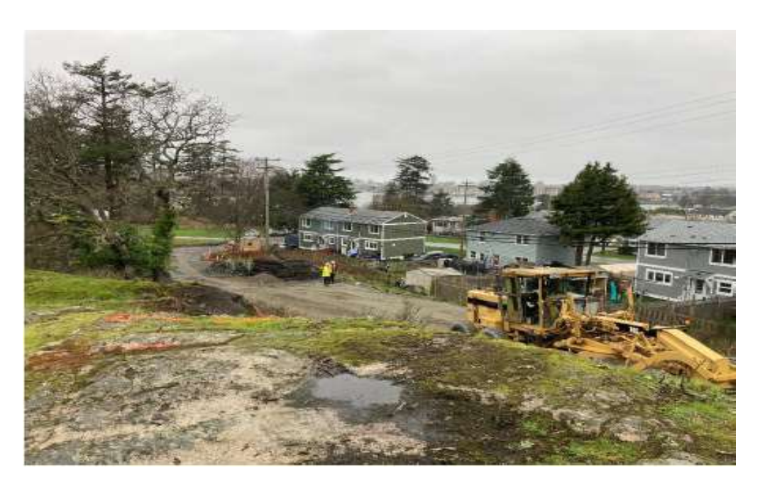
Figure 5– View of site looking towards Bewdley Ave facing North East.

<u>Residual Solids Pump Stations</u>: Knappett Projects Inc. ("Knappett" as the Construction Contractor for the Residual Solids Pump Stations) continued construction and commissioning activities over the reporting period.