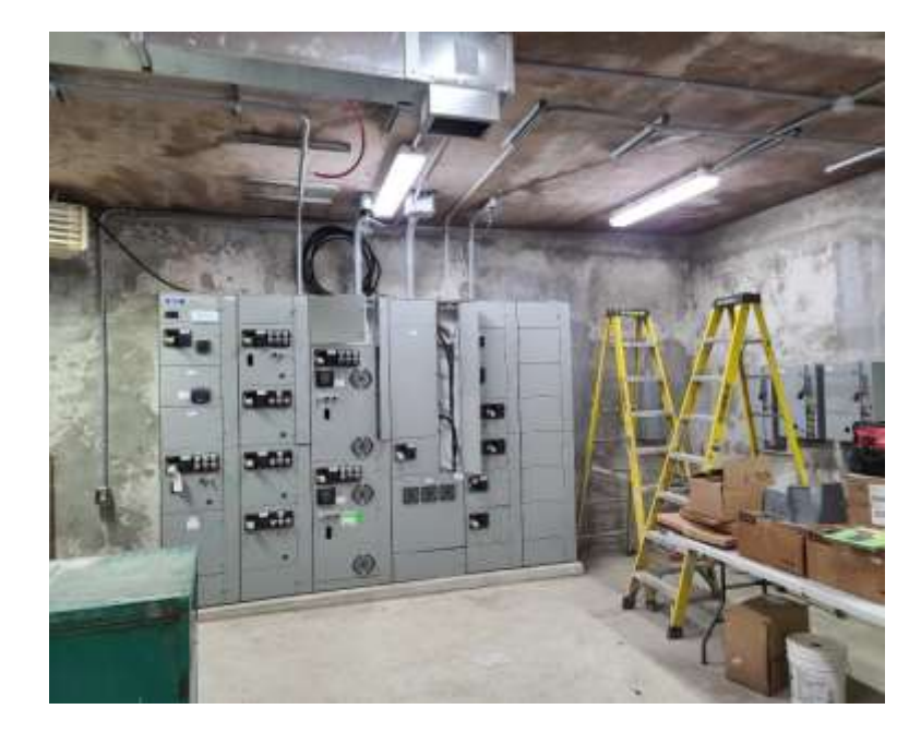
Figure 9–Arbutus Attenuation Tank- Electrical Room heating ventilation and air conditioning; and electrical installation