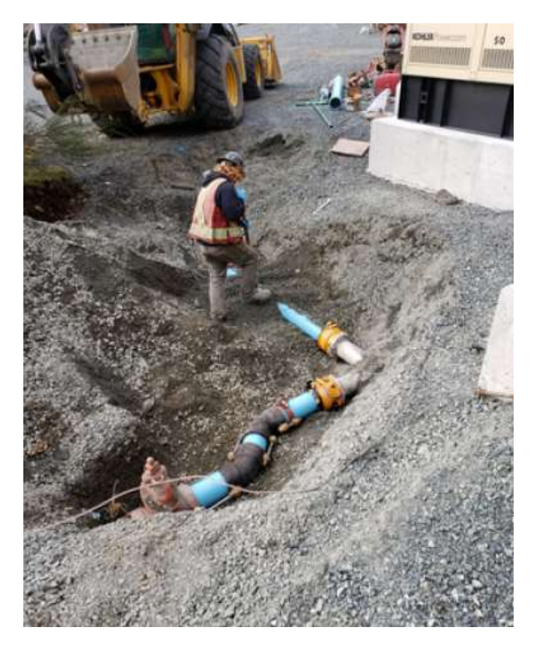
Figure 7 -Residual Solids Pump Stations - Working on watermain tie in at the Hartland Reservoir