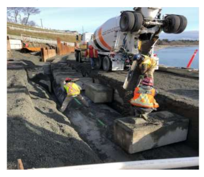
Figure 11–Trent Forcemain- Controlled density fill installation around high density polyethylene pipe.