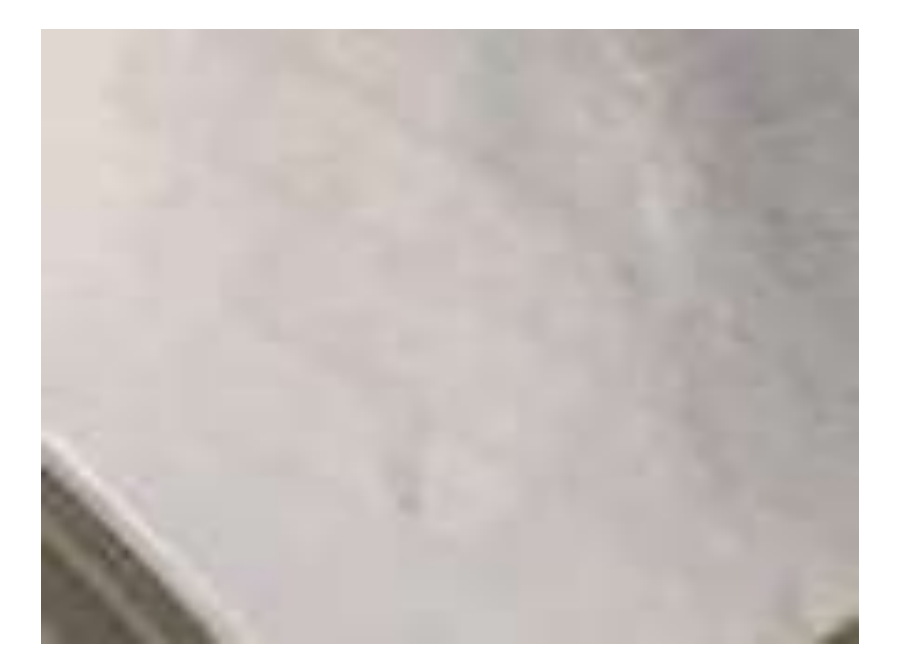
Figure 4-Clover Point Pump Station- Generator muffler supports