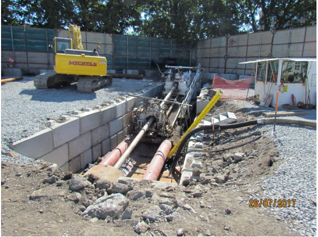
Figure 6 – Drilling of HDD pilot hole