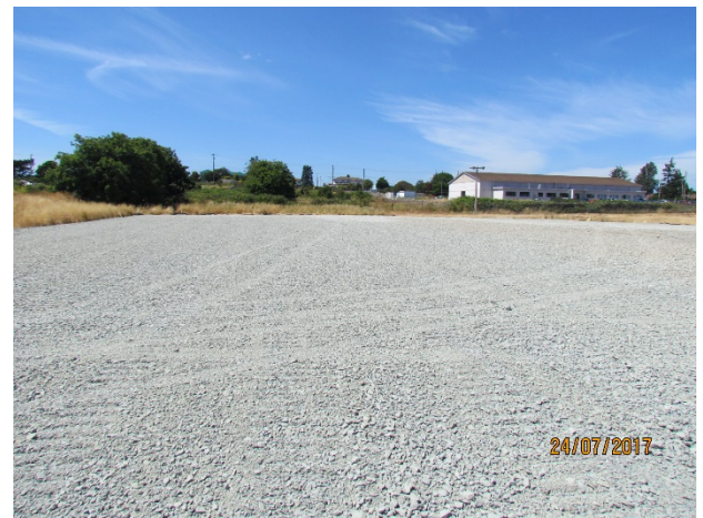
Figure 3- Employee parking lot constructed at DND Area "E"