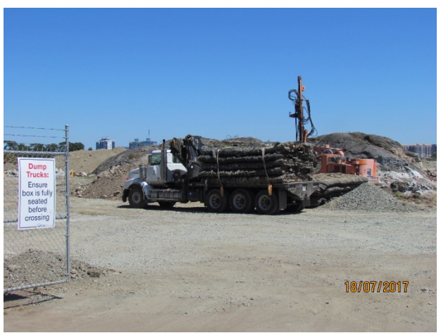
Figure 1- Mobilization of blasting equipment

After completion of the casing installation, HRP commenced drilling of the HDD pilot hole (Figure 6). Since commencing drilling the noise levels have reduced significantly, as anticipated, and are now in the range of 70-75 decibels during working hours (7am – 7pm Monday-Friday, and 10am – 7pm on Saturdays). The Project Team will continue to monitor noise levels as the drilling operation continues, however noise levels are not anticipated to increase from the current levels.