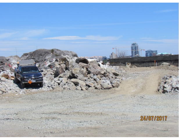
Figure 2- Blast rock from rock outcrop