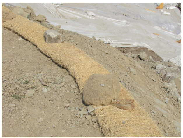
Figure 5 – Erosion and sediment control in place