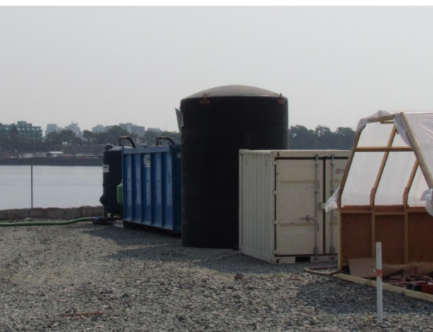
Figure 4 - Installation of water treatment plant