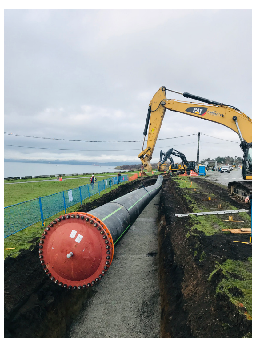
The 1.2m diameter Clover Forcemain is being lowered into the trench near Clover Point. There will be single lane alternating traffic on Dallas Road during construction.

The expansion of the Clover Point Pump Station has been under construction since February 2018. Excavation was completed in 2018 with concrete pouring now underway and will continue in 2019 along with installation of pumping equipment.