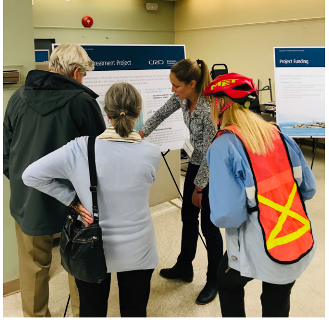
Public Open House at Cook Street Village Activity Centre.