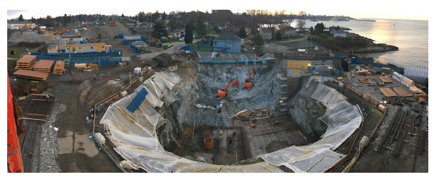
Aerial view of construction progress at the Macaulay Point Pump Station.