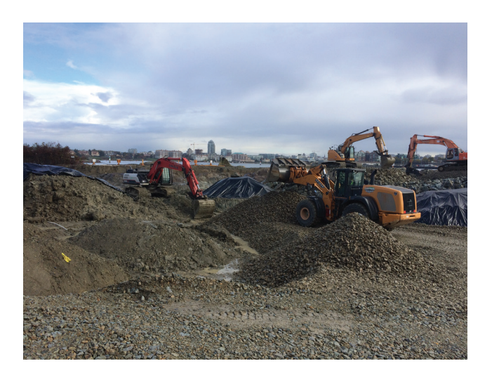
Excavation at McLoughlin Point is underway as crews prepare the site for the construction of the new McLoughlin Point Wastewater Treatment Plant.