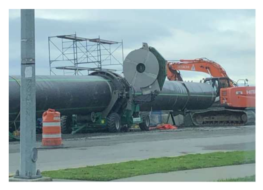
Figure 14 - Trent Forcemain - Fusion of High Density Polyethylene Pipe.

A photograph of construction progress during the month of November at the Trent Forcemain is shown in Figure 14.