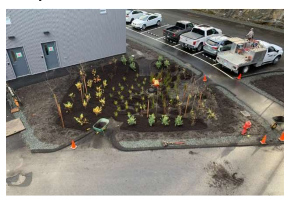
Figure 5 - Residuals Treatment Facility- Landscaping installation.

A photograph of construction progress over the month of November at the Residuals Treatment Facility is shown in Figure 5.