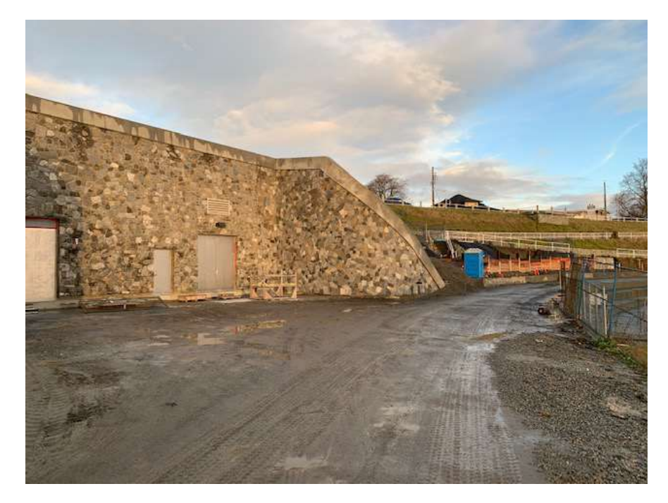
Figure 7 - Clover Point Pump Station - Rock face on new pump station.