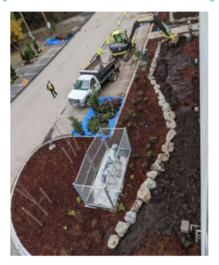
Figure 4 – McLoughlin Point Wastewater Treatment Plant- Rock installation at landscape area west of process building.