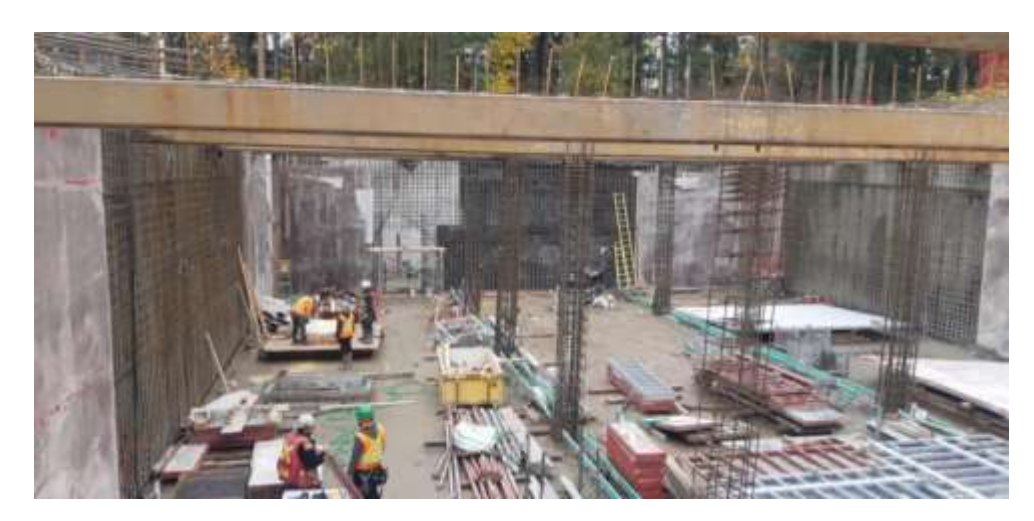
Figure 12 - Arbutus Attenuation Tank- Column reinforcing installation process.

Photographs of construction progress during the month of November at the Arbutus Attenuation Tank are shown in Figures 12 and 13.