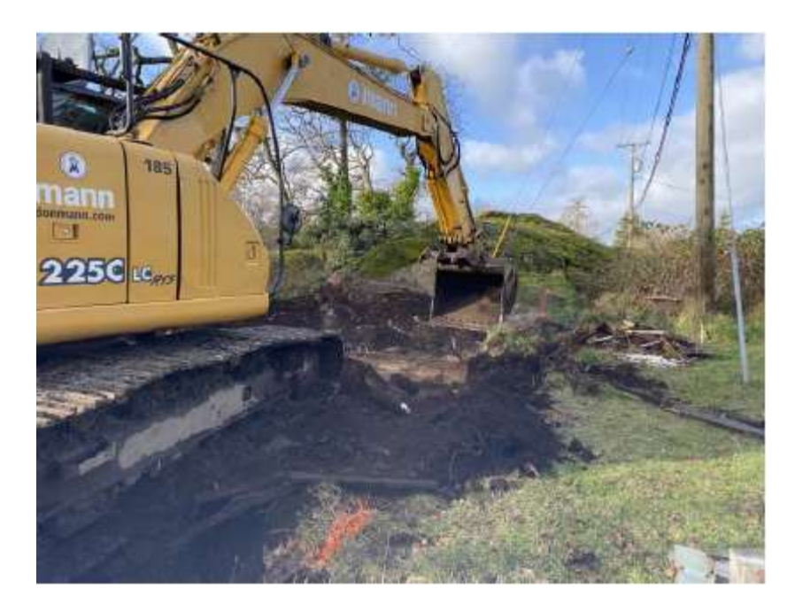
Figure 9 - Residual Solids Pipes - Building BC Hydro Access Road.

<u>Residual Solids Pump Stations</u>: Knappett Projects Inc. ("Knappett" as the Construction Contractor for the Residual Solids Pump Stations) continued construction and commissioning activities over the reporting period.