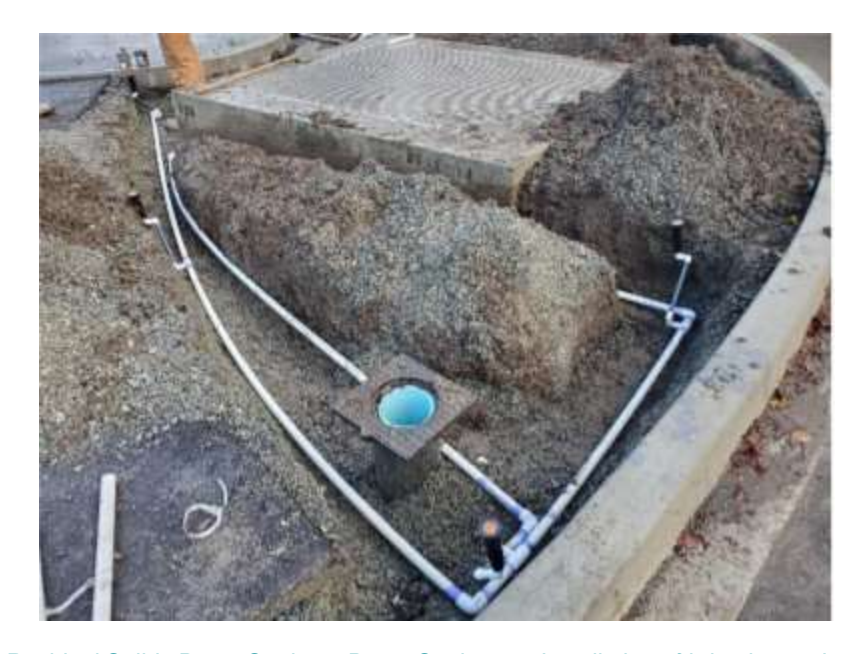
Figure 10 - Residual Solids Pump Stations—Pump Station 2 - Installation of irrigation and sprinkler heads.