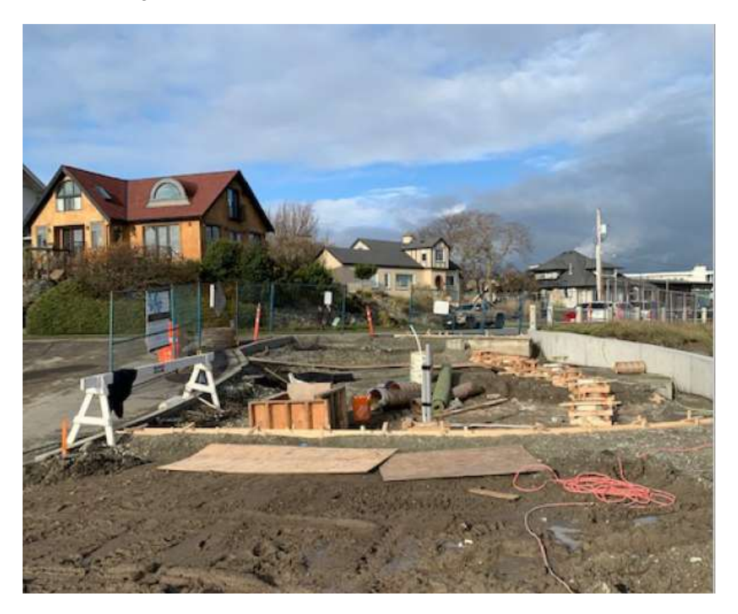
Figure 6 - Clover Point Pump Station - Conduit area preparation.

Photographs of construction progress over the month of November at Clover Point Pump Station are shown in Figures 6 and 7.