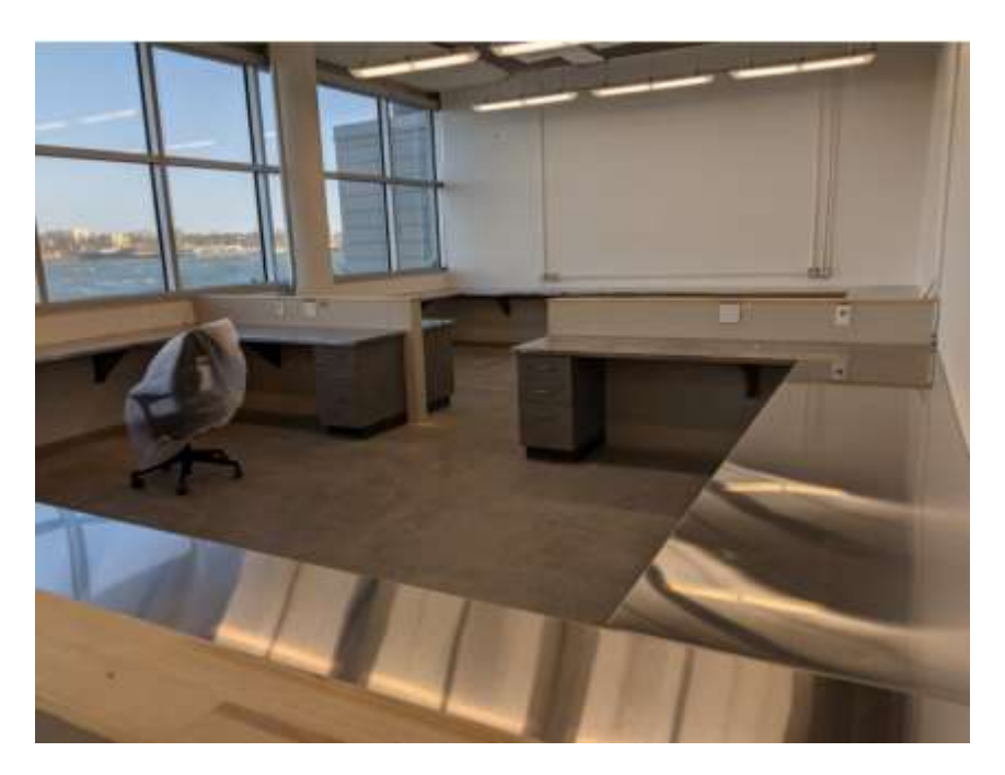
Figure 2 - McLoughlin Point Wastewater Treatment Plant - Aluminium countertops and electrical outlets installed in instrumentation workshop

Photographs of construction progress over the month of November at McLoughlin Point WWTP are shown in Figures 2-4.