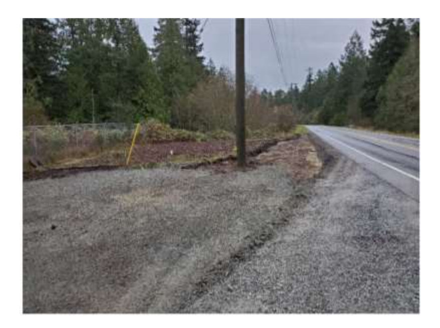
Figure 11 –Residual Solids Pump Stations – Restoration of Willis Point Road Laydown area.