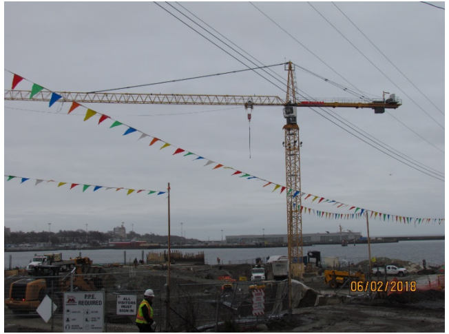
Figure 2 – Tower crane erection complete