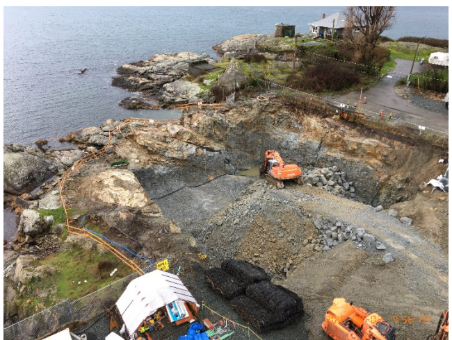
Figure 4 – View of the outfall shaft area from the tower crane