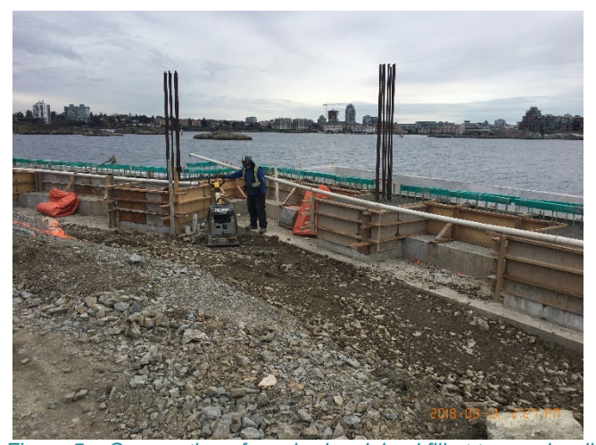
Figure 5 - Compaction of crushed rock backfill at tsunami wall