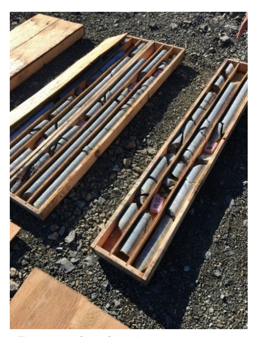
Figure 10 - Core Samples