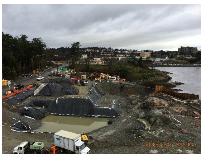
Figure 3- View looking north from the tower crane