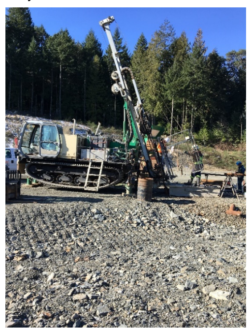
Figure 9 - Geotechnical Drilling Operation