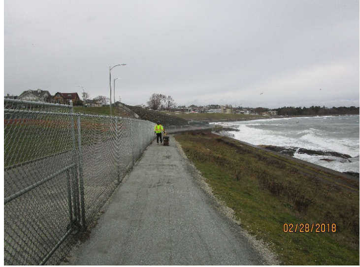
Figure 11 – Compacting temporary seawall walking path