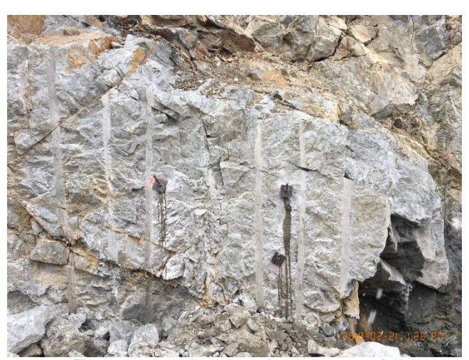
Figure 7 – Install rock anchor bolts at outfall