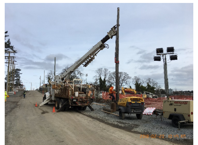
Figure 8 - Remove old utility poles from East side of Victoria View Road