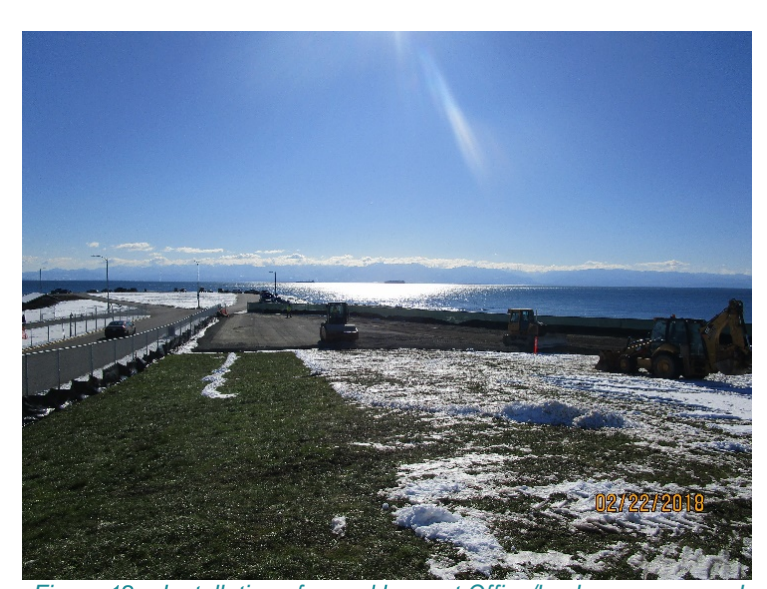
Figure 12 – Installation of gravel base at Office/laydown compound