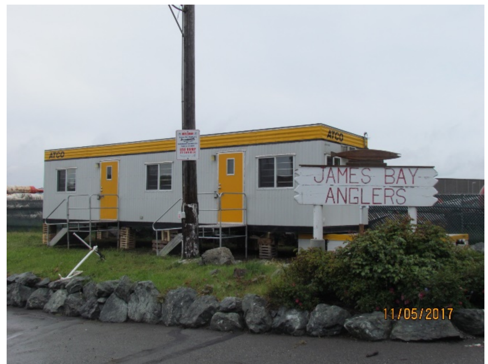
Figure 3- Temporary Angler's Hut delivered and set up