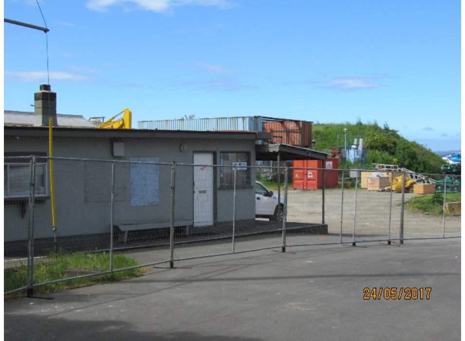
Figure 5- Temporary fencing installed

Wastewater Treatment Project Treated for a cleaner future