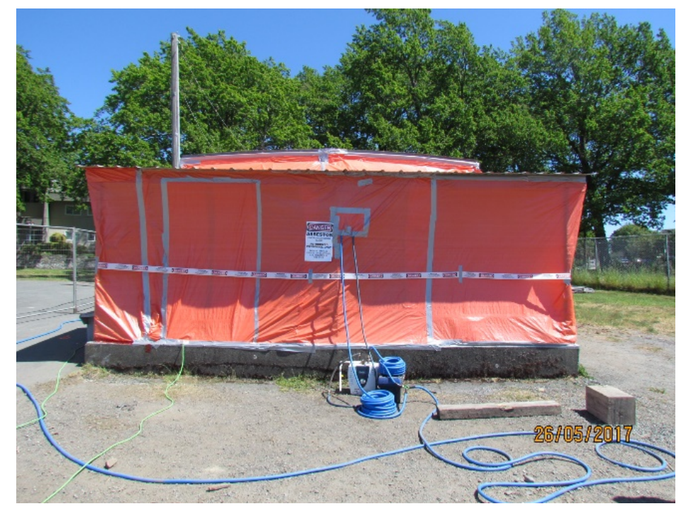
Figure 2- Negative air pressure asbestos enclosure

The WWTP is in the construction phase. The construction phase of the WWTP is progressing in line with the schedule, with HRP furthering design and beginning to mobilize materials and equipment (see Figure 4), and preparing construction sites (see Figures 2, 3 & 5). The majority of work on the WWTP Project Component consisted of preparation for the Harbour Crossing at Ogden Point. The following figures show examples of progress made in the reporting period on the WWTP Project Component.