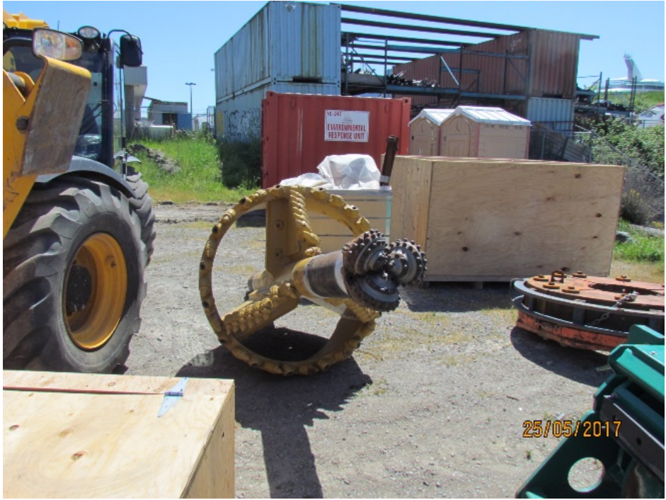
Figure 4- Mobilization of equipment and drill components