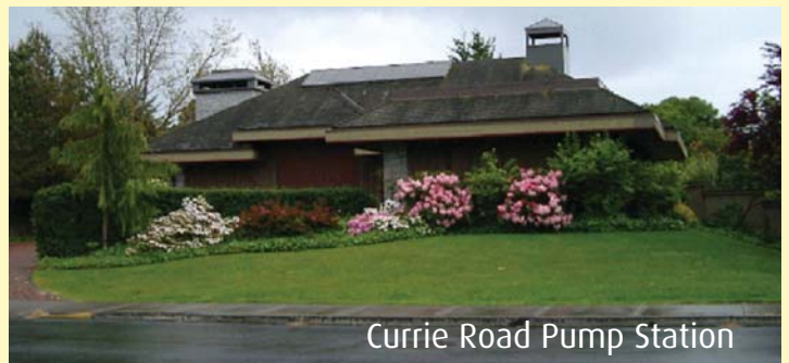
Currie Road Pump Station

The CRD has a long history of planning, designing, operating and maintaining pump stations within existing neighbourhoods. An award-winning example is the Currie Road Pump Station adjacent to Windsor Park in Oak Bay. This pump station complements its surroundings while meeting all of the project's technical requirements through innovative applications of engineering technology, architecture and local community input.