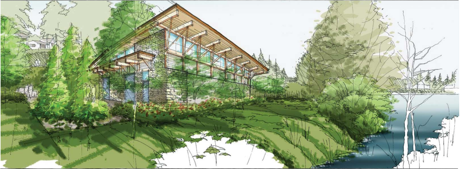
Perspective View of Proposed Craigflower Pump Station