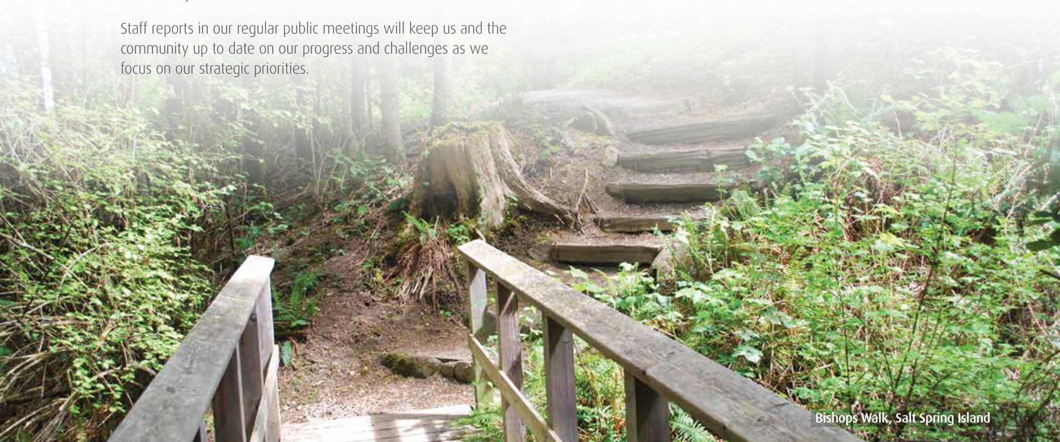
Bishops Walk, Salt Spring Island

Staff will report back to the LCC on progress made delivering the strategic plan on an annual basis. An in-depth check in will be scheduled in winter 2026 to give LCC members an opportunity to adjust the plan if necessary.