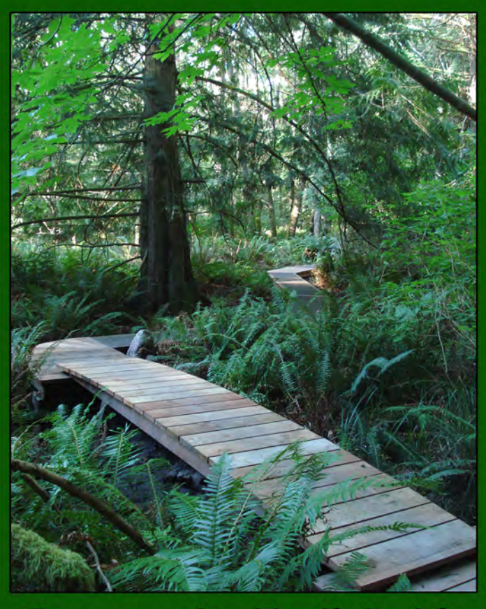
Community Trail Guide Third Edition