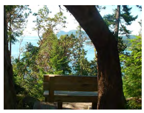
Ogden Road Viewpoint

This five minute walk takes you to a set of stairs leading down to a bench. The viewpoint overlooks the South end of Navy Channel, with Galiano Island to the west.