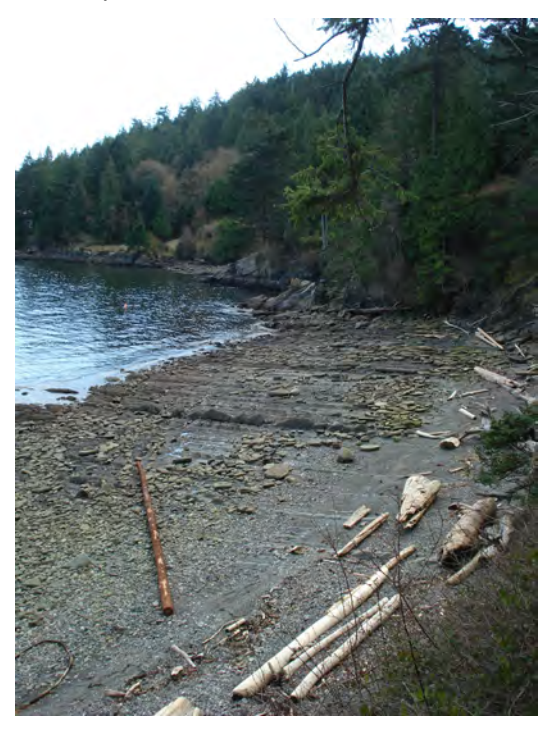
Ancia Road Beach

Ancia Road Ocean Access has a short, wide path leading to an extremely long staircase down to the beach. There is a bench halfway down the stairs, in case you need a rest! At low tide you can walk along the rocky shore to the other end of the bay. Saturna Island lies across the water.