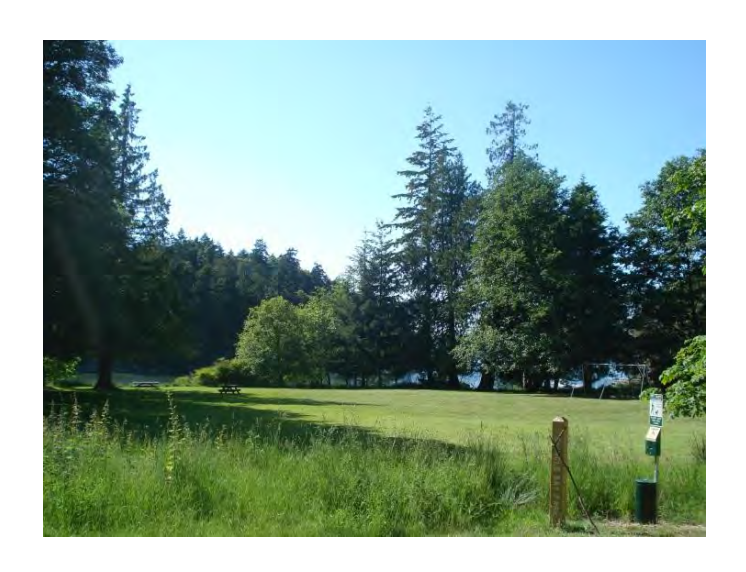
Shingle Bay Community Park

this park, with the entrances just across the street.