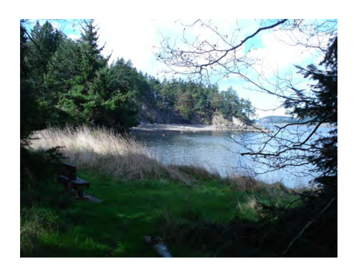
Mirada Road Ocean Access

This trail descends through a shady area filled with ferns, and then splits at the end. You can go right to steps leading to the rocky shore, or left to a bench with a view of Plumper Sound. This trail can be slippery and muddy in the wet season, so tread carefully.