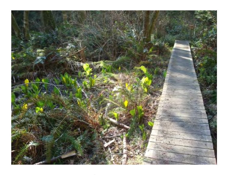
Capstan Lane/Rope Road Trail

significant stand of Grand Fir. You can go left on Privateers Road to take the Privateers / Schooner Trail #69.