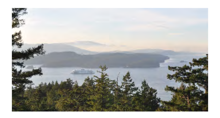
View from George Hill Summit

effort, looking out across Galiano, Mayne, and Salt Spring Islands. On a clear day the Olympic Range is visible.