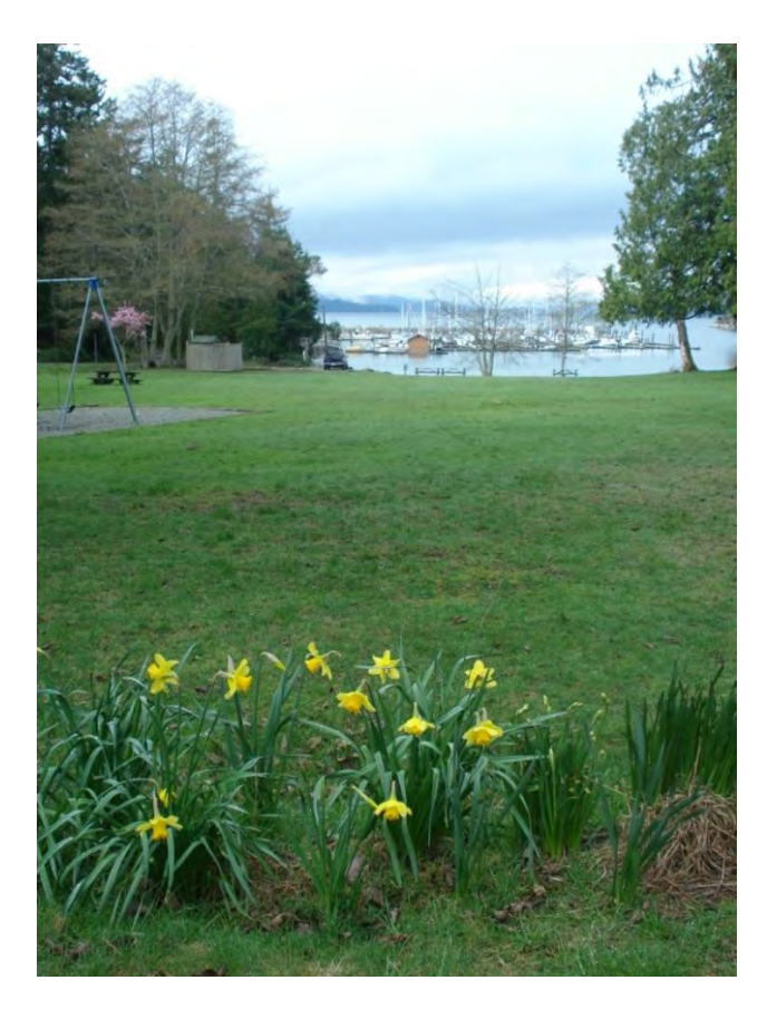
Thieves Bay Community Park