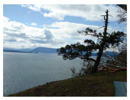
View from Oaks Bluff

bluffs. 2 viewpoints and 3 benches allow you to fully appreciate the scenery from 100 metres above sea level. The first view shows Bedwell Harbour Marina and South Pender, while the second looks toward Swanson Channel and Vancouver Island in the distance. The Olympic Mountains can be seen on a clear day, and the lucky visitor may see orcas passing below. This trail can be hazardous in wet or windy conditions, and caution is required at the top where there is a sheer cliff down to the water.