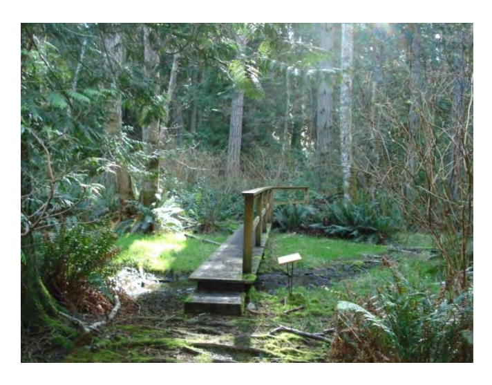
The Enchanted Forest