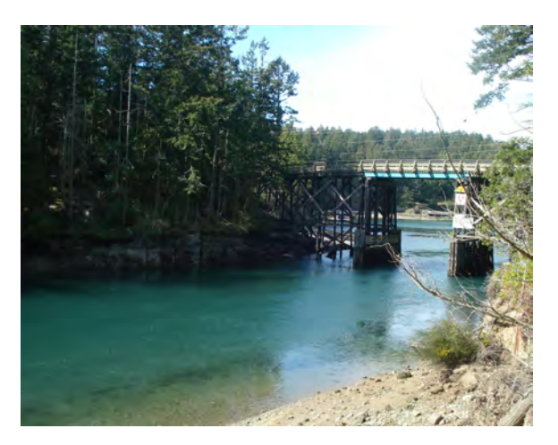
Bridge Park, South Pender Island

This short trail follows the canal between North and South Pender, and provides a great view of