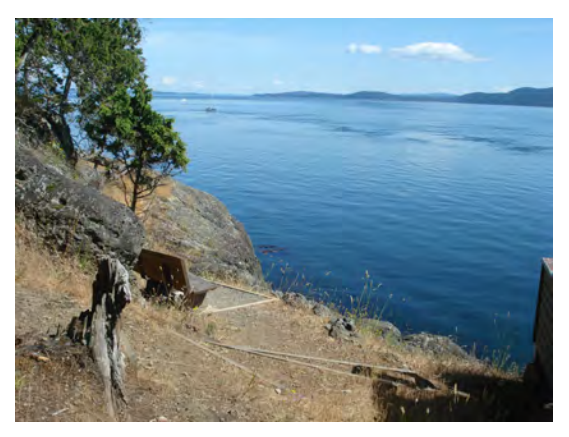
Plumper Way Viewpoint

A short trail leads to this view point that looks out into Boundary Pass. Here the border between Canada and the U.S. lies half way between the Penders and Stuart Island, one of the San Juan Islands in the U.S. This is the main