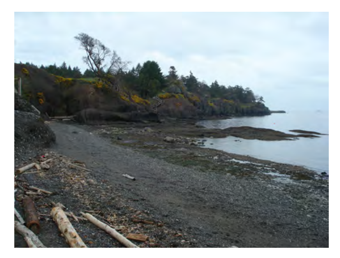
Craddock Road Beach