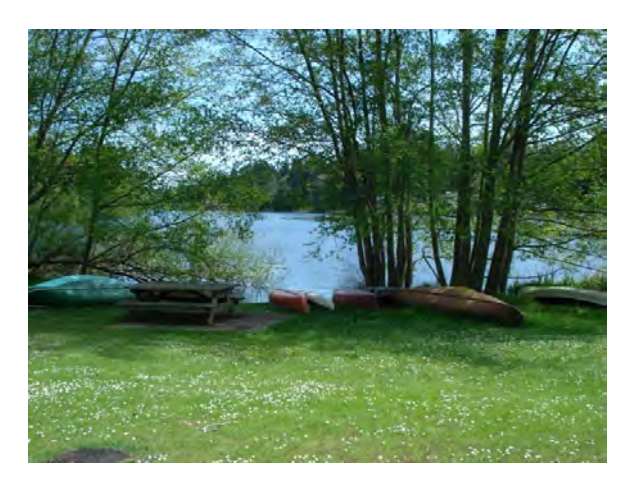
Magic Lake Picnic Site

This well used parkland is a favourite place for lakeside picnics and for launching kayaks and canoes.