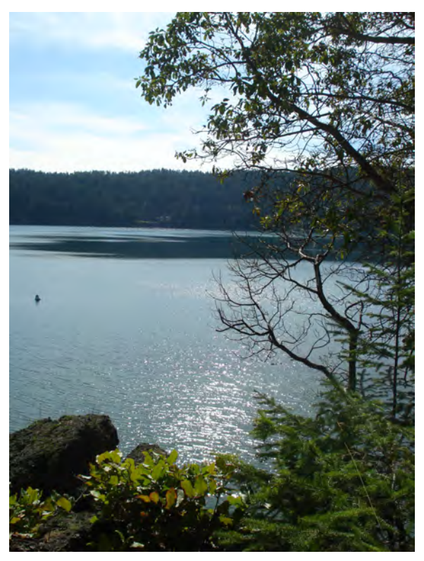
Ainslie Point Viewpoint