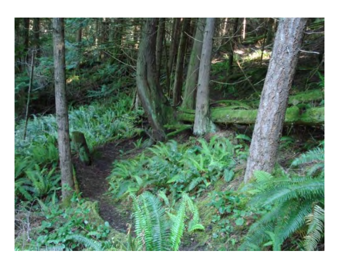
William Walker Trail

soft green covering for rocks and fallen trees. About half way up there is a huge old growth Fir tree, which can be admired from a little bench. Eventually the trail descends and connects with the Mount Norman Trail in the National Park Reserve. If you don't mind walking on the road you can create a loop hike by continuing back to the William Walker trailhead.