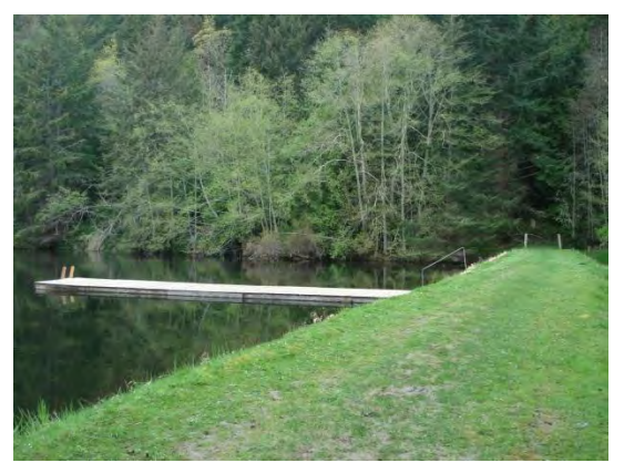
Magic Lake Swimming Hole

Access to the swim dock and float is down a few steps from the dam that retains the water in Magic Lake. There is a sturdy ladder attached to the dock, so getting out of the water after you swim is nice and easy. Please clean up after your dog as this is a water source for the community!