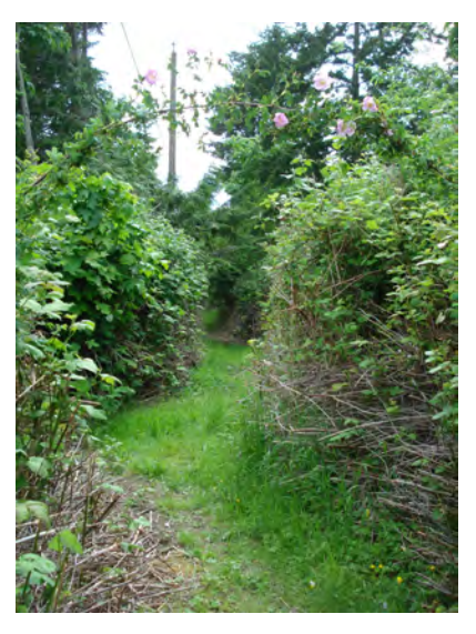
Blackberry Lane to Percival Cove

Also known as "Blackberry Lane", this trail is hedged on both sides by vigorous blackberry vines and wild roses, and is a wonderful place to stock up on local berries in the late summer.