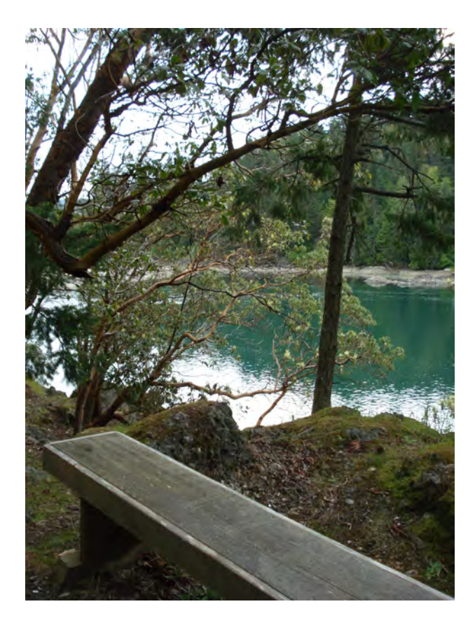
Mumford Road Viewpoint