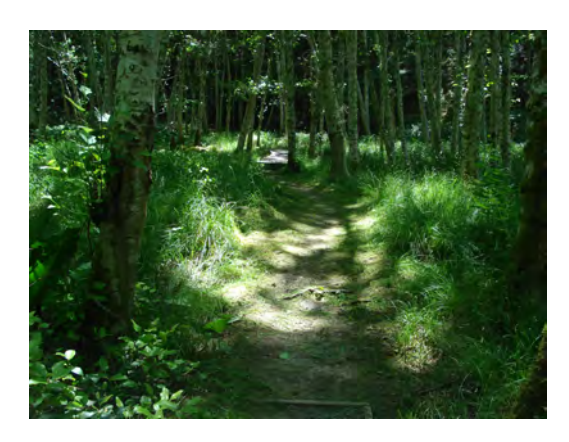
Sandy Sievert Park