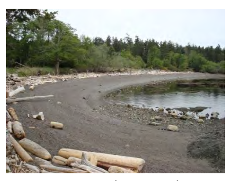
Drummond Bay Beach

Drummond Bay offers a large crescent shaped pebble beach with a huge collection of driftwood. The viewing platform at the entrance offers 2 benches, and is a beautiful place to enjoy the scenery.