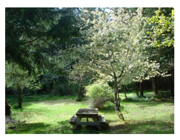
Lilias Spalding Heritage Park

There are historical remains here of a farm building, as well as heritage trees and shrubs. A large grassy area with picnic tables provides the perfect place for gatherings, and there is access to an outhouse. There is no access from Castle Road, but visitors can park off of Spalding Road, just past Castle Road, in the marked areas provided. You will need to walk up the steep paved fire access road to reach the park.