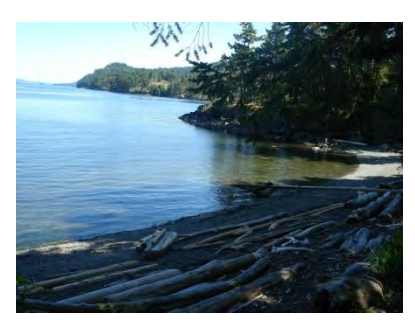
Welcome Bay Beach

and a short flight of steps takes you down to the crescent shaped pebble beach. The view includes Saturna and Mayne Islands, with a distant view of Mt. Baker on a clear day.