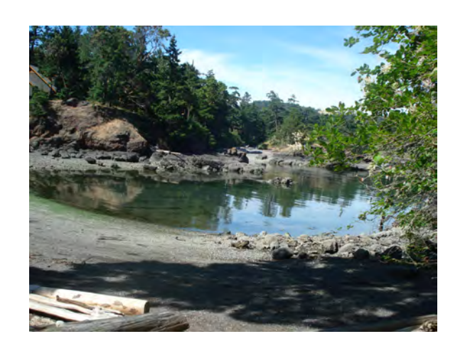
Peter Cove South