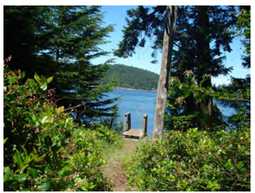
Tracy Road Stairs to Beach