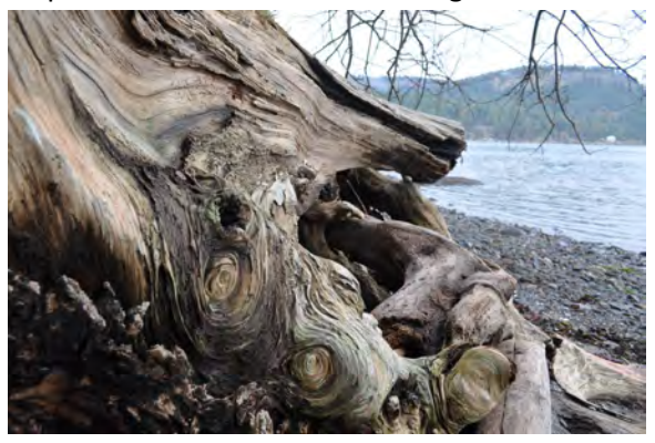
Found Road Ocean Access Driftwood

the surrounding private properties, and don't step on the numerous banana slugs!