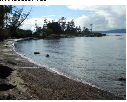
Beach at MacKinnon Road Ocean Access