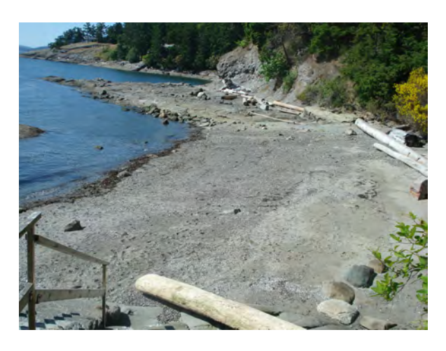
Bridges Road Beach Access

This sandy crescent shaped beach is ideal for