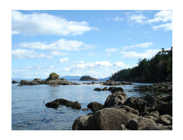
Boundary Pass Ocean Access