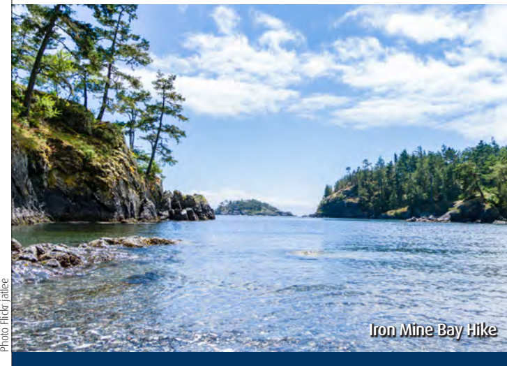
Iron Mine Bay Hike