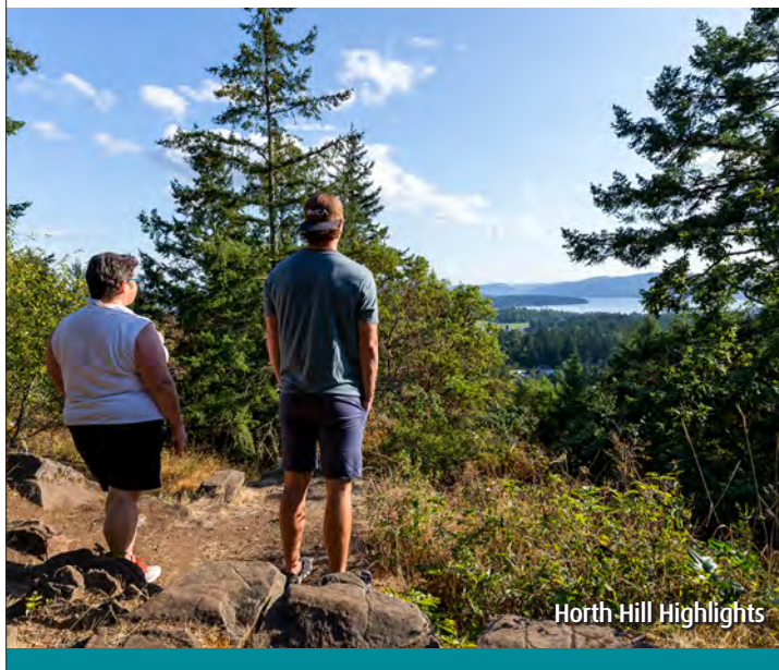
Horth Hill Highlights

Check out this delightful park at the tip of the Saanich Peninsula. Along with a CRD Regional Parks naturalist, discover the plants at your feet, the birds over your head and great views from the top. Wear sturdy footwear. Meet at the information kiosk in the parking lot off Tatlow Road.