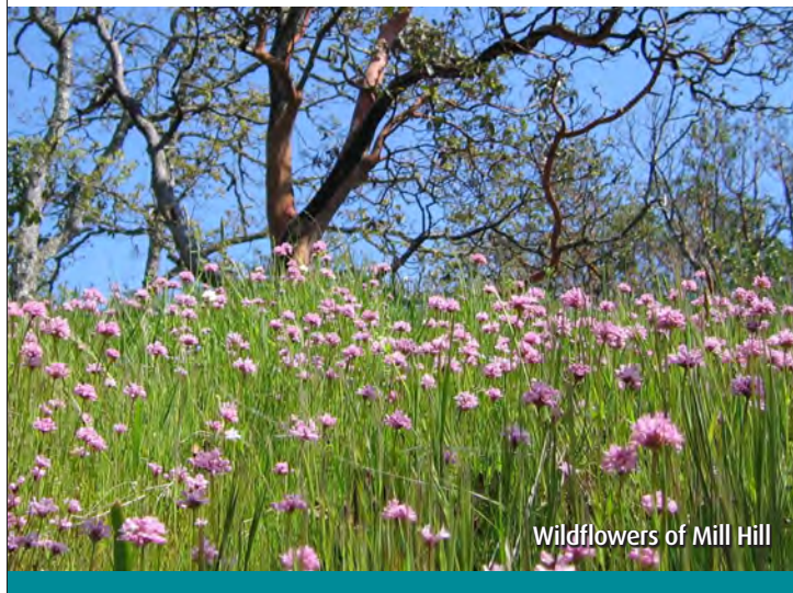
Wildflowers of Mill Hill