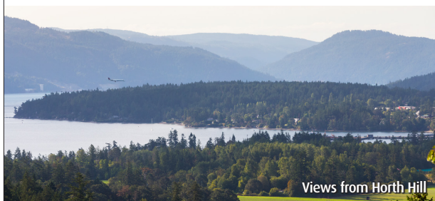
Views from Horth Hill

Check out this delightful park at the tip of the Saanich Peninsula. Along with a CRD Regional Parks naturalist, discover the plants at your feet, the birds over your head and great views from the top. Wear sturdy footwear. Meet at the kiosk off Tatlow Road.