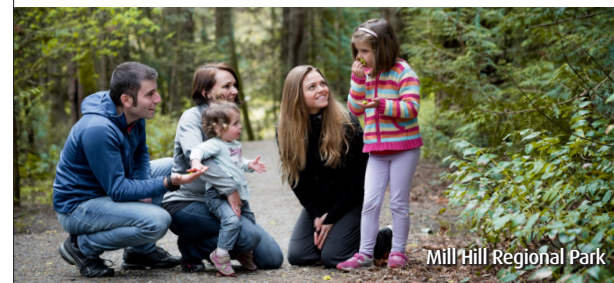
Mill Hill Regional Park