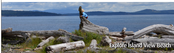
Explore Island View Beach

We can co-exist with these magnificent forest dwellers. Join a CRD Regional Parks naturalist to learn about the natural history of the black bear. Meet at the kiosk in the Aylard Farm parking lot off Beecher Bay Road.