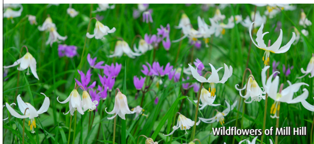
Wildflowers of Mill Hill