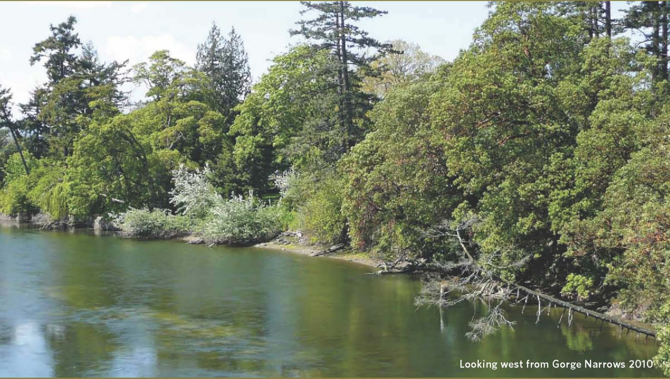
Looking west from Gorge Narrows 2010