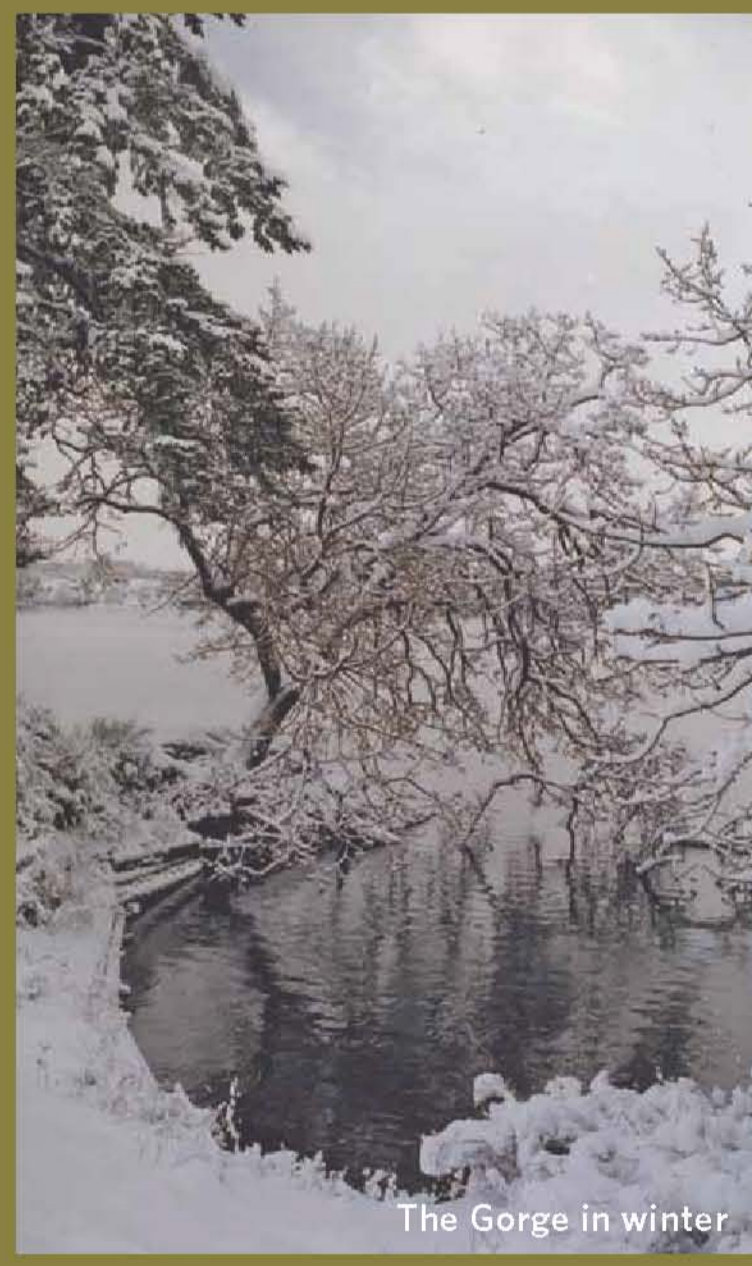
The Gorge in winter

Native trees such as Douglas-fir, arbutus and bigleaf maple provide important roosting and nesting sites for the many seasonal and resident birds that live along the Gorge Waterway.