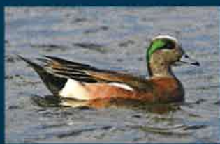
American Wigeon

The waterway is also part of the Federally designated Victoria Harbour Migratory Bird Sanctuary.