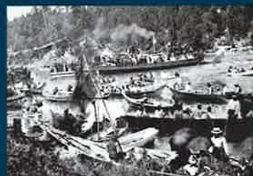
Gorge Regatta 1887

This waterway has seen many changes since its formation after the last ice age. Once a food-gathering place for First Nations people, it became a popular recreation destination after the establishment of Fort Victoria in 1843. For several decades raw sewage from surrounding areas was dumped directly into the waterway, making it unsafe for swimming. In recent years strong public interest has resulted in community and government efforts to restore and revitalize this beautiful and unique waterway. The Gorge is once again a popular recreation site for boating and fishing, and the water is often safe for swimming.