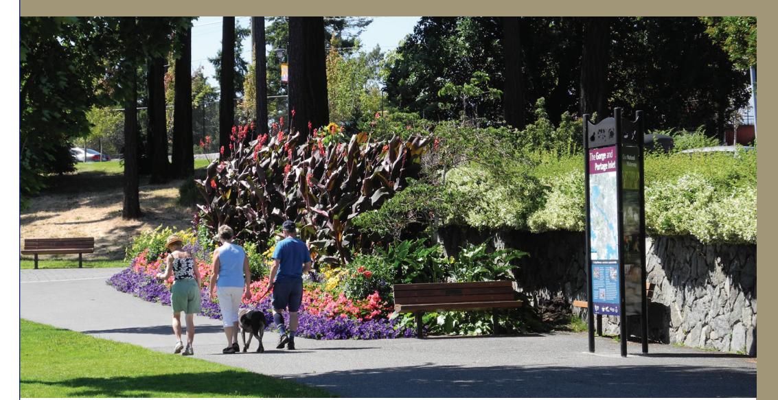
GWI interpretive sign in Esquimalt Gorge Park