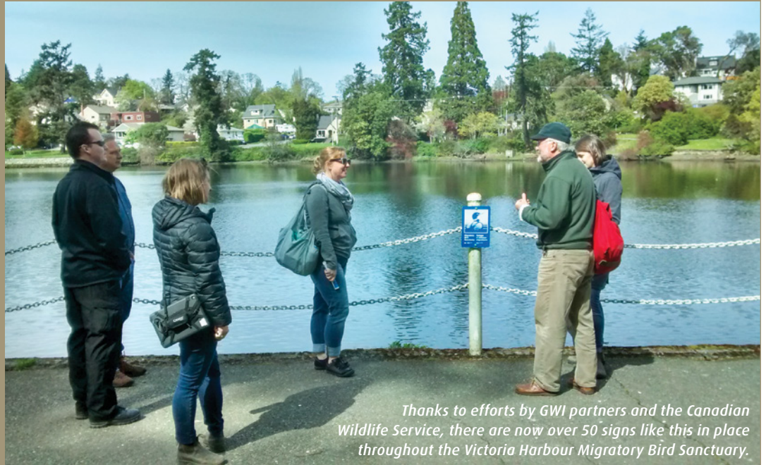
Thanks to efforts by GWI partners and the Canadian Wildlife Service, there are now over 50 signs like this in place throughout the Victoria Harbour Migratory Bird Sanctuary.