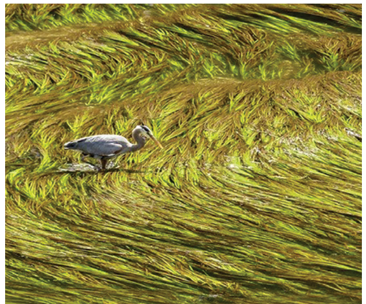
Lush eelgrass meadows in the Gorge Waterway offer ideal feeding grounds for the Pacific Great Blue Heron, a federally listed Species of Special Concern.

GWI provided input to Saanich on a proposed dock expansion at Victoria Canoe & Kayak Club. Members also provided input to the City of Victoria regarding the lighting regime at the new Johnson Street bridge, to reduce potential impacts to fish and other marine life passing beneath it. Esquimalt staff presented highlights of proposed revisions to their official Community Plan at a GWI meeting.