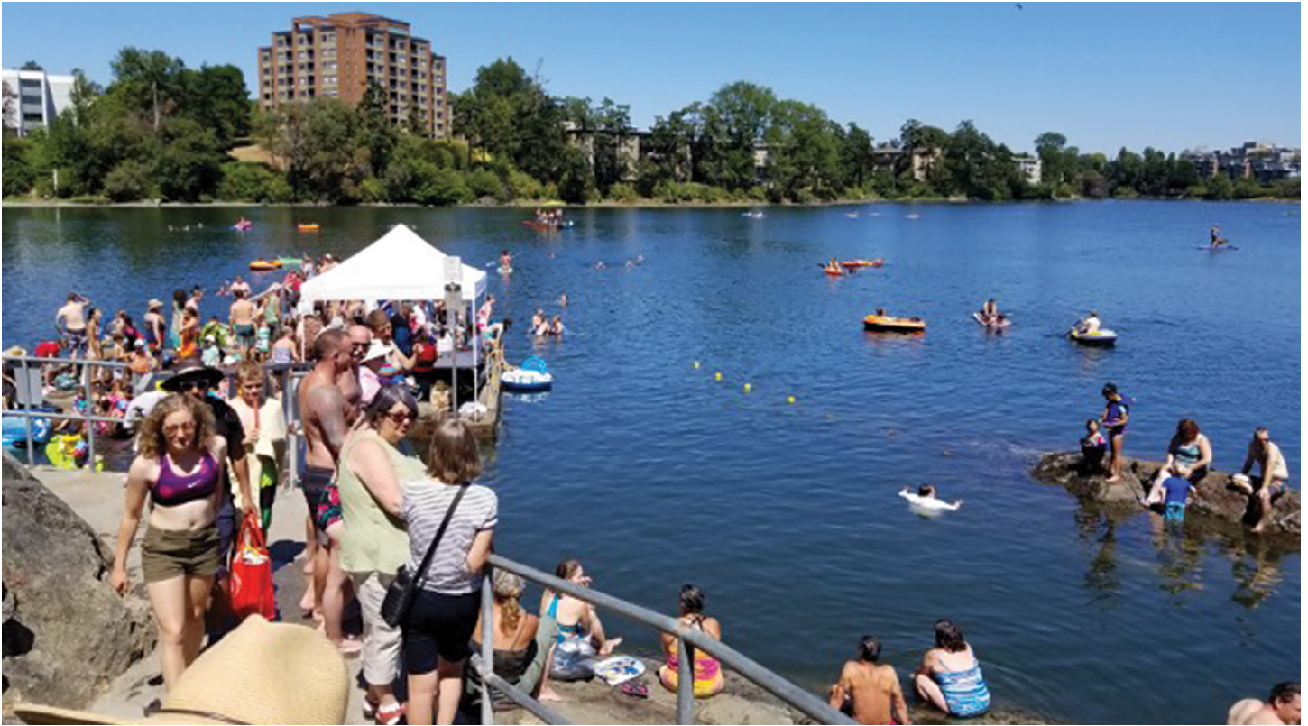
Water quality has improved in the Gorge in recent years, and there are now monthly swim events throughout the year. Not surprisingly, the largest crowds come out in July for the annual Gorge Swim Fest.