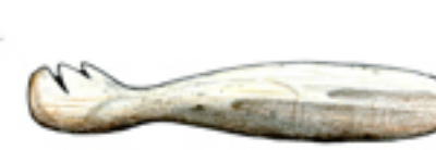
MINIATURE WAR CLUB