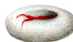
MORTAR OR STONE BOWL