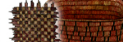
PLAITED SPLINT BASKETRY FRAGMENT