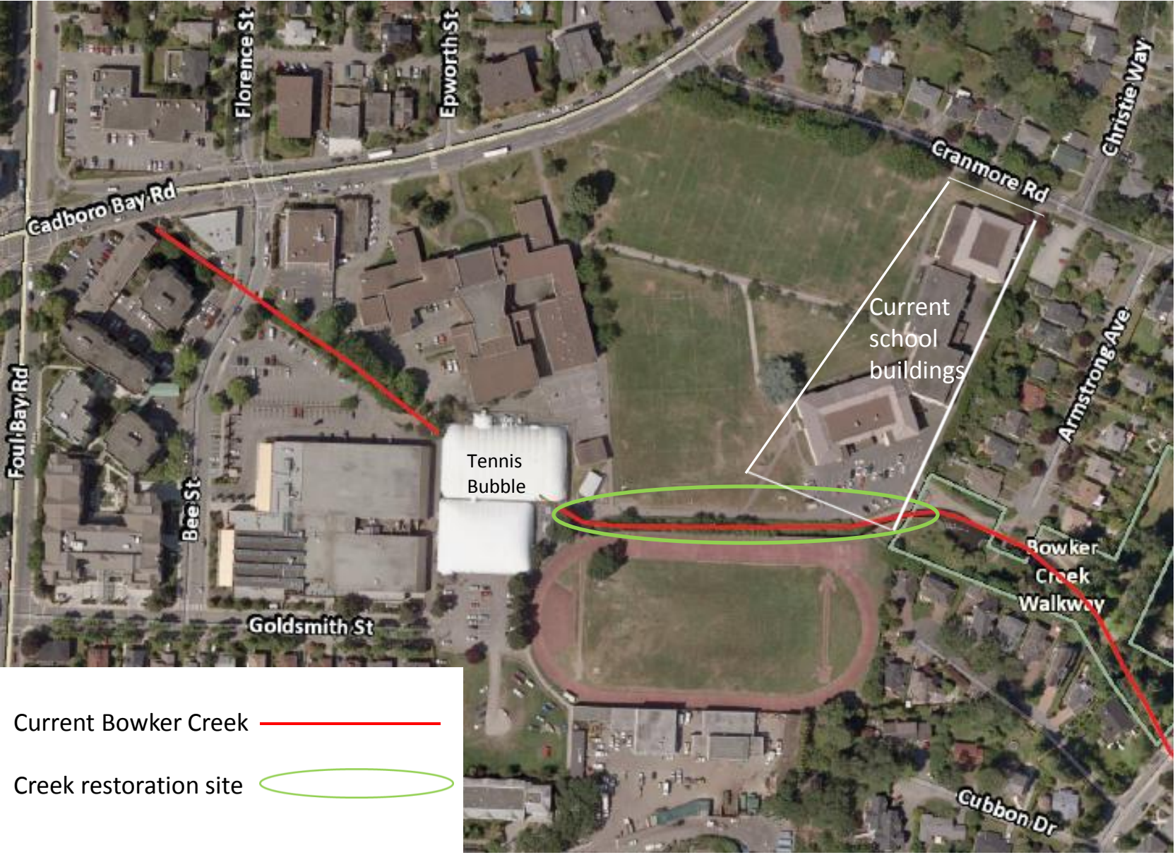
Current school site with Bowker Creek project area identified (2011)