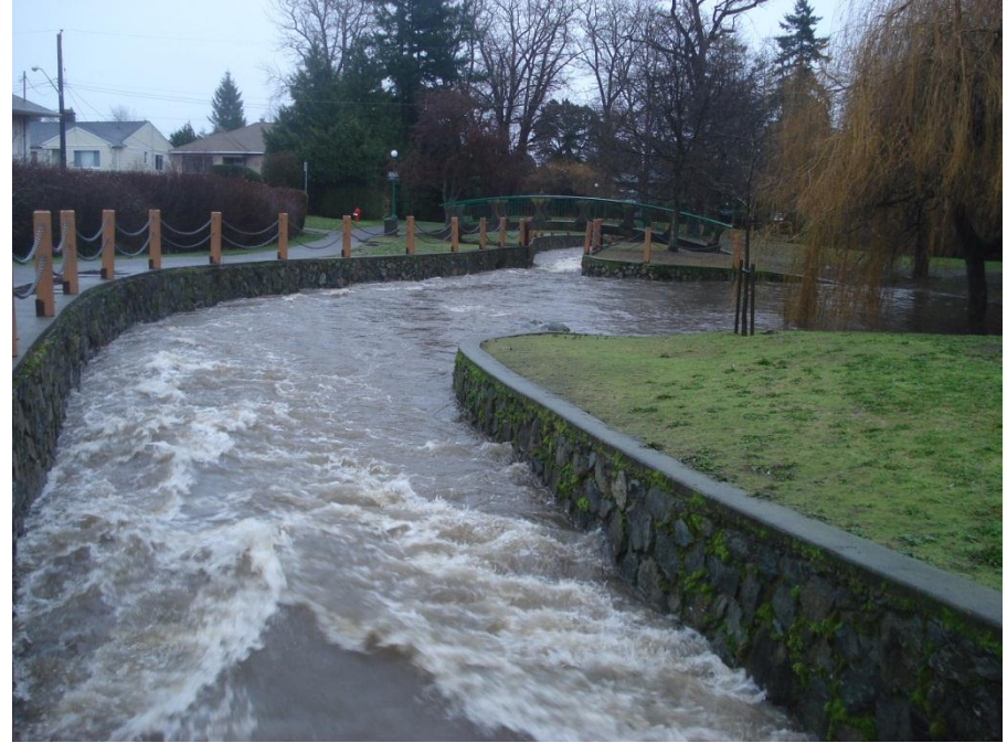
Similar perspective during a typical flash storm event