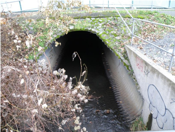
Bowker Creek as it emerges from culvert under the tennis bubble