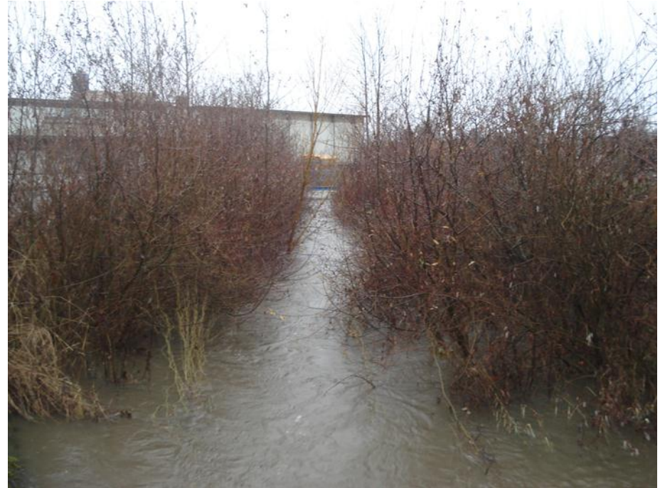
Similar perspective (a little upstream on school site) during a typical flashy storm event