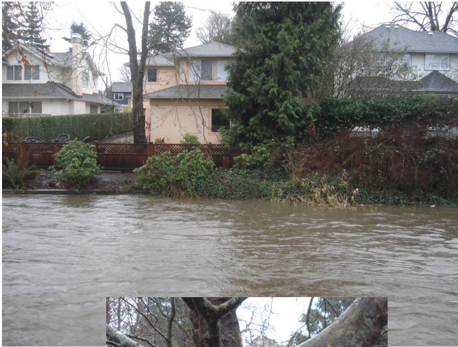
Bowker Creek as it leaves the Oak Bay High site and enters into community park during a typical flashy storm event (2010)