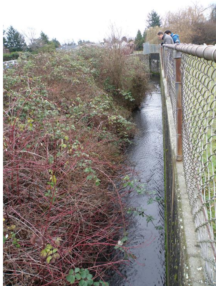
Oak Bay High on left, municipal recreation centre on right (walled side with track near fence line). Note: invasive plants strongly dominate.