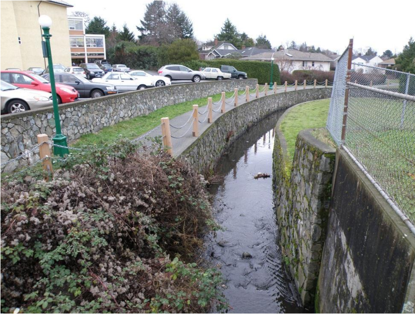
Oak Bay High on left, municipal recreation centre on right, creek at typical flow. NOTE: new school will be relocated on site well away from creek & current buildings demolished.