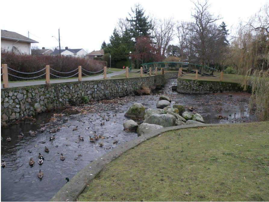
Bowker Creek as it leaves the Oak Bay High site and enters into community park, creek at typical flow