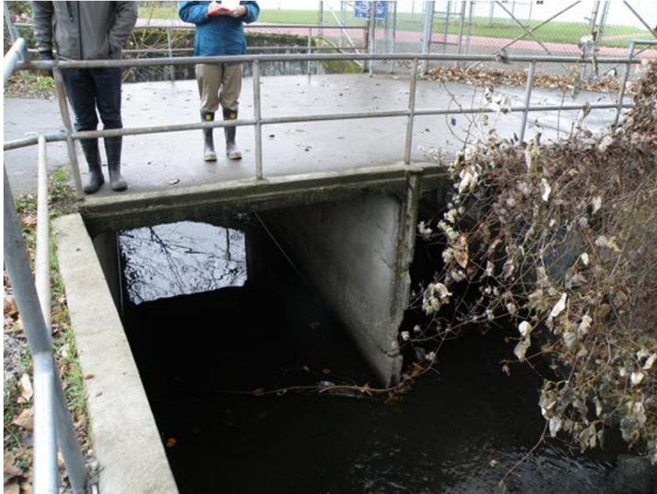
Foot bridge from school to municipal recreation facilities, creek at average flow