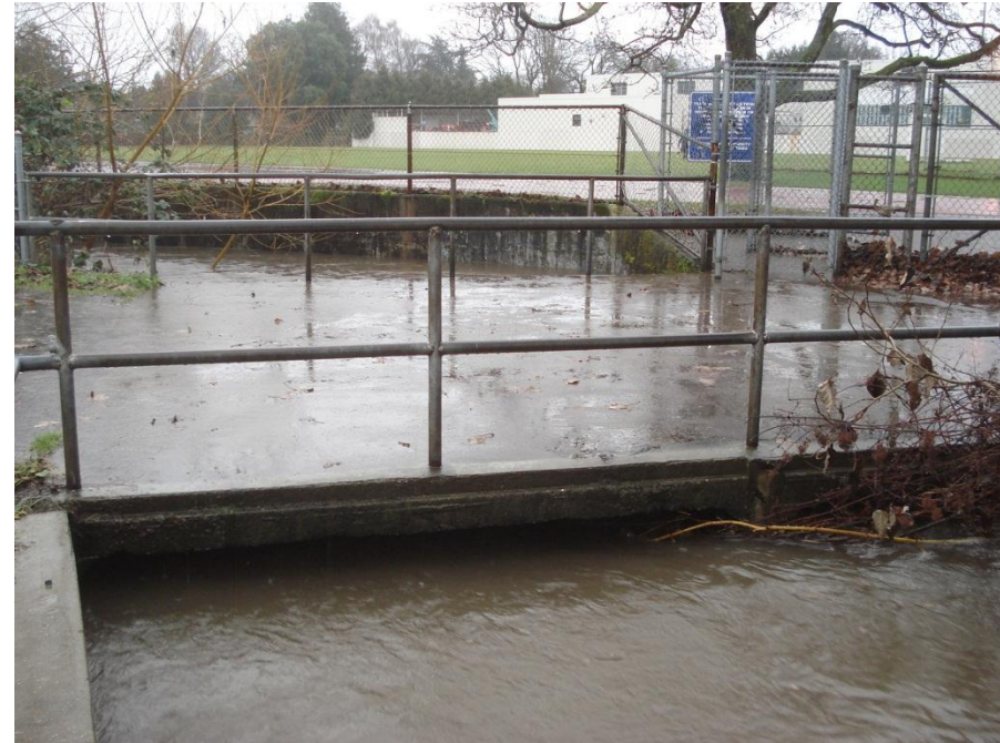
Same perspective of footbridge during a typical flashy storm event