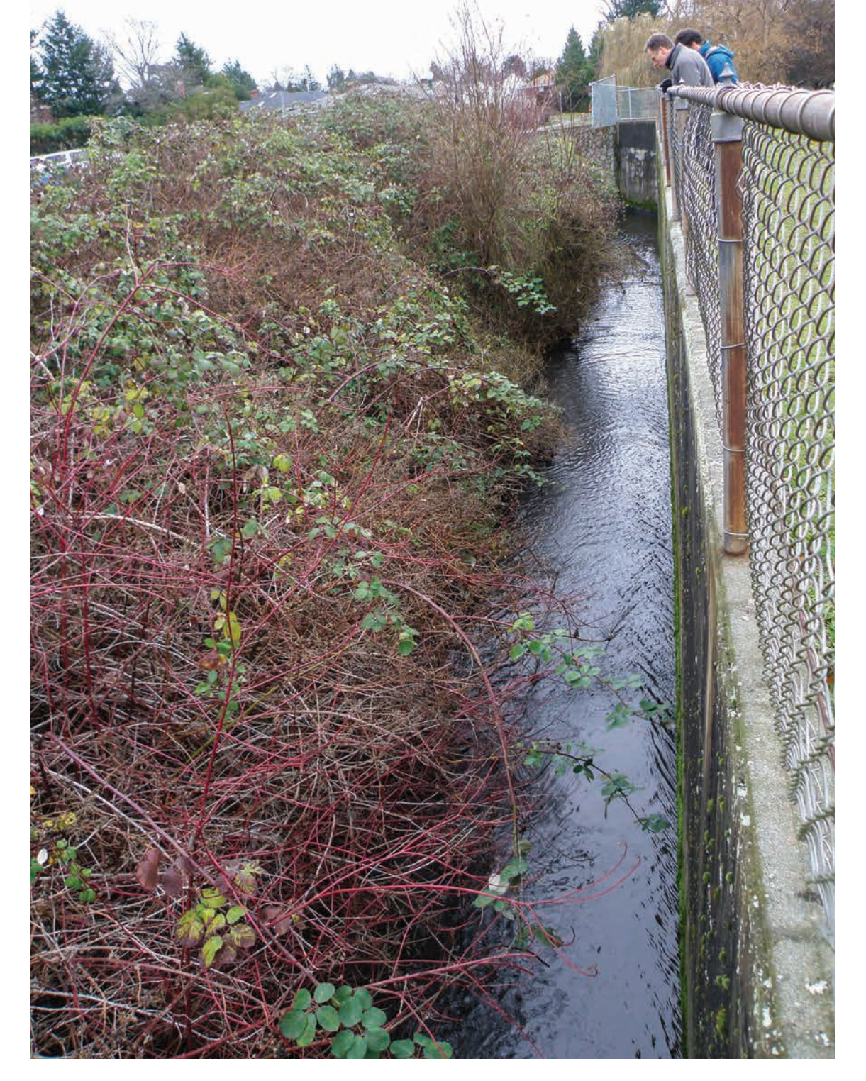
Before the restoration, Bowker Creek flowed through a narrow concrete channel, overgrown by invasive blackberries and golden willow.