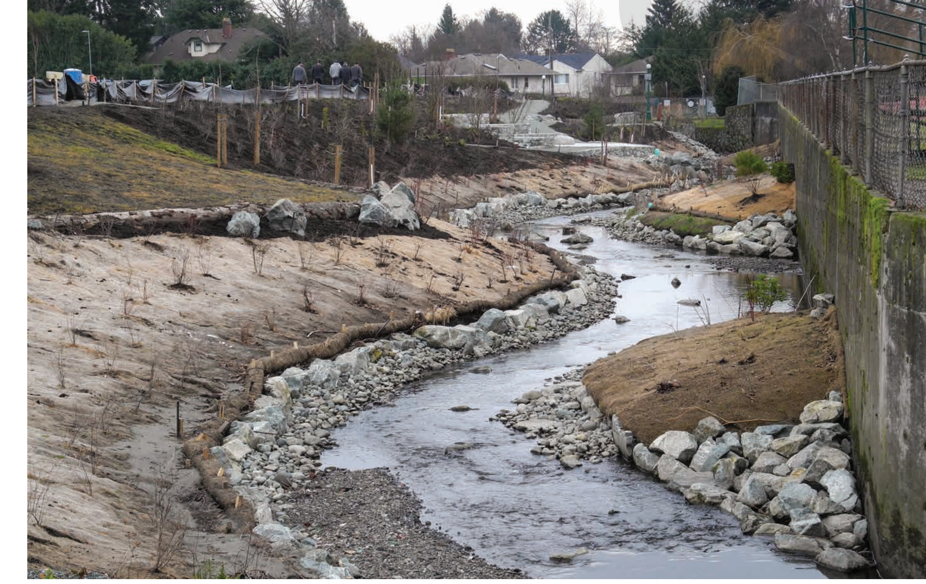
Following creek bank re-contouring, the riparian area was replanted with native trees, shrubs and perennials including Pacific big leaf maple, Garry oak, Douglas-fir, red osier dogwood, snowberry, Nootka rose, native grasses and many other species.

Oak Bay High School was awarded LEED Gold certification in January 2018 for sustainable initiatives including a stormwater retention system to reduce flooding, erosion and the release of contaminants into Bowker Creek.