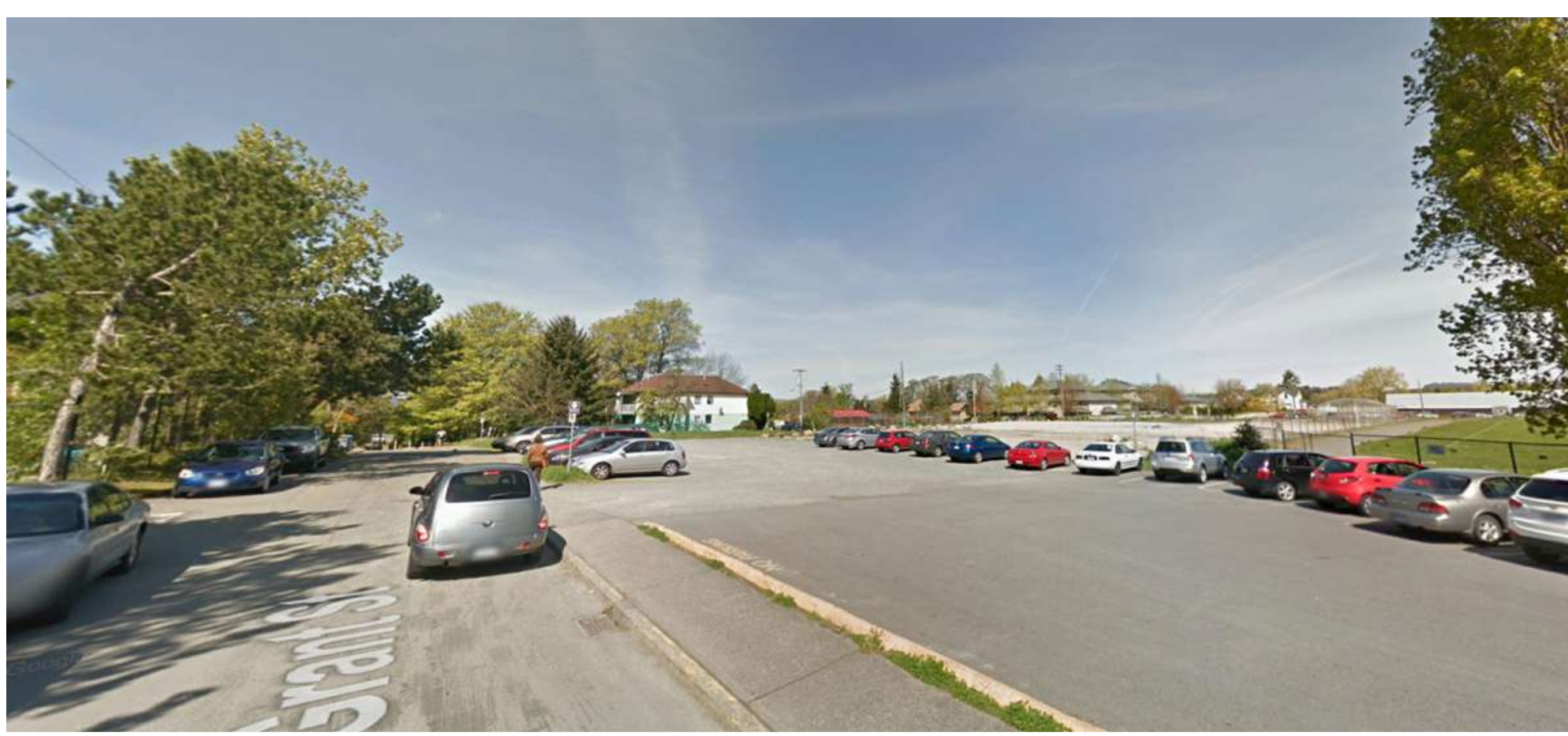
BEFORE LOOKING WEST - FROM GRANT STREET