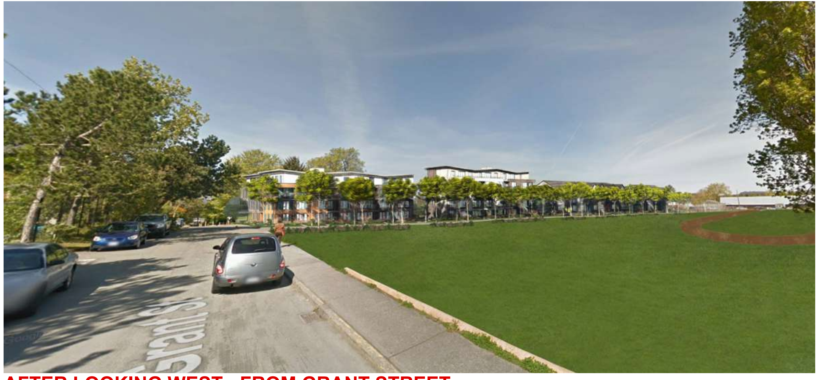
AFTER LOOKING WEST - FROM GRANT STREET