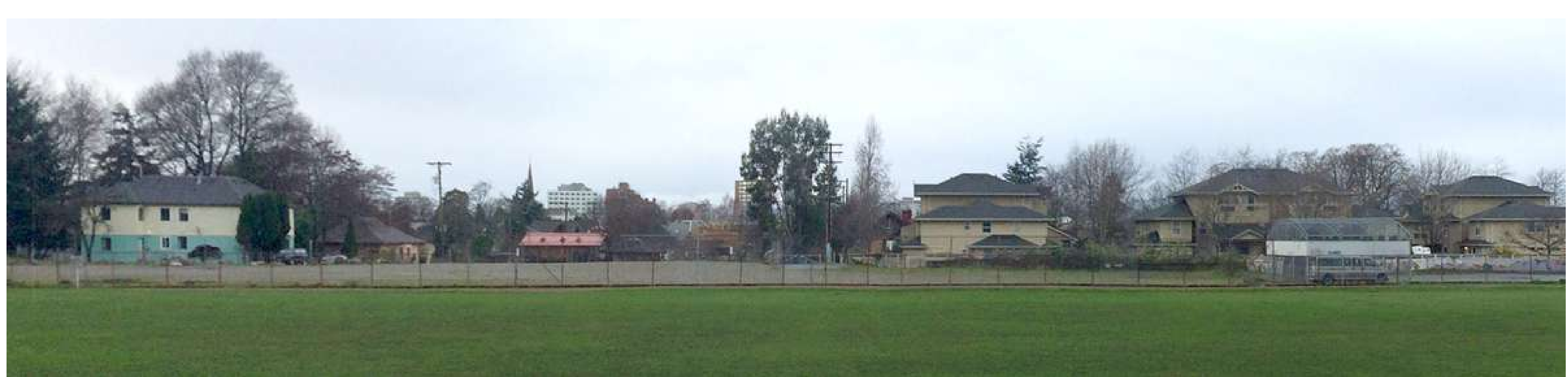
BEFORE - LOOKING WEST - FROM VIC HIGH