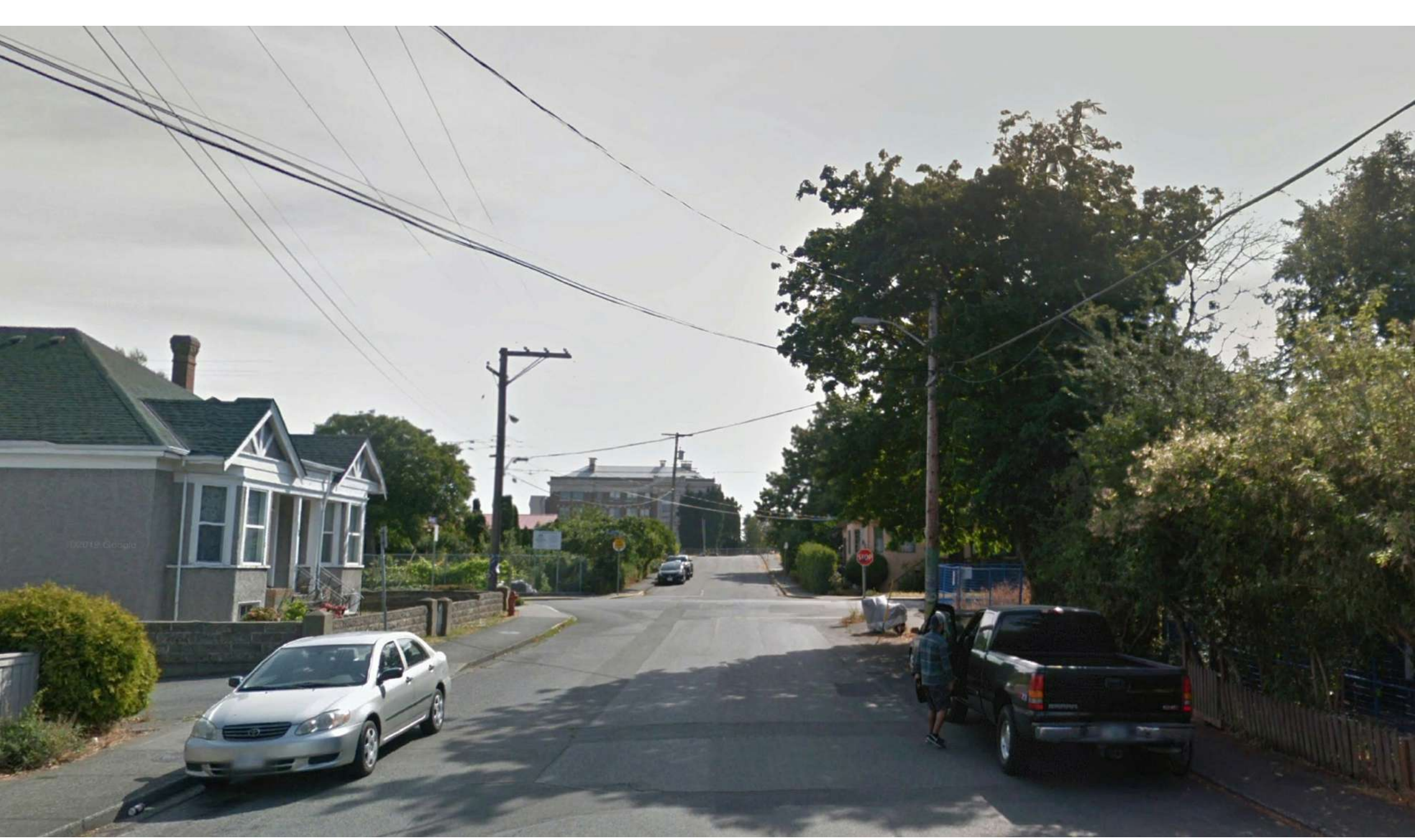
BEFORE LOOKING EAST - FROM NORTH PARK ST.