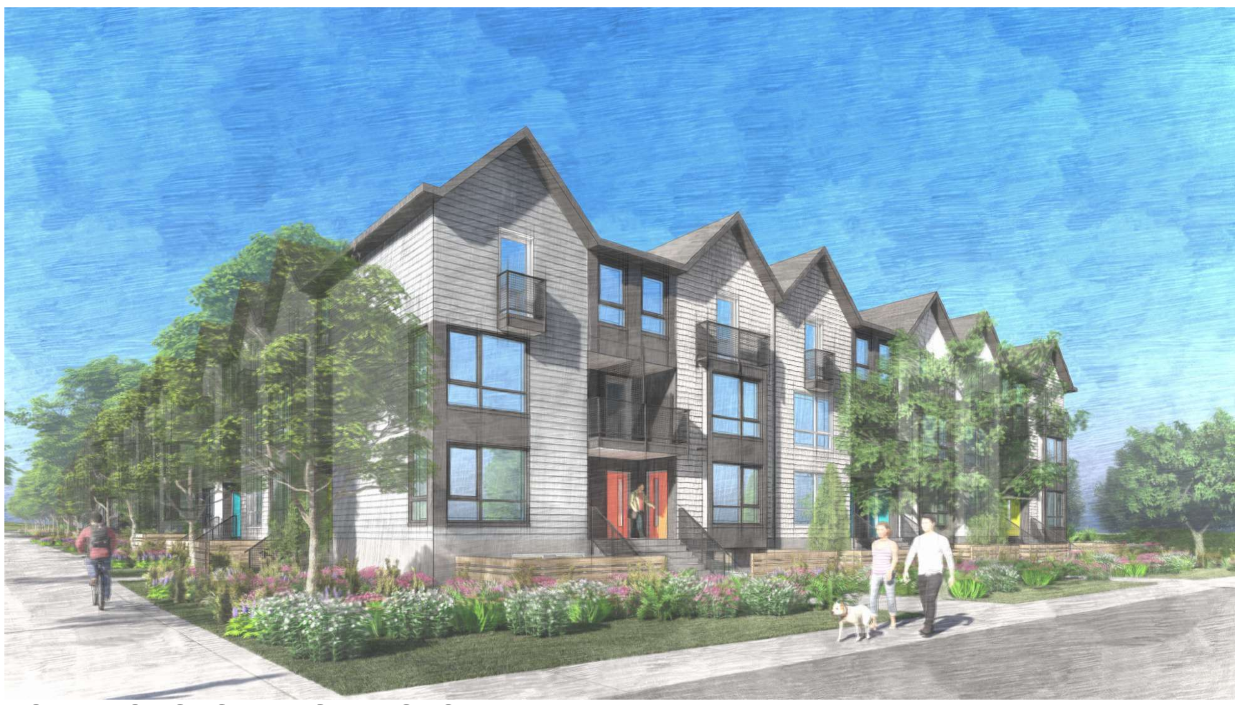
TOWNHOUSES - AT GLADSTONE AVENUE