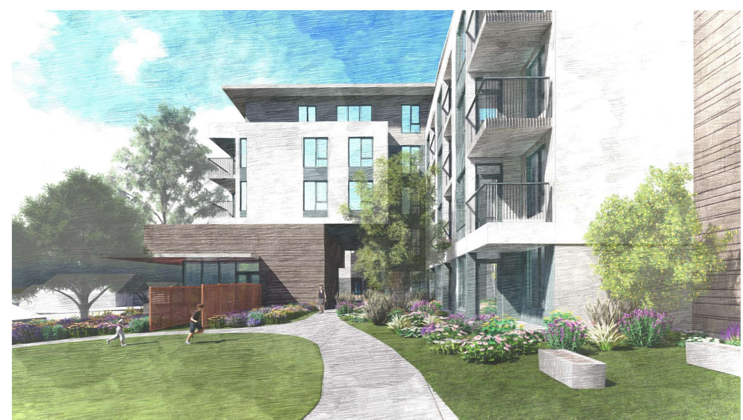
APARTMENT - AT GRANT STREET