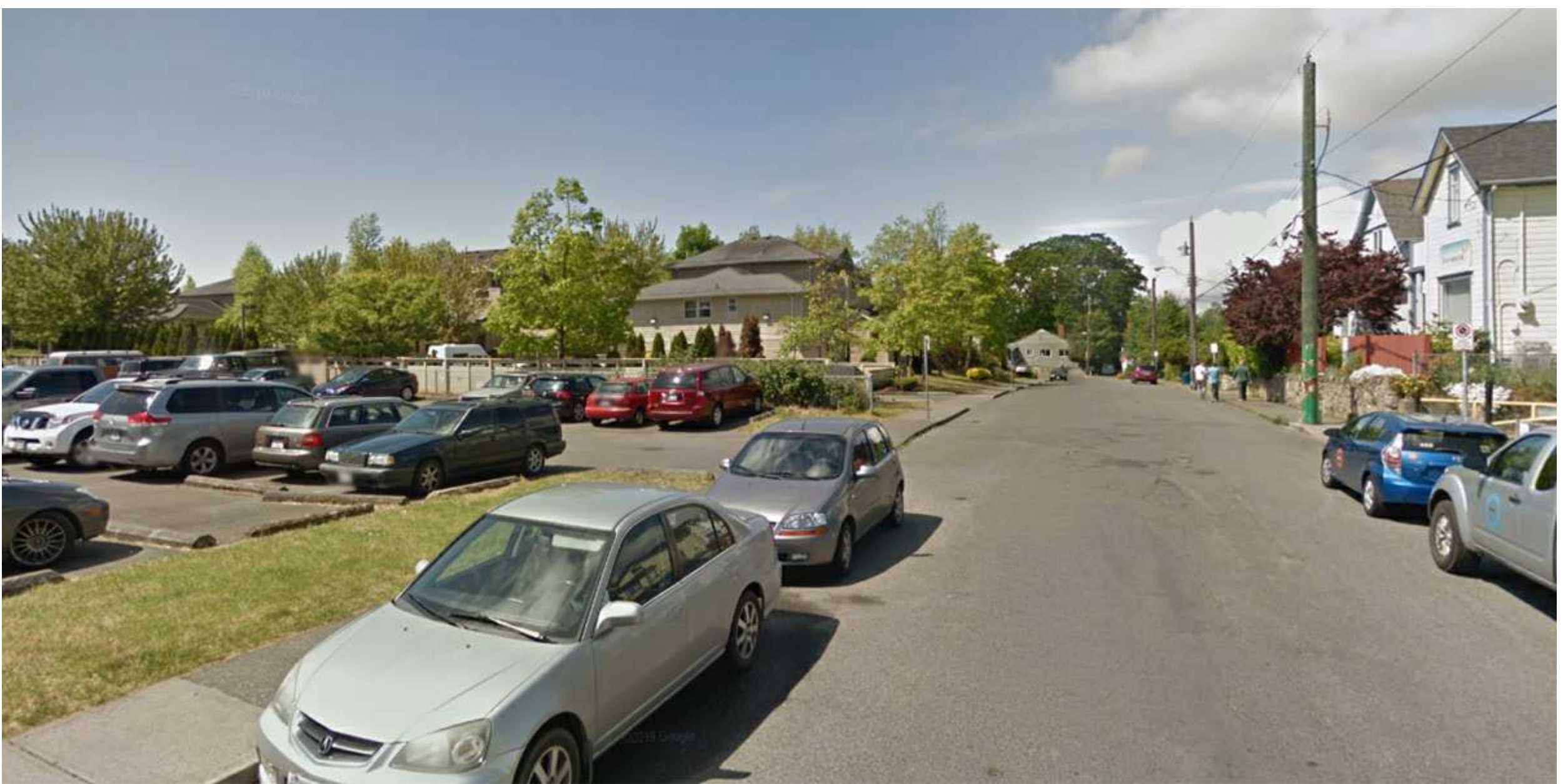
BEFORE - LOOKING WEST - FROM GLADSTONE AVENUE