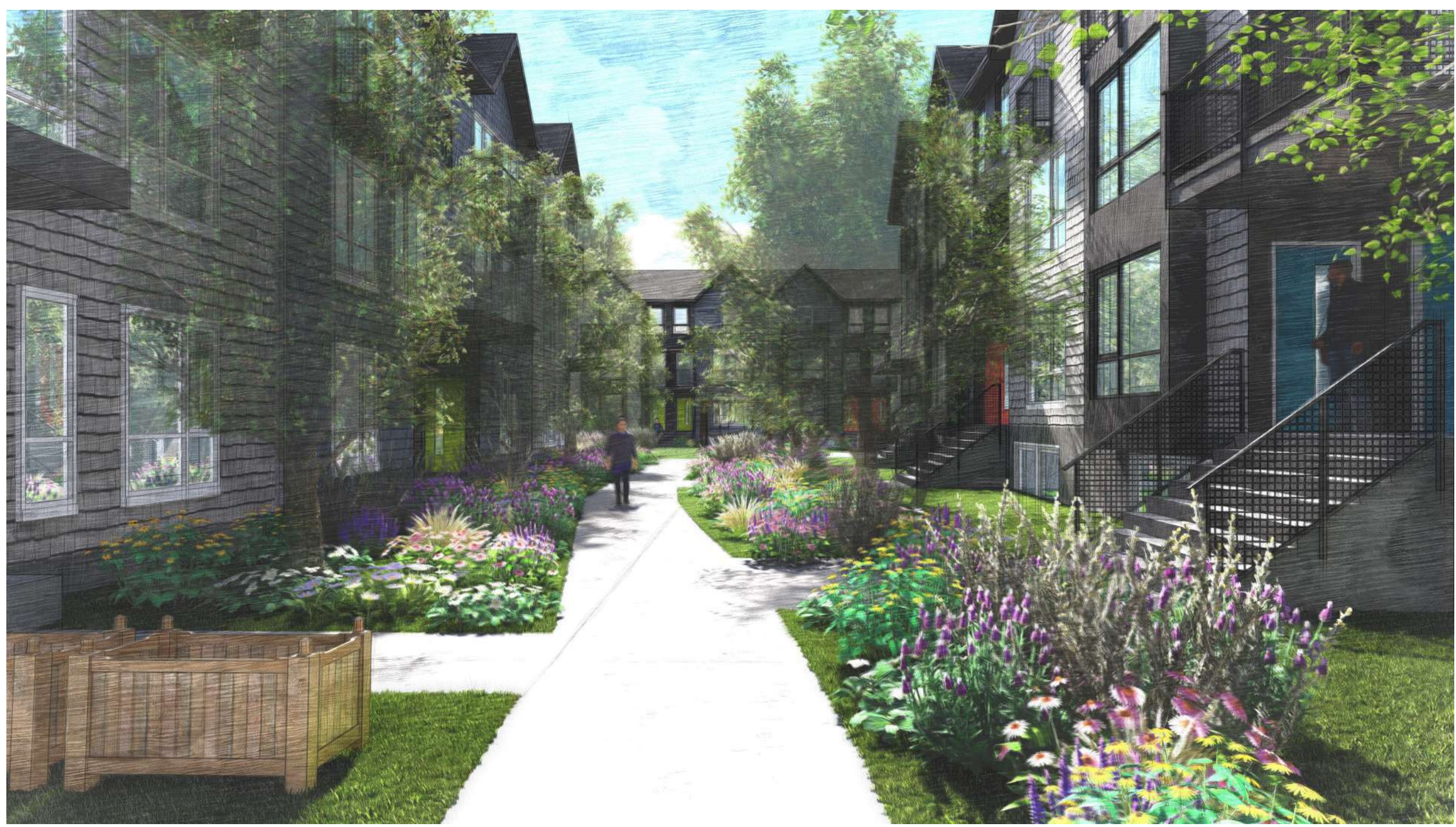
INTERIOR COURTYARD - LOOKING NORTH