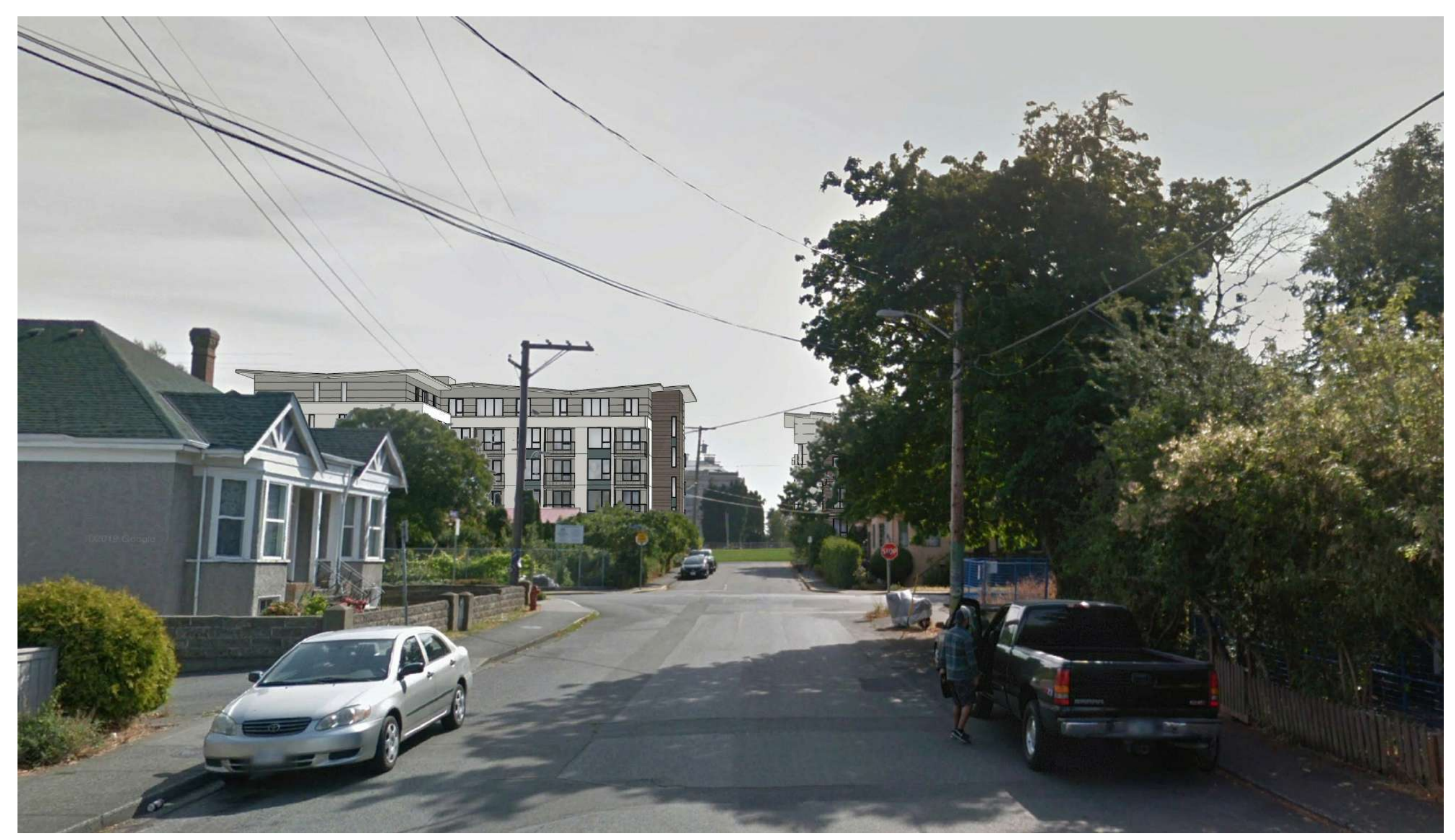
AFTER LOOKING EAST - FROM NORTH PARK ST.