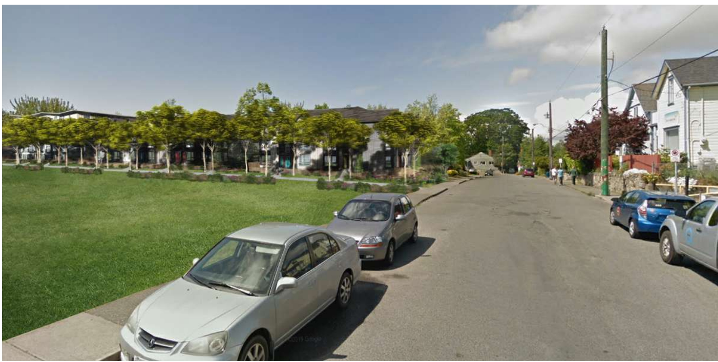
AFTER LOOKING WEST - FROM GLADSTONE AVENUE