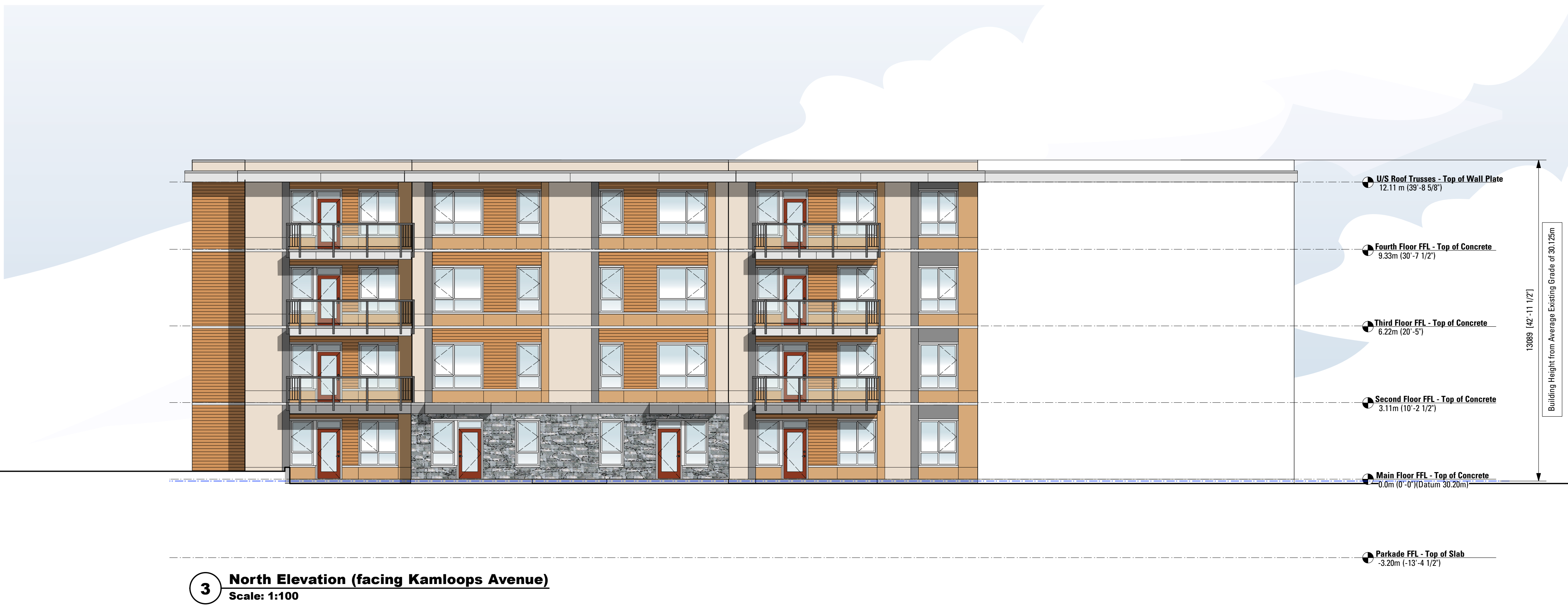
3 North Elevation (facing Kamloops Avenue) Scale: 1:100