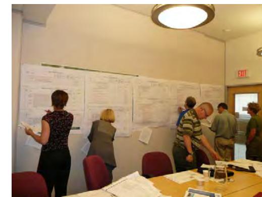
Figure 3. The Bowker Creek committees at work on the draft Blueprint