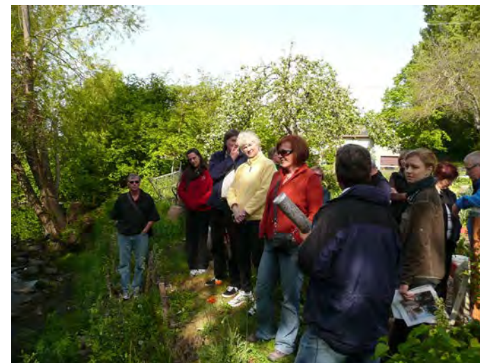
Figure 1. Watershed tour with municipal elected representatives, May 2009