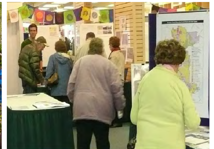
Figure 2. Blueprint public consultation, February 2010