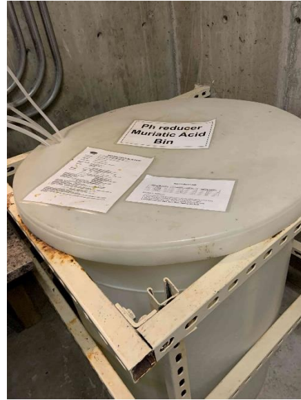
Tank that is Exposed to Mechanical Room