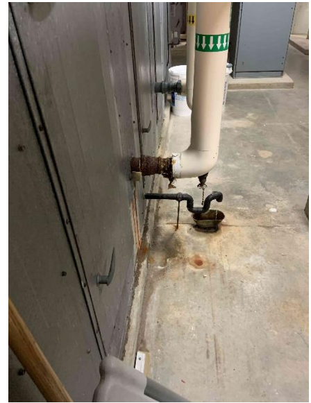
Exposed Pipe Rusted