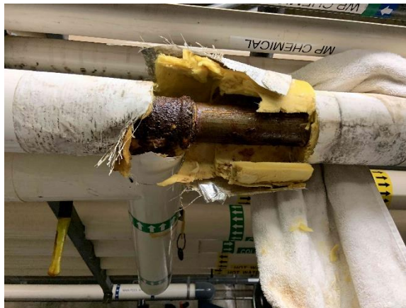
Insulation Comprised and Pipe Rusting