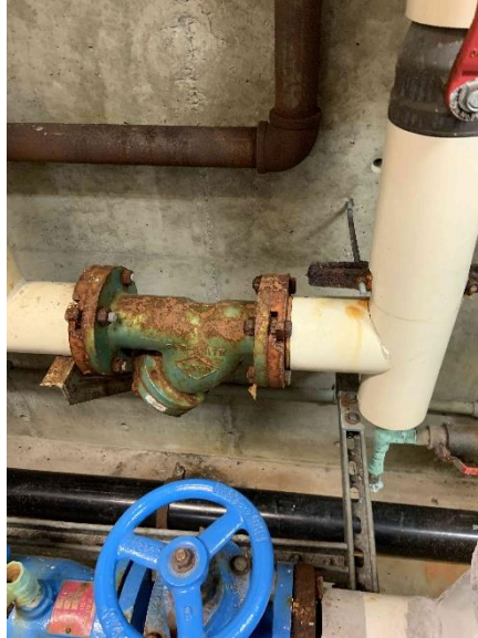
Exposed Strainer and Flange Condensing