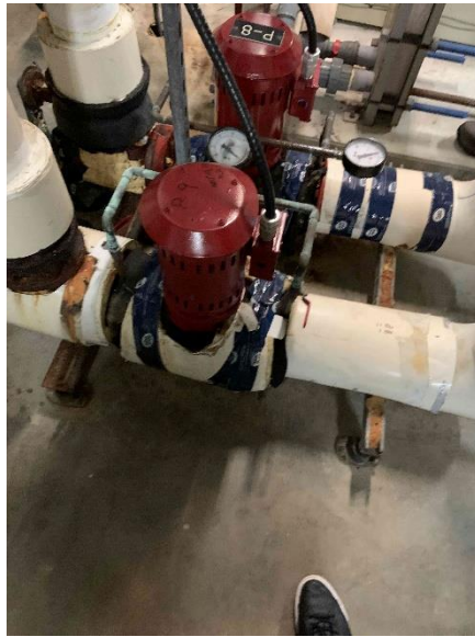
Body of Pump Rusting. Requires Thermal Blanket around Pump Body