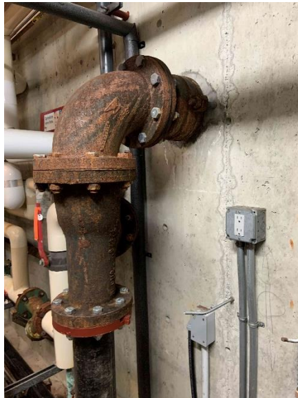
Exposed Domestic Water Piping Corroded