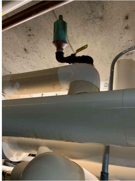
Automatic Air Vent Rusted