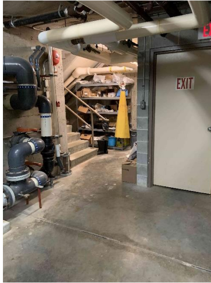
Possible Location to move Acid Tank and Install in a separate Closet with exhaust fan.