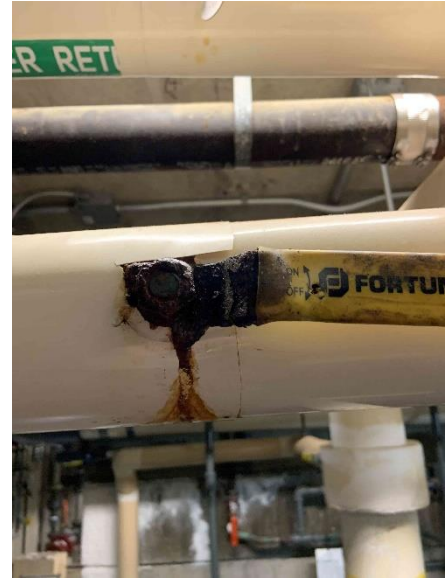
Isolation Valve Insulation Compromised and Causing Pipe Corrosion.