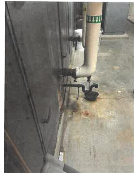
Exposed Pipe Rusted