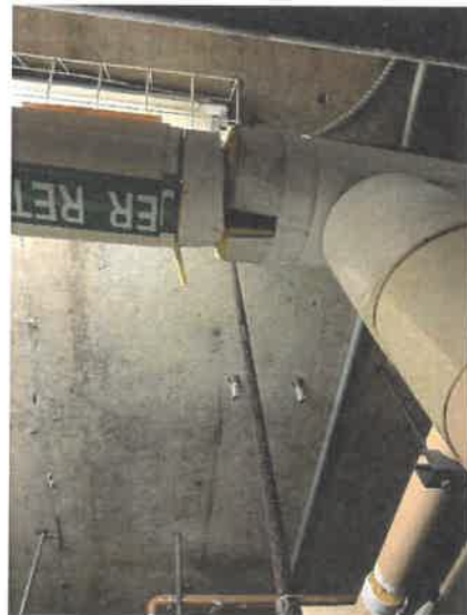
Vapour Barrier Compromised on Piping Systems