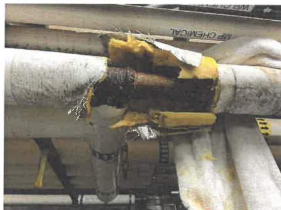
Insulation Comprised and Pipe Rusting