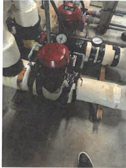
Body of Pump Rusting. Requires Thermal Blanket around Pump Body