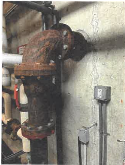
Exposed Domestic Water Piping Corroded