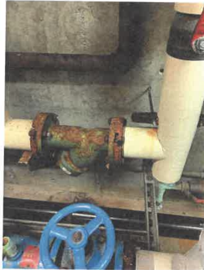
Exposed Strainer and Flange Condensing