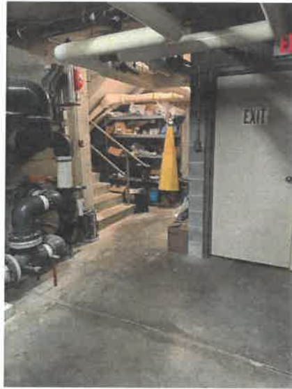
Possible Location to move Acid Tank and Install in a separate Closet with exhaust fan.