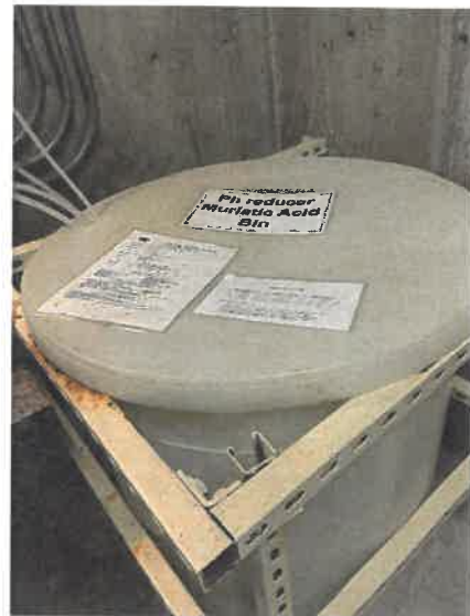
Tank that is Exposed to Mechanical Room