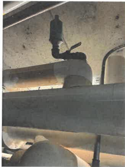
Automatic Air Vent Rusted