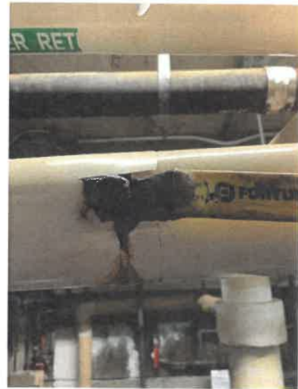
Isolation Valve Insulation Compromised and Causing Pipe corrosion.