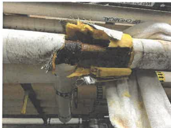
Insulation Comprised and Pipe Rusting