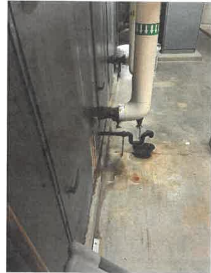
Exposed Pipe Rusted