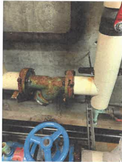
Exposed Strainer and Flange Condensing