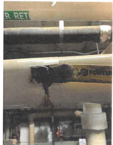
Isolation Valve Insulation Compromised and Causing Pipe corrosion.