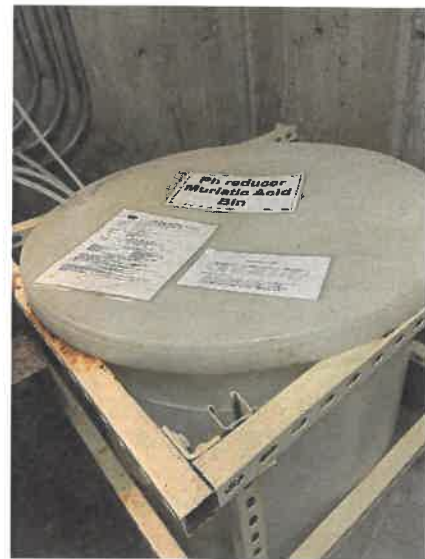
Tank that is Exposed to Mechanical Room