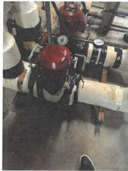
Body of Pump Rusting. Requires Thermal Blanket around Pump Body