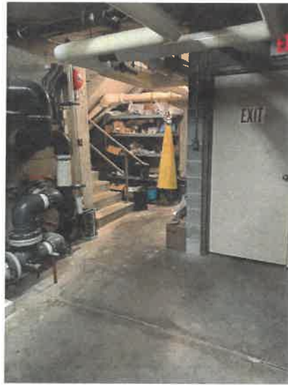
Possible Location to move Acid Tank and Install in a separate Closet with exhaust fan.