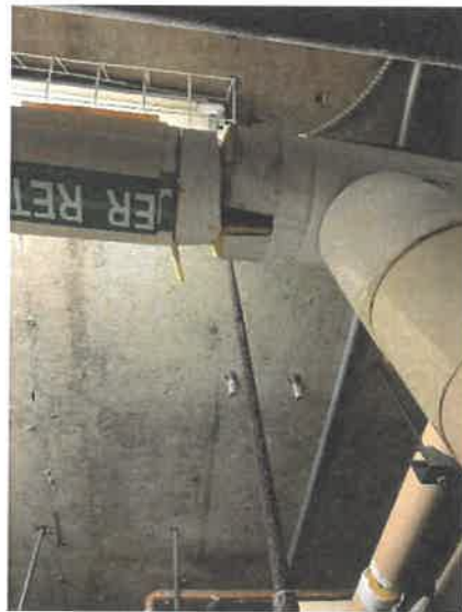
Vapour Barrier Compromised on Piping Systems