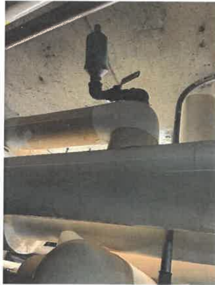
Automatic Air Vent Rusted