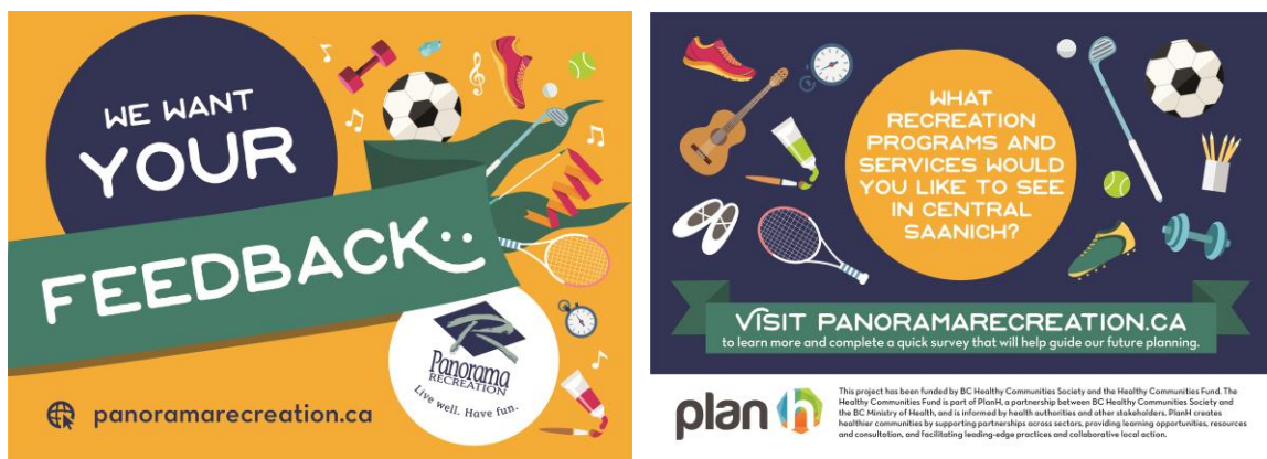
Figure 1. Project promotional postcard.

In-person and electronic methods were used to gather feedback from key stakeholders and the general public. The feedback collected through this needs assessment is an invaluable reference for staff when considering adjustment and augmentation of existing programming to better meet community need. Related to this project was the strategic initiative of developing and implementing a collaborative model for evaluating facility needs on the Saanich Peninsula. Staff completed a Central Saanich facility inventory in 2017.