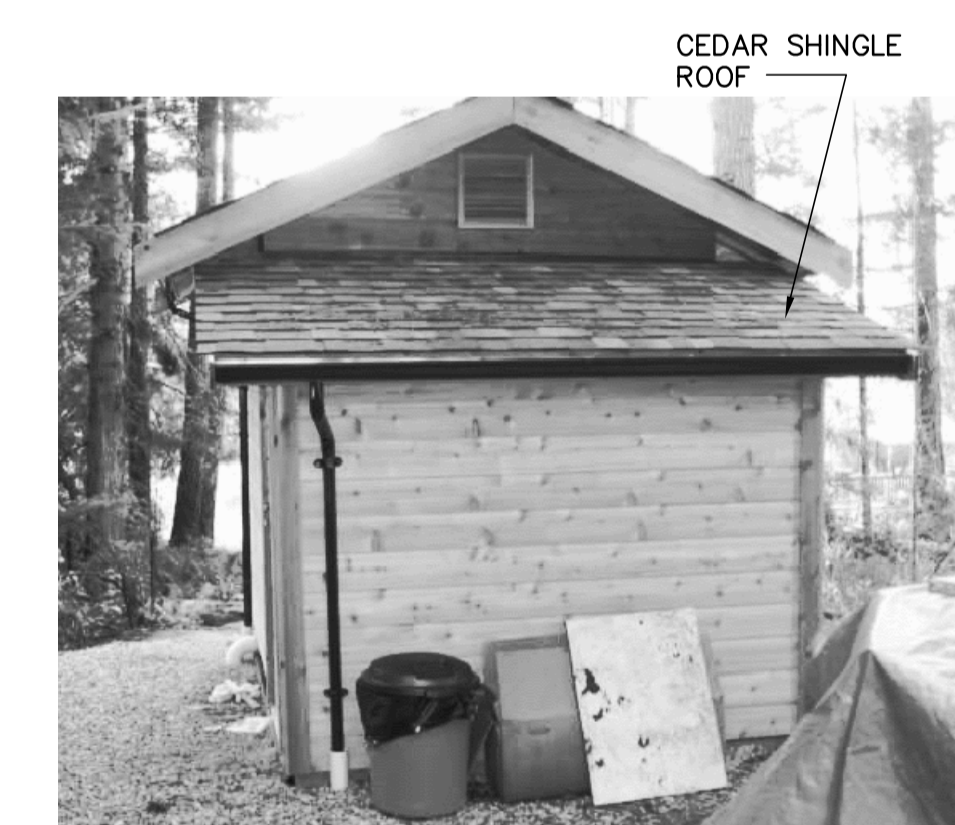
NORTH ELEVATION APPROX. 1:50