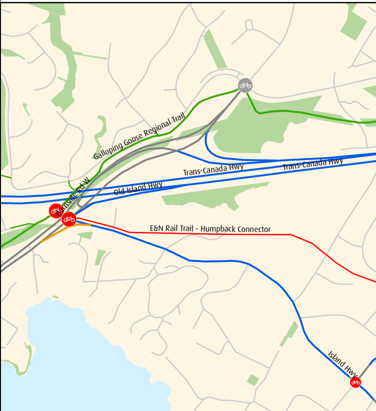
Insert 2 - Sooke Count Stations