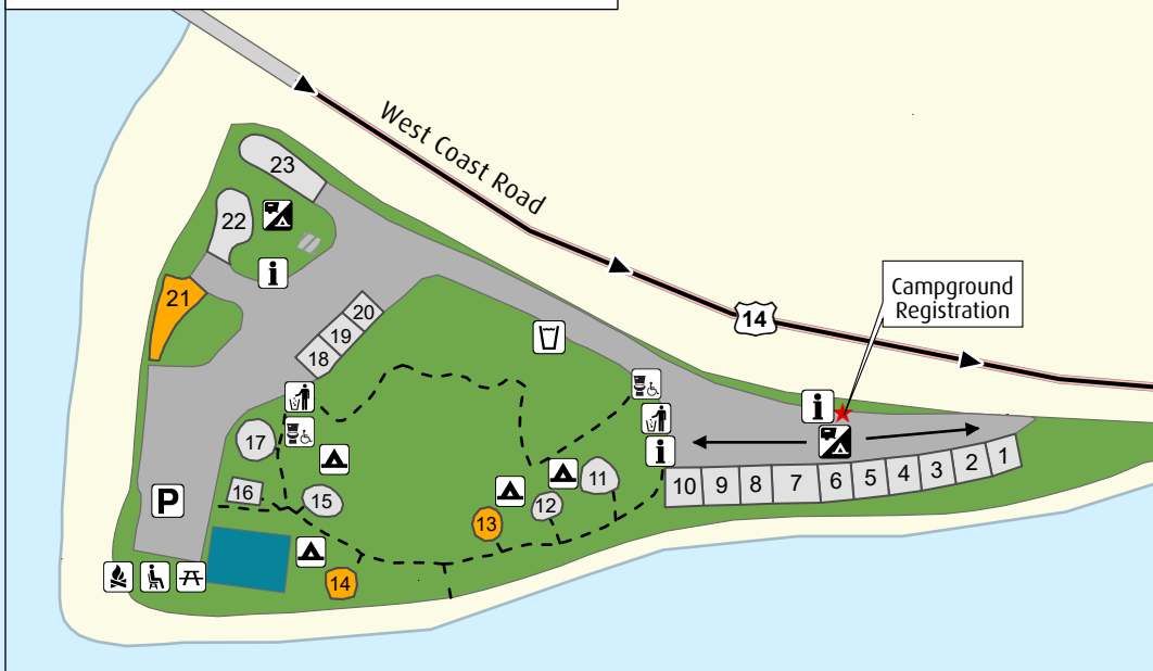
Inset: Jordan River Regional Park Campground