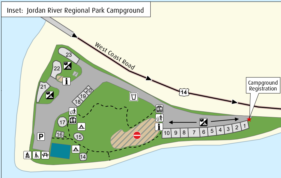
Inset: Jordan River Regional Park Campground

Strong Shaking is Your Warning: In the event of an earthquake, the BC Hydro Dam may breach and cause flooding in this area within 20 minutes. If you feel strong shaking, immediately follow the evacuation route and move to higher ground away from the flood area. Failure to do so could result in significant risk to your life.