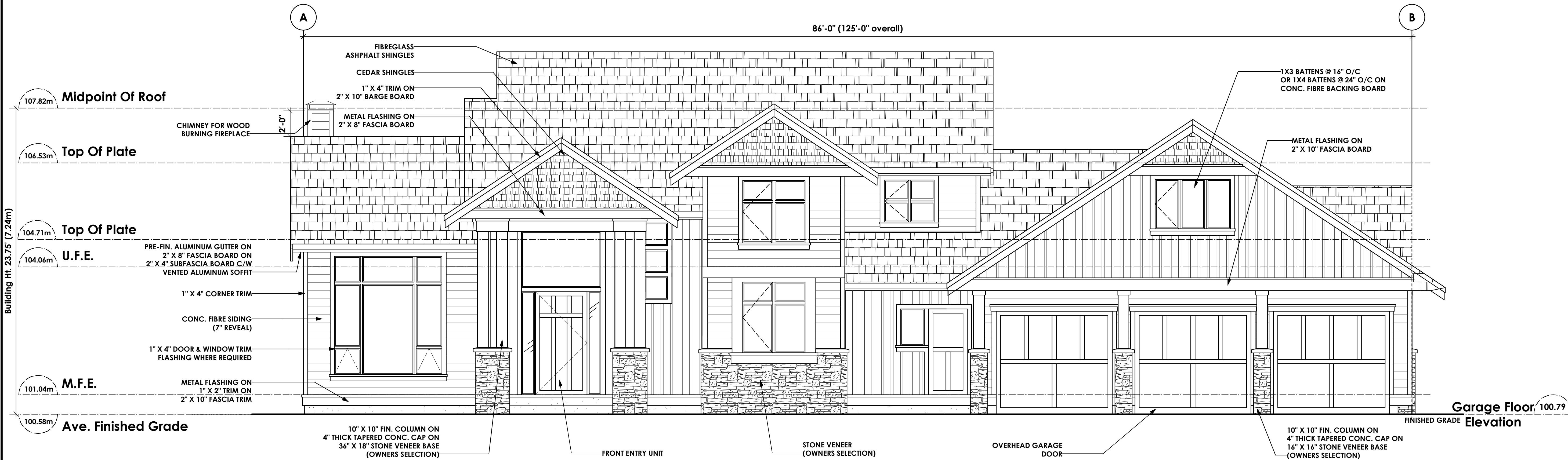
1 Front Elevation Scale: 1/4" = 1'-0" A2