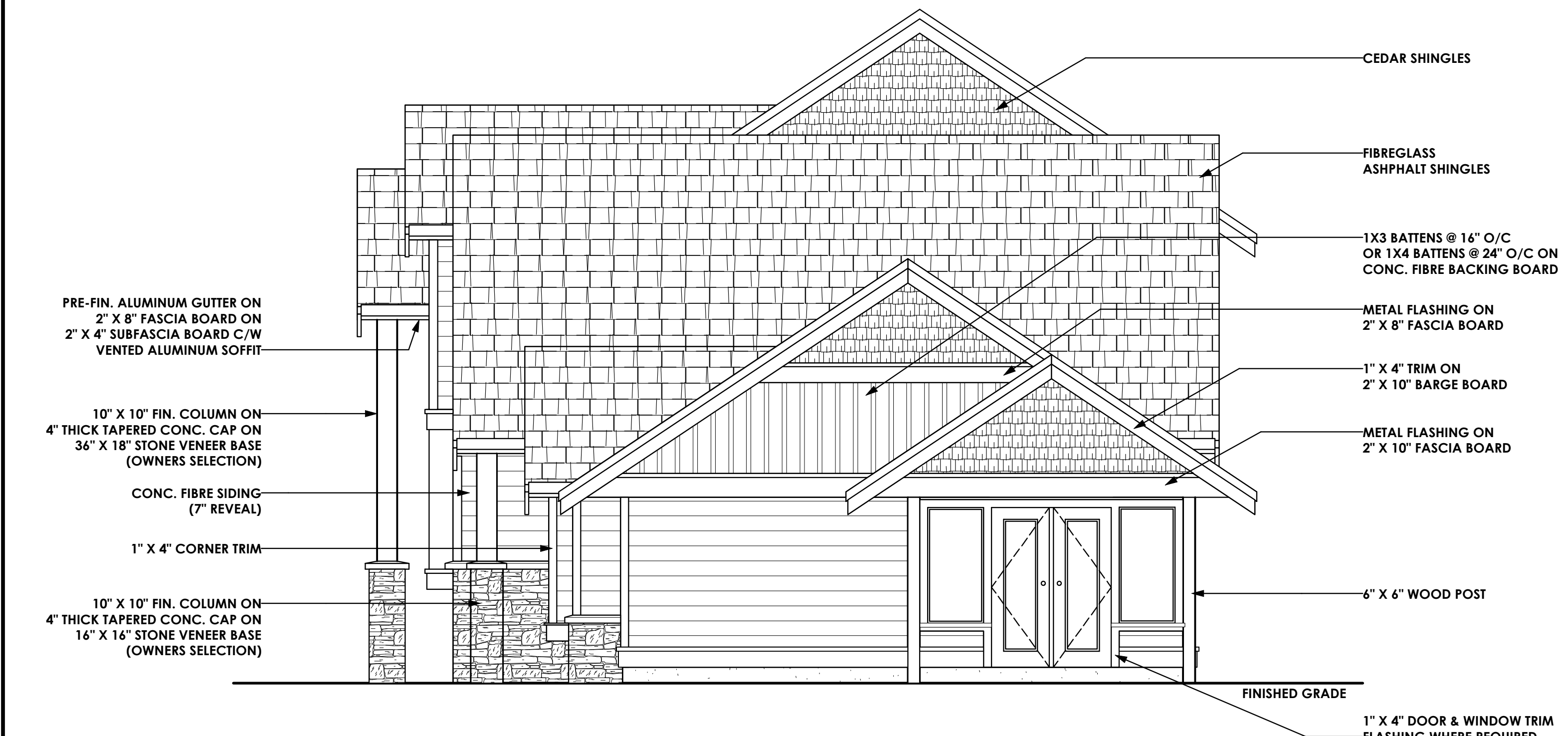
2 Left Elevation Scale: 1/4" = 1'-0" A2