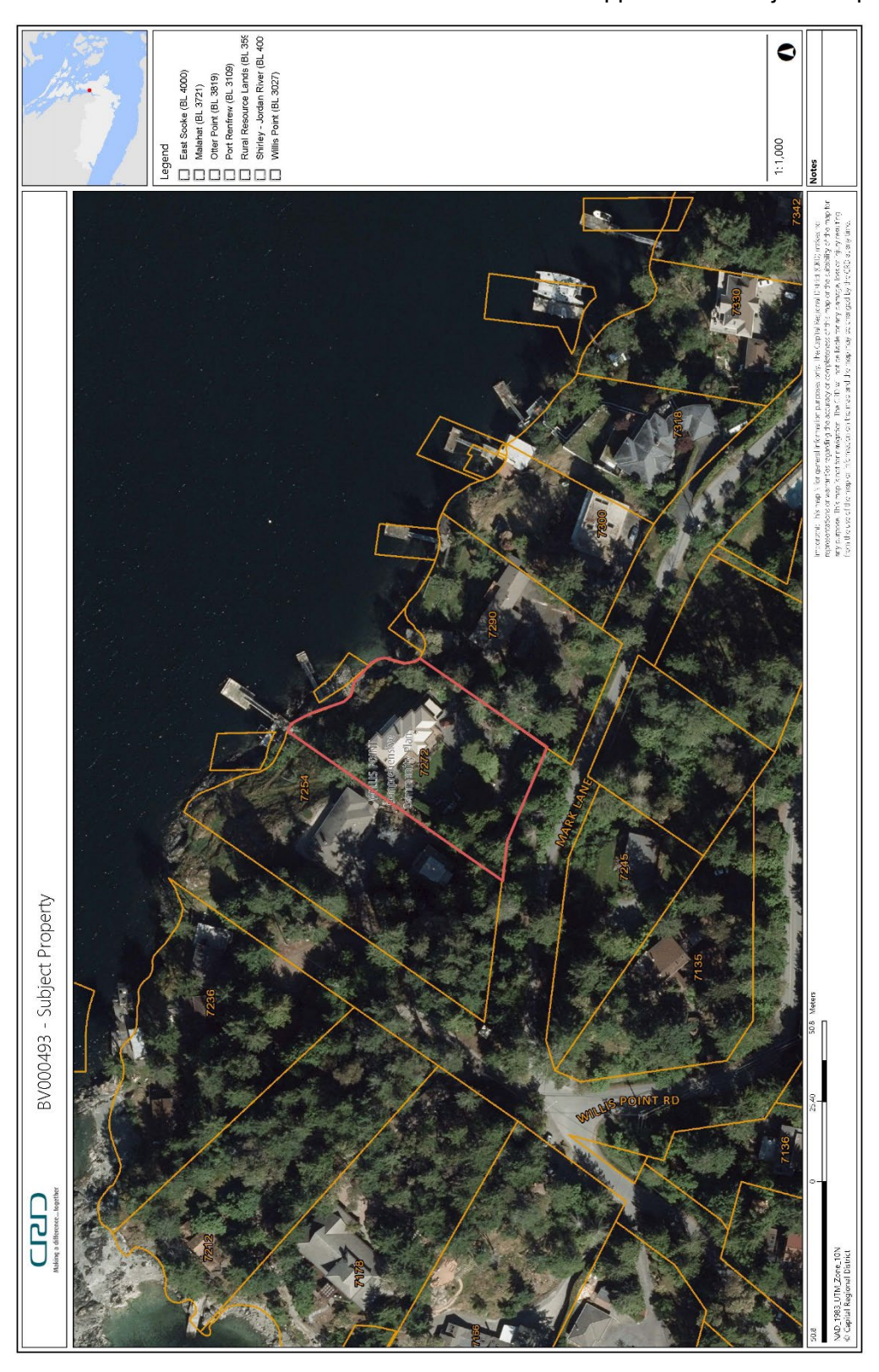
Appendix A: Subject Property Map