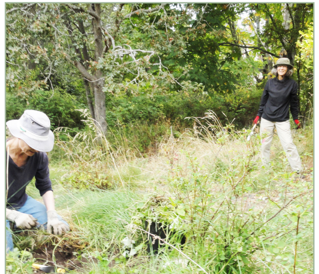
Volunteers are busy as bees, at the Bowker Creek Riparian Garden at Monteith, restoring a riparian area that was infested with invasive species and now is blooming with native plants.

The Bowker Creek Riparian Garden - Monteith is now flourishing with native plants and buzzing with community volunteers. This successful restoration project was made possible by a TD Friends of the Environment grant, the cooperation of Oak Bay Parks and a team of dedicated volunteers. The Community Association of Oak Bay officially adopted and now cares for this site, located behind Fireman's Park. The shift toward increased local responsibility for the Riparian Garden reflects the strong local ownership and community development principles embodied by BCI. Volunteers focussed on the garden's "food forest" theme — planting and caring for local native shrubs and small trees with edible fruit. Work sessions continue on 2nd and 4th Wednesdays, 1-3 p.m. All are welcome!