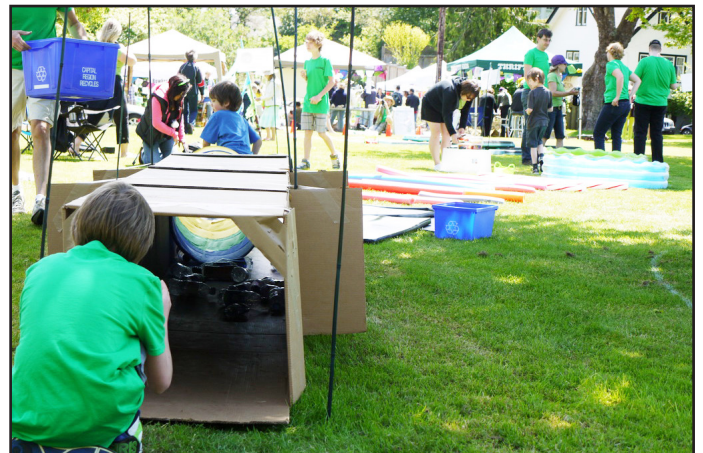
5th annual Bowker Creek Celebration - Microsoft Studio Victoria designed and hosted a Bowker Creek obstacle course to teach participants about the importance of caring for our urban watersheds. Pictured above: a child enters a "box culvert" full of "urban runoff pollution."