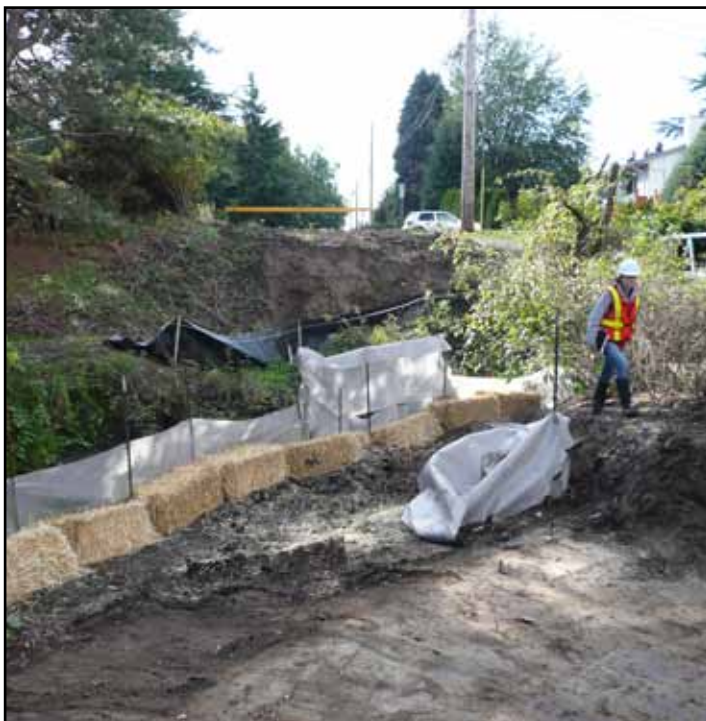
In 2009 a greenway trail was partially completed through Browning Park and an adjacent right-of-way, and created opportunities to improve the riparian buffer along the creek.

*figures in this table do not include the value of municipal staff and volunteer time