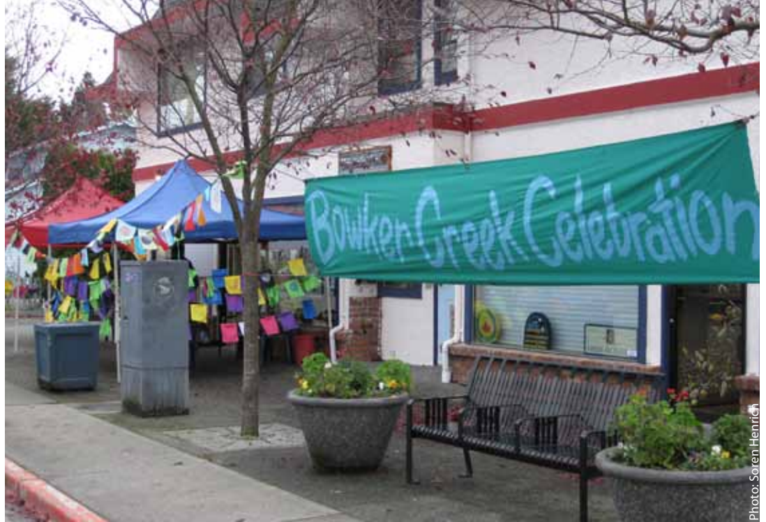
Families were invited to make artful pennants to celebrate living near Bowker Creek.

District of Saanich, City of Victoria, District of Oak Bay, Capital Regional District, University of Victoria, Friends of Bowker Creek Society, Quadra Cedar Hill Community Association, Camosun Community Association, North Jubilee Neighbourhood Association, Community Association of Oak Bay and members of the public.