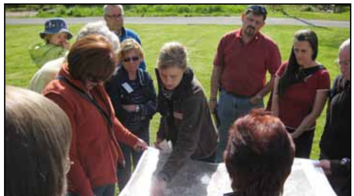
Municipal councillors toured Bowker Creek in May, to learn about recent projects and the development of the Bowker Creek Blueprint.

At Monteith Street in Oak Bay, invasive species were removed on municipal property near the creek. Detailed plans were developed to turn this weedy, overgrown site into an area that supports native plants and a small number of community garden plots. At Browning Park in Saanich, a park renewal plan was approved and greenway trail construction started. Once complete, these efforts will improve the riparian buffer along Bowker Creek. In Victoria, a rain garden was developed on Trent Street near Bowker Creek. This rain garden will serve as a template for further rainwater management in the watershed. Lastly, The District of Saanich began efforts to control invasive yellow willow along the creek. Previous restoration projects continued to be monitored, and water quality data was collected by the CRD as in previous years.