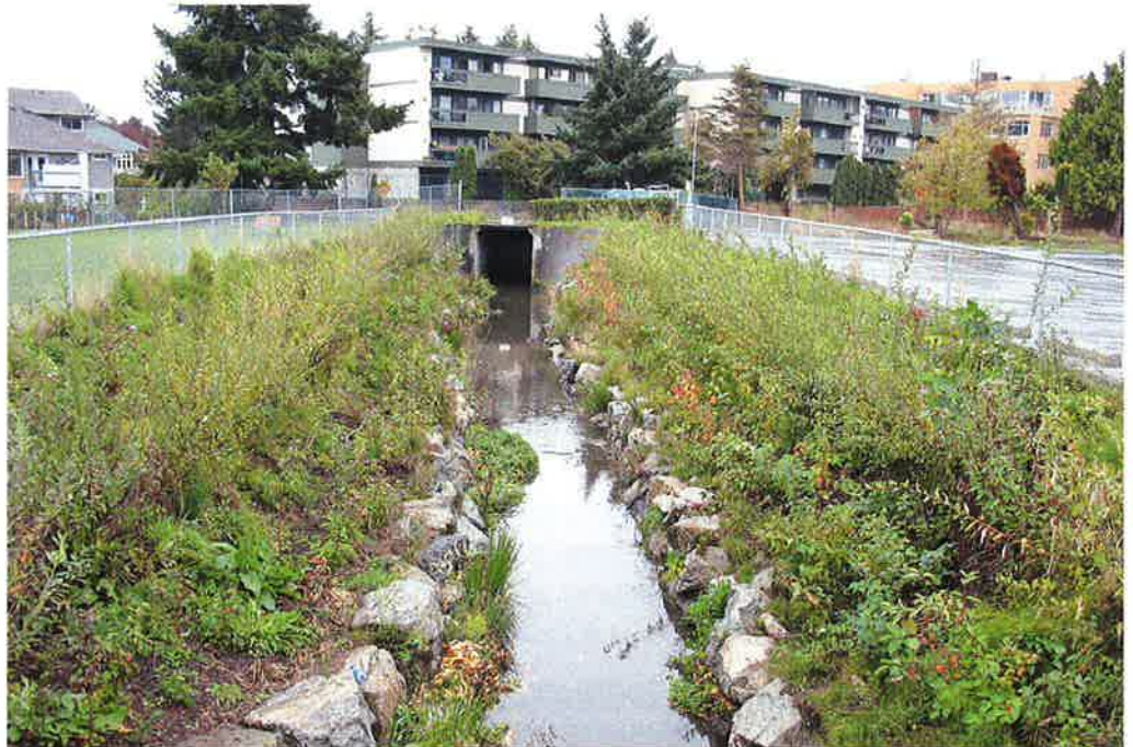
The restoration demonstration site (completed in 2005) at St. Patrick's elementary school fared well in 2006, even with unusual flooding events.

In 2006, the BCI focused on the Master Drainage Plan (MDP), outreach activities, greenways, and restoration and monitoring projects.