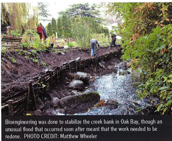
Bioengineering was done to stabilize the creek bank in Oak Bay, though an unusual flood that occurred soon after meant that the work needed to be redone.

The BCI worked to develop input to municipalities' greenways planning, in accordance with the goals of the BCWMP. The BCI also continued to work with agencies and groups to restore sections of Bowker Creek, raise awareness within the watershed and collaborate on watershed stewardship activities. These activities and projects are working towards decreasing stormwater and contaminant inputs entering the creek, protecting and enhancing habitat quality, achieving ecologically suitable land uses and advocating environmental protection for the watershed. Partnering with municipal, community and business partners, and planning for land use within the watershed is essential to this process and a key action for the BCI ■