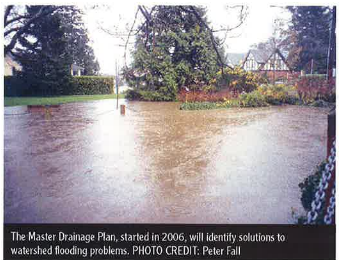
The Master Drainage Plan, started in 2006, will identify solutions to watershed flooding problems.