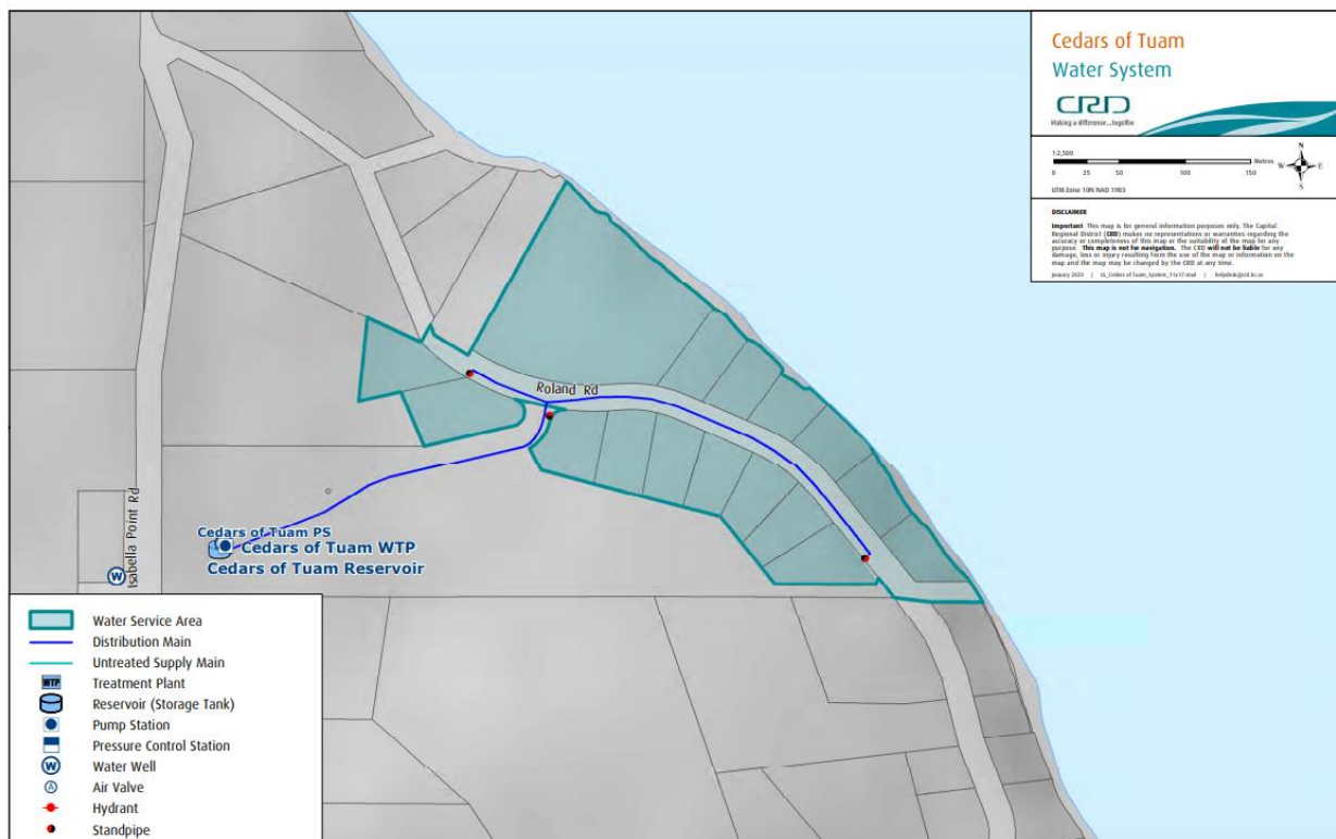
Figure 1: Cedars of Tuam Water Service

The Cedars of Tuam Water Utility is a rural residential community located on Salt Spring Island. The service was created in 1970 and became a CRD service in 2002. The Cedars of Tuam Water Utility (Figure 1) is comprised of 16 parcels of land and 17 connections to the system.