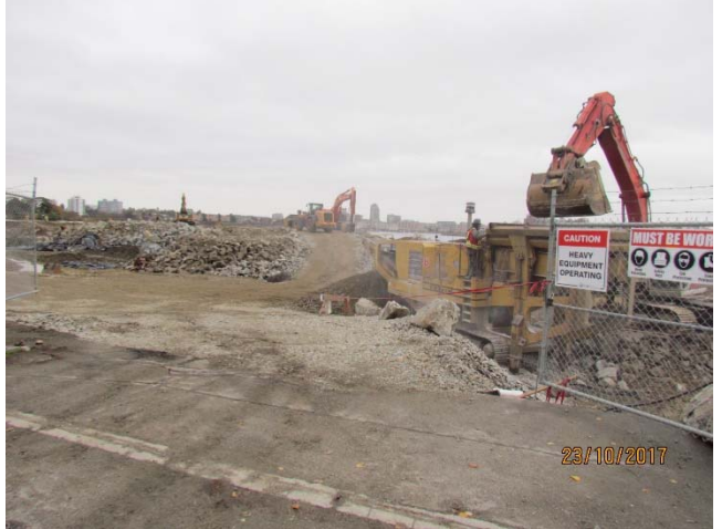
Figure 2 -- Crushing of blast rock