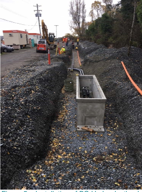
Figure 5 – Installation of BC Hydro ductbank