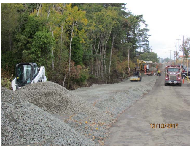
Figure 3- Widening of Victoria View road