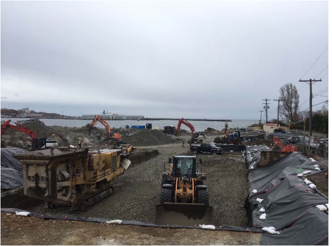
Figure 6 – Slope stabilization and protection