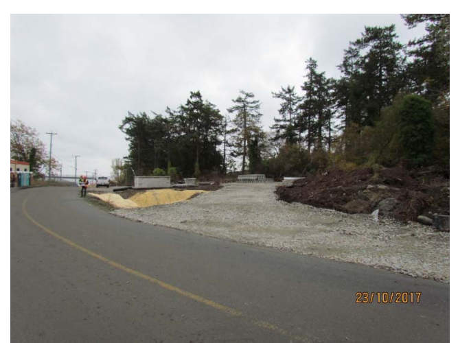
Figure 4 – Truck turnaround