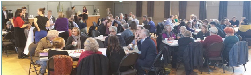
Arts Champions Summit, November 3, 2016, BuildingOur#ArtsFutureTogether

The operating grant program is directed towards organizations that have been in operation for at least two years and have demonstrated competence and sustainability in 3 main areas: fulfillment of artistic mandate, administrative competence, and community impact.