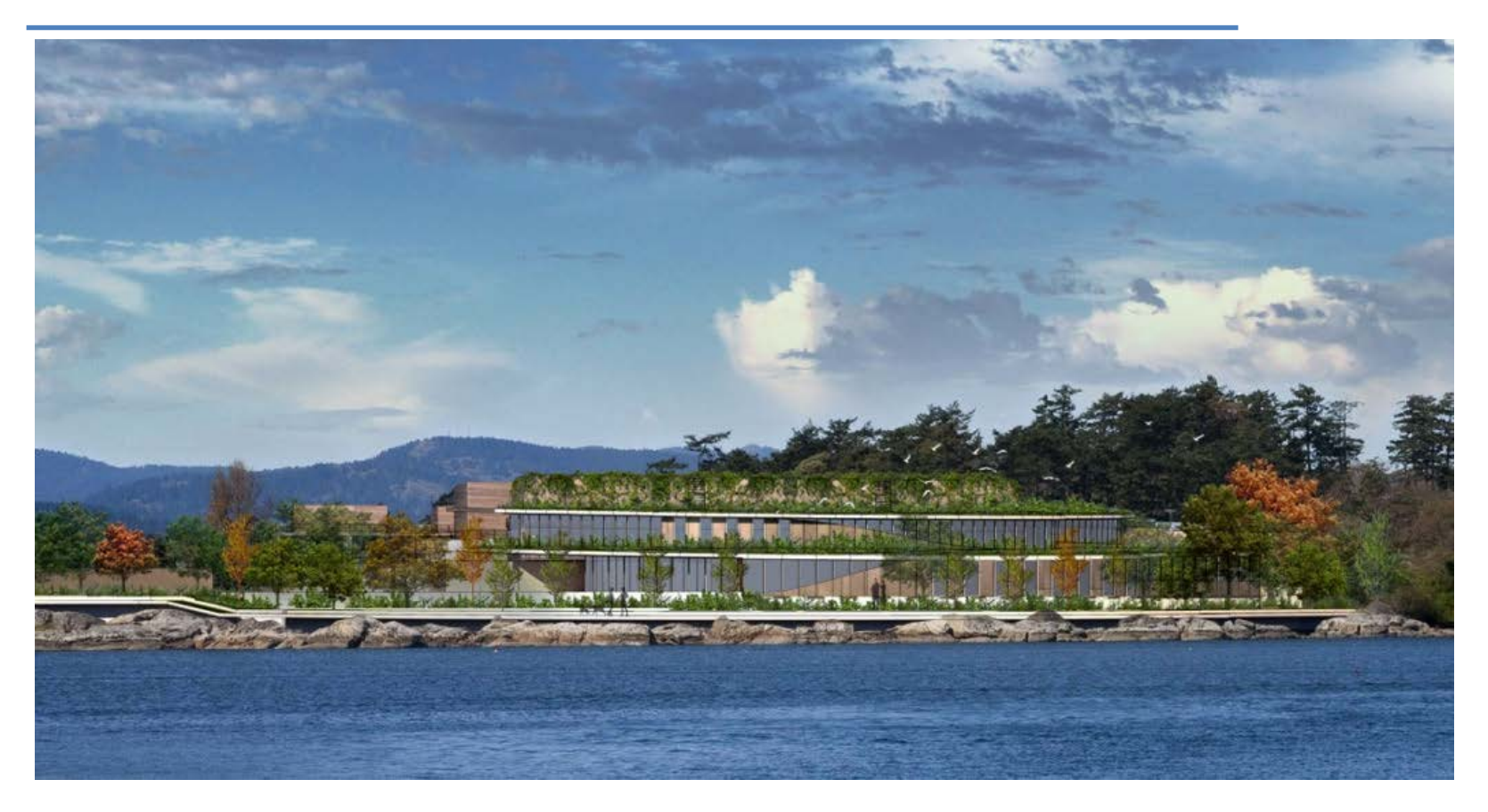
Proposed revised design at McLoughlin Point