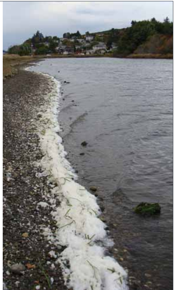
Foam at the Esquimalt Lagoon.

Naturally produced organic surfactants are released from algae and plants when they die and begin to decompose but also in lesser amounts when living. These organic surfactants are part of a large variety of plant material that when dissolved in water is referred to as dissolved organic carbon (DOC). The breakdown of large algal blooms in ocean waters can lead to the accumulation of foam on beaches up to 3 feet deep. The primary source of DOC in lakes and streams is from the surrounding watershed soils. Bogs and wetlands deliver large amounts of DOC to streams and lakes because they are very productive and the breakdown of plant material within wetlands is slow. The presence of DOC in lakes and streams is why they are dark in color and often referred to as “brown-water streams.” Foam often is seen in our brown-water streams in the spring as snowmelt