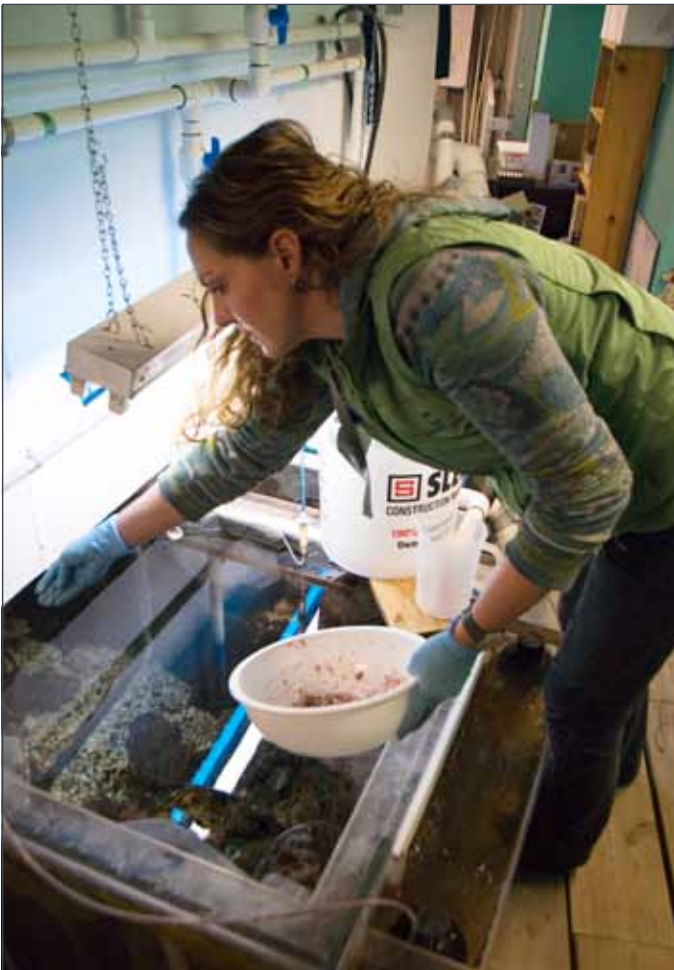
A Shaw Ocean Discovery Centre staff member feeds some aquatic creatures.