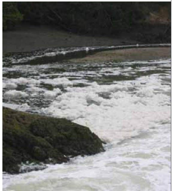
Foam at the Gorge rapids.