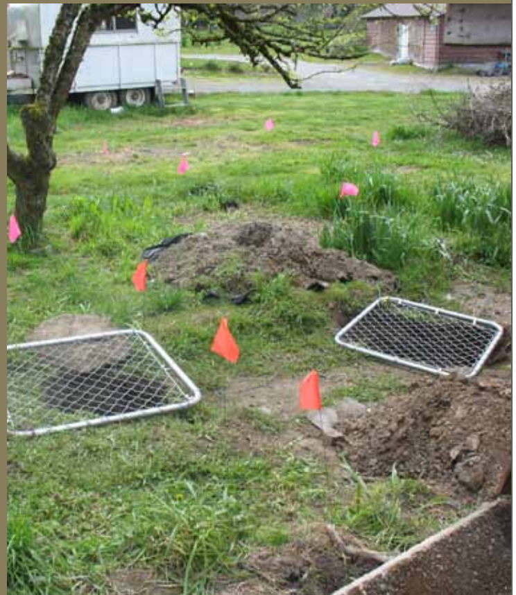
Pictured above is an onsite system being inspected.

You'll find a wealth of information, including video clips, household information kits and much more at www.crd.bc.ca/wastewater/septic/index.htm .