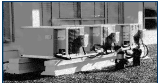
Install rooftop condensers and save

For industrial, commercial and institutional customers of the Greater Victoria water supply system, CRD Water Services offers rebates of $1,200 per ton to eliminate once-through cooled condensers and $2,400 per ton to eliminate once-through cooled ice makers; up to a maximum of $5,000 per account. Only existing once-through water cooled equipment (installed before January 1, 2006) is eligible for a rebate.