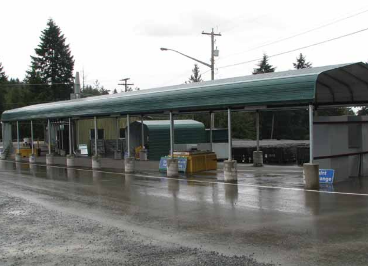
The newly re-designed household hazardous waste collection area at Hartland landfill