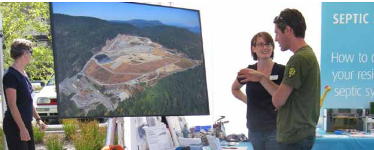
Update Photo Caption

Work towards a complete landfill ban on organic material in 2012 is conducted in consultation with industry representatives and municipalities.