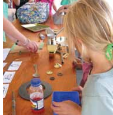
Child at the arts and crafts table at the Hartland Open House