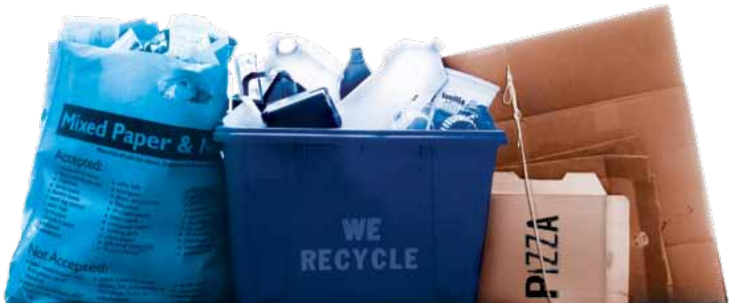
CRD Blue Bag, CRD Blue Box, and Cardboard bundle