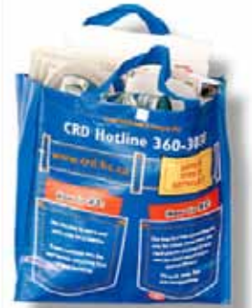
Apartment recycling tote bag

CRD residential recycling programs consist of the blue box curbside collection program for more than 111,000 households, a funding program for recyclables collection from multi-family dwellings (apartment program), and drop boxes or depots in areas not serviced by the curbside program.