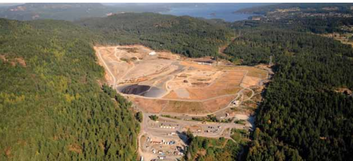
Aerial of Hartland Landfill

The CRD creates partnerships between any combination of municipalities and electoral areas for services or projects that are specific to only part of the region. The CRD provides regional governance and services for the entire Capital Region, including regional parks, regional planning and solid waste management.