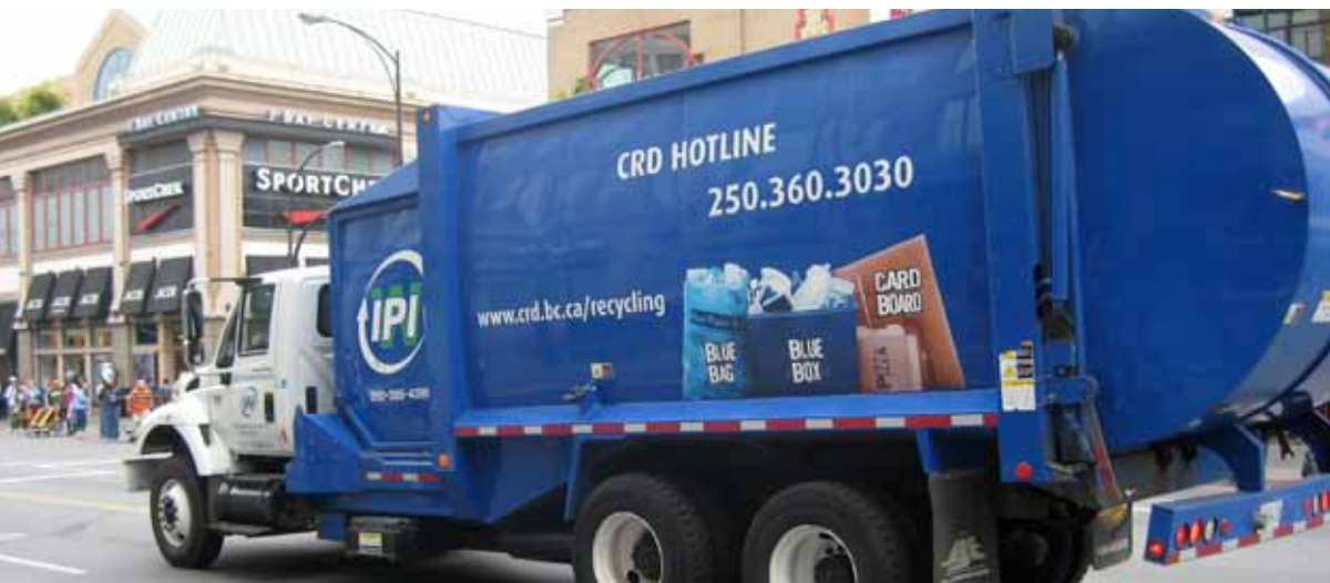
International Paper Industries (IPI) curbside recycling truck in the Victoria Day parade

The Solid Waste Advisory committee (SWAC) is a 23 member committee comprised of representatives from municipalities, private enterprise and the community at large. All work related to the solid waste function, except for budgetary and contractual matters, is reviewed by SWAC prior to being sent to the Environment committee for decision making. SWAC also acts as the Plan Monitoring Advisory committee to monitor the implementation of the SWMP, as required by the Ministry of Environment.