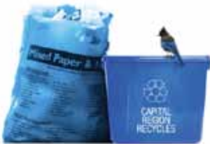
CRD Blue Bag and CRD Blue Box

The CRD also operates the Hartland recycling facility which accepts over 80 different material types from 25 product categories. This depot is intended for residential quantities only for vehicles with a maximum GVW of 5,500 kg. In 2008, the following programs were added to the facility: