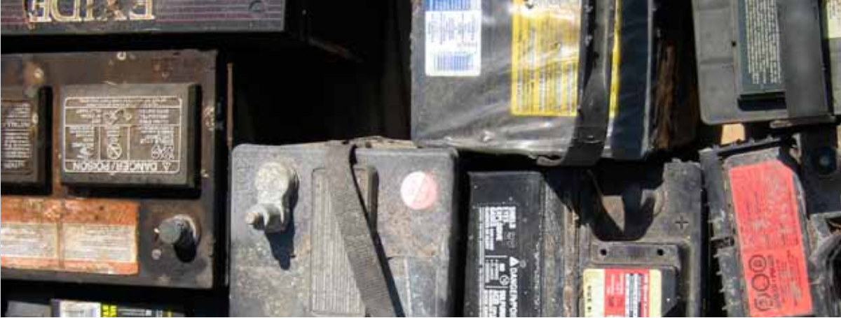
Update photo caption