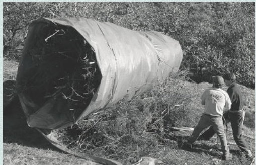
Staff bundle Scotch broom plants for removal from Mill Hill

As part of a long-term project to restore the Garry oak ecosystems of Mill Hill Regional Park, staff removed an estimated 8.2 metric tonnes of Scotch broom and daphne (invasive species) from approximately 2.6 hectares. For the first time, a group of trained volunteers assisted this project. A 2004 inventory of vegetation on Mill Hill revealed 166 occurrences of 13 rare plant species, the largest known number of rare plants in any regional park. Project funding included a $53,753 grant from the Government of Canada Habitat Stewardship Program for Species at Risk. The Garry Oak Ecosystems Recovery Team and the Nature Conservancy of Canada continued to support the project.