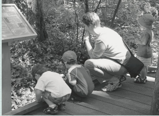
Family explores the Elsie King Trail at Francis/King Regional Park

Improvements were completed to the orchard parking area. Security upgrades took place at the nature centre, and renovations were completed at the caretaker's residence.