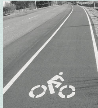
Lochside Trail bike lane

CRD Parks contributed funding to the District of Central Saanich to develop a two-kilometre bicycle/pedestrian trail along a municipal roadway section of the Lochside Trail between Mount Newton Cross Road and Lochside Drive. The goal of the project was to upgrade trail safety using accepted standards for bicycle use. The total project budget of $263,000 was jointly funded by Central Saanich ($50,000), the Provincial Capital Commission ($50,000) and CRD Parks ($163,000).