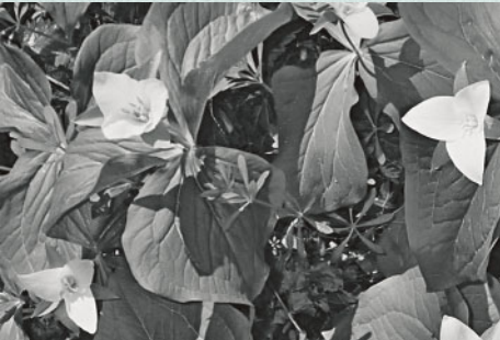
Trilliums at Mill Hill Regional Park

Staff worked with the BC Forest Service, municipal fire departments and CRD Water to suppress 10 minor fires in regional parks and trails.