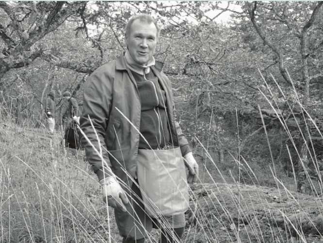
Left: Mill Hill Garry Oak Restoration Project volunteer removes broom seedlings from Mill Hill Regional Park

Cost per $100,000 of Converted Assessments $13.89