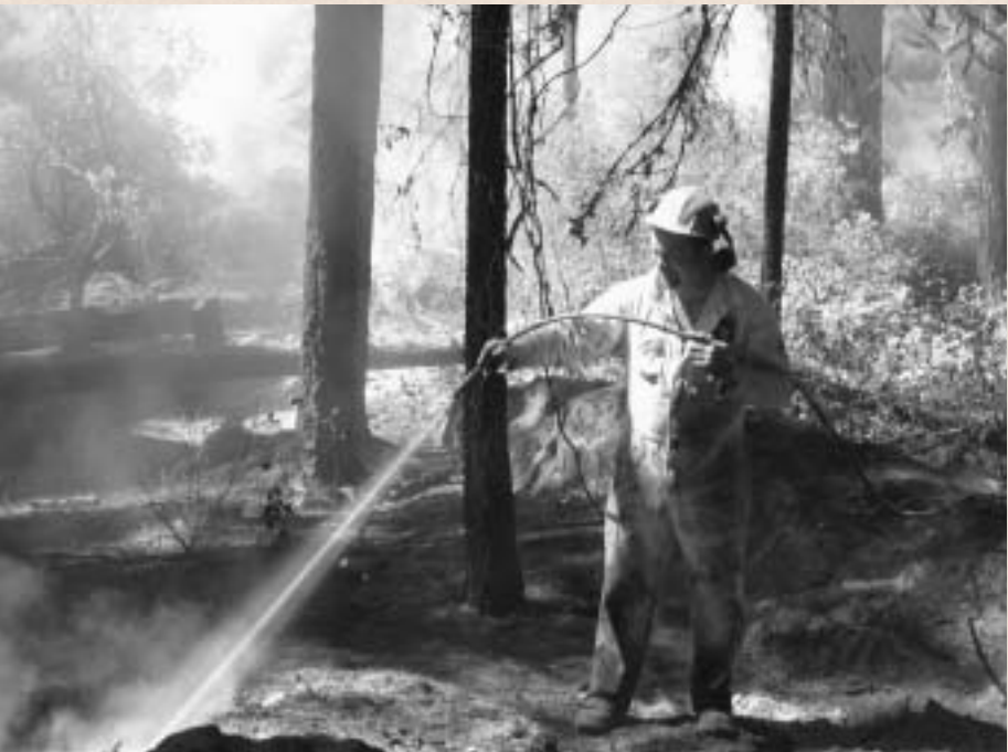
Fire suppression at Thetis Lake Regional Park

Working in partnership with CRD Bylaw Enforcement and local police agencies, staff informed more than 1,800 park visitors about unauthorized or inappropriate activities in regional parks and trails.