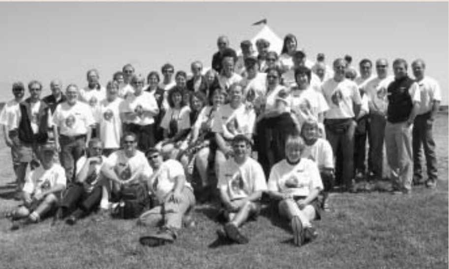
Special Park Districts Forum, Island View Beach Regional Park

In cooperation with Greater Vancouver Regional District Parks, CRD Parks co-hosted the 2003 Special Park Districts Forum. Administrative Services staff coordinated the multi-day conference, which attracted 121 park professionals from across Canada and the United States.