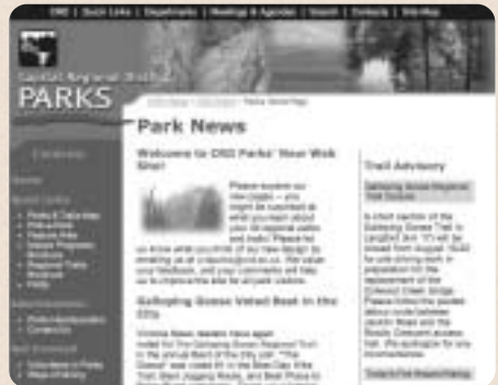
CRD Parks home page

CRD Parks launched a re-designed and expanded web site. The new site provides detailed information about regional parks and trails, plus downloadable maps and brochures, news, program schedules and other features. The site offers a more interactive experience for visitors and an integrated approach to communicating messages about regional parks and trails. The site experienced 484,000 hits in 2003, a 34 per cent increase over 2002.