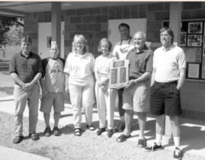
Opening of the Hartland toilet facility at Mount Work Regional Park