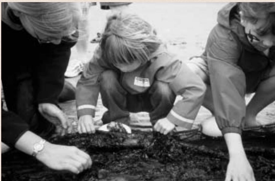
Marine Day, Witty's Lagoon Regional Park

Over 3 million people visited regional parks and trails in 2003.