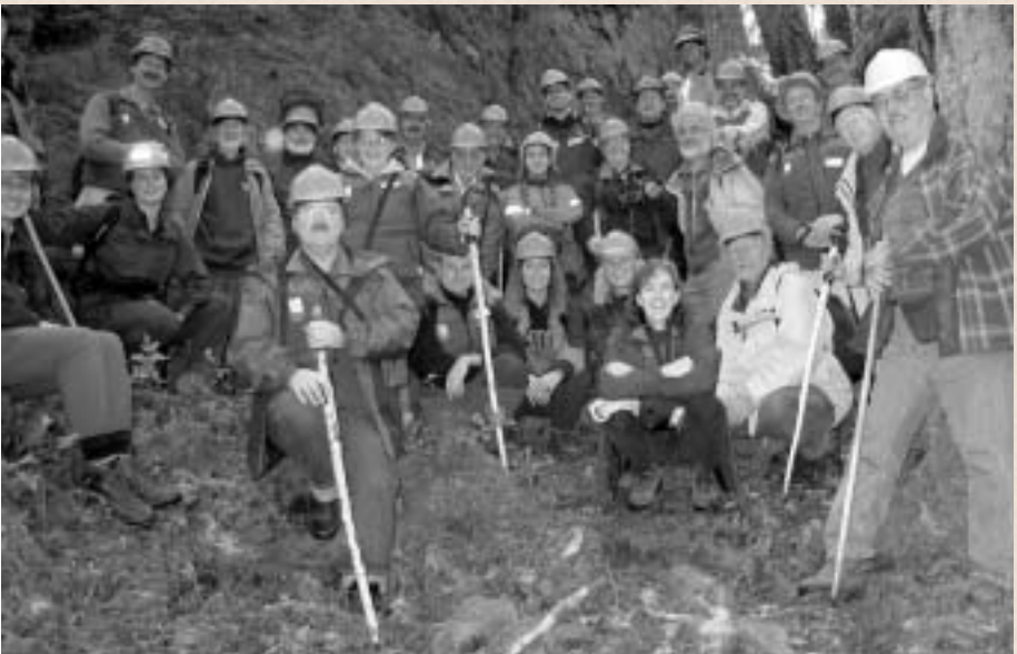
Volunteer in-service training, Thetis Lake Regional Park