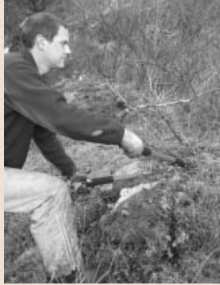
Removing invasive species at Mill Hill Regional Park

As part of this long-term restoration project to restore Mill Hill's Garry oak ecosystems, a botanical inventory revealed 12 rare plant species in 130 separate populations. Staff cleared and bundled by hand an estimated seven metric tonnes of Scotch broom and daphne (invasive species) from approximately three hectares. The success of restoration efforts is being monitored through permanent research plots and photo point monitoring. Project funding included a $33,700 grant from the Government of Canada Habitat Stewardship Program for Species at Risk. The Garry Oak Ecosystems Recovery Team and the Nature Conservancy of Canada also provided in-kind support to the project.