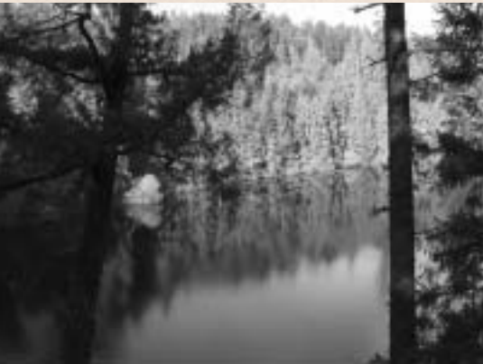
Killarney Lake, Mount Work Regional Park

CRD Parks acquired a 4.8-hectare parcel of land adjacent to Witty's Lagoon Regional Park in order to place a covenant protecting CRD Parks' interests on part of the property. The property will be resold in 2004.