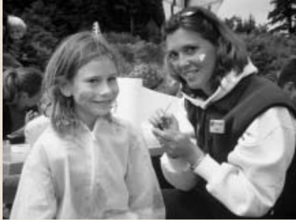
Volunteer facepainter at Snake Day, Elk/Beaver Lake Regional Park