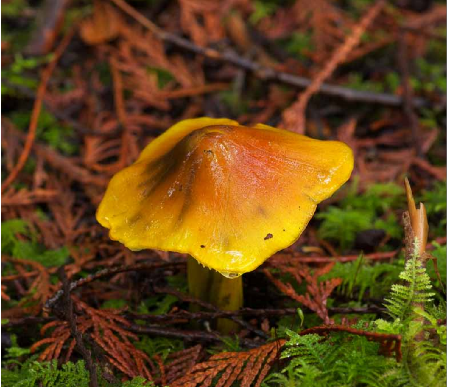
Hygrocybe conica , also known as Witch's Hat, at Thetis Lake Regional Park.