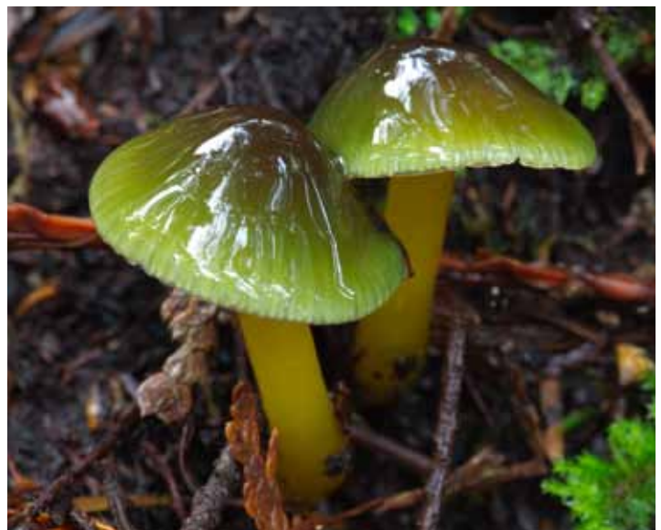
Parrot Waxy Cap, Hygrocybe psittacina , glows a translucent green when it first appears