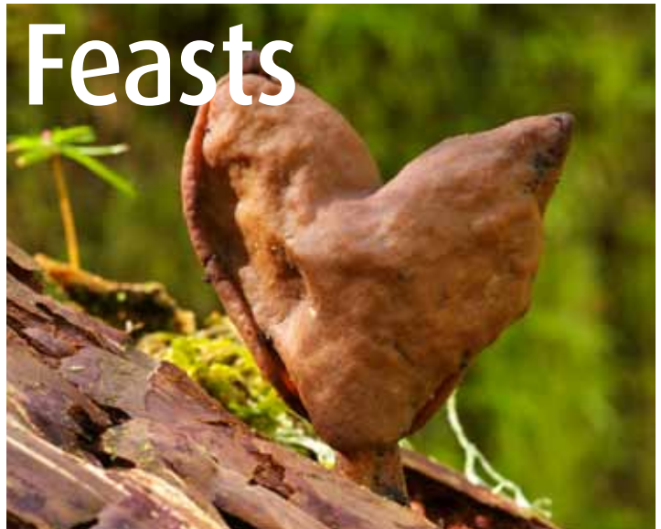
The Hooded False Morel ( Gyromitra/Helvela infula ) pops up in the woods from late summer to late winter

Kem Luther is a park warden at Matheson Lake and a guest naturalist for nature programs on fungi.