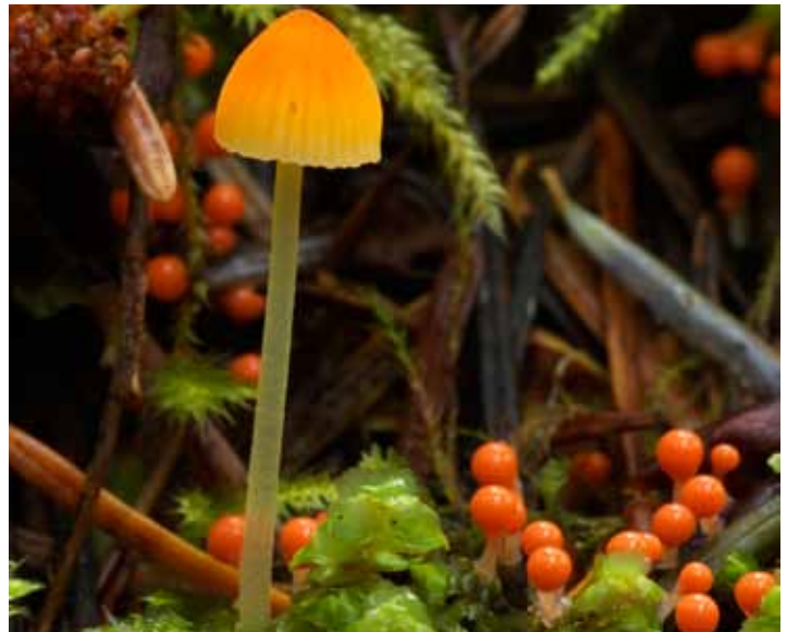
This small Mycena , probably Mycena aurantiidisca , has made its home in a bed of moss and slime mold spores