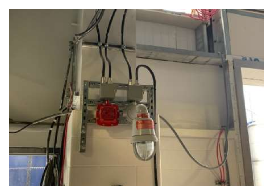
Figure 7- Residuals Treatment Facility- Installation of fire alarm systems ongoing throughout site.