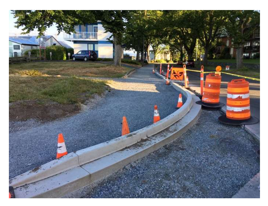
Figure 14-Clover Forcemain- Curb and gutter and sidewalk prep at Dock Street and Dallas road looking west.

Photographs of construction progress over the month of May on the Clover Forcemain are shown in Figures 14-15.