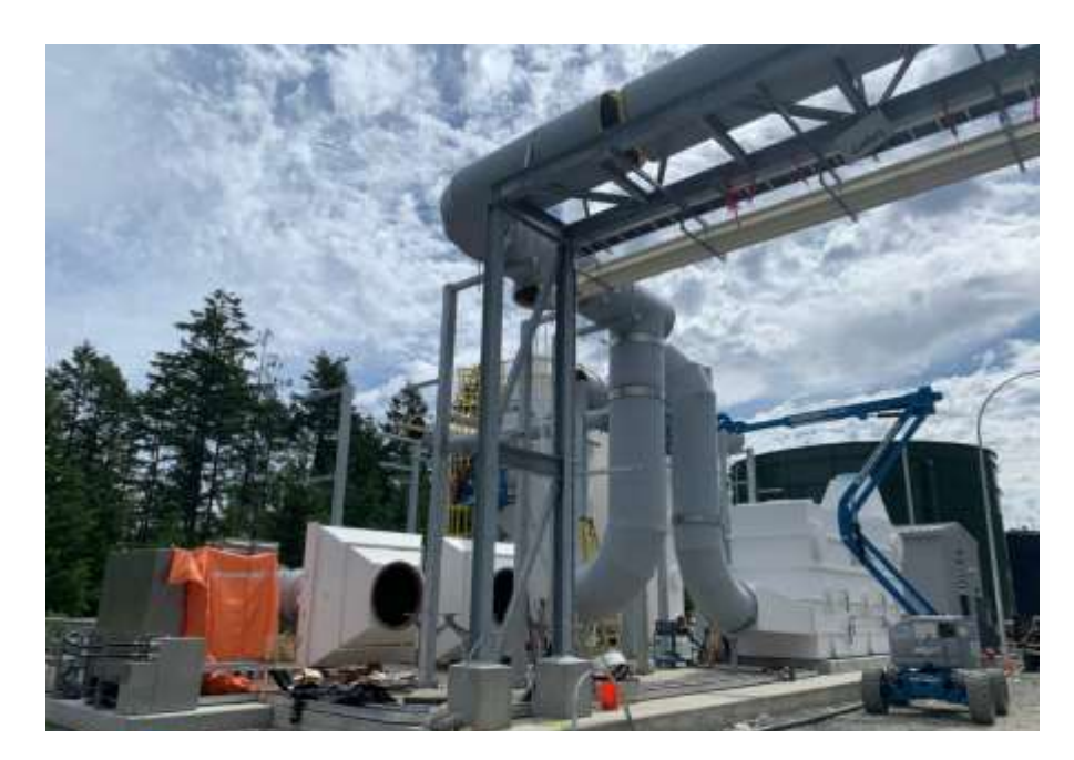
Figure 6– Residuals Treatment Facility- Installation of fiberglass reinforced plastic ducting for odour control systems being installed as well as structural supports.