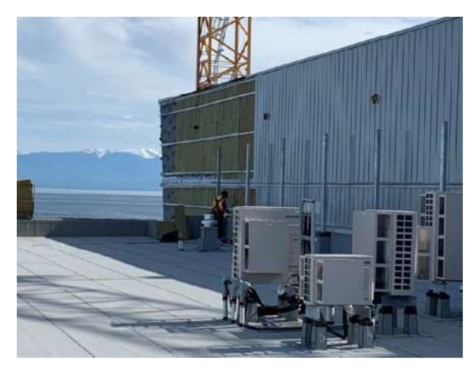
Figure 5– McLoughlin Point Wastewater Treatment Plant- Installing insulation and cladding on east face of Blower Building.