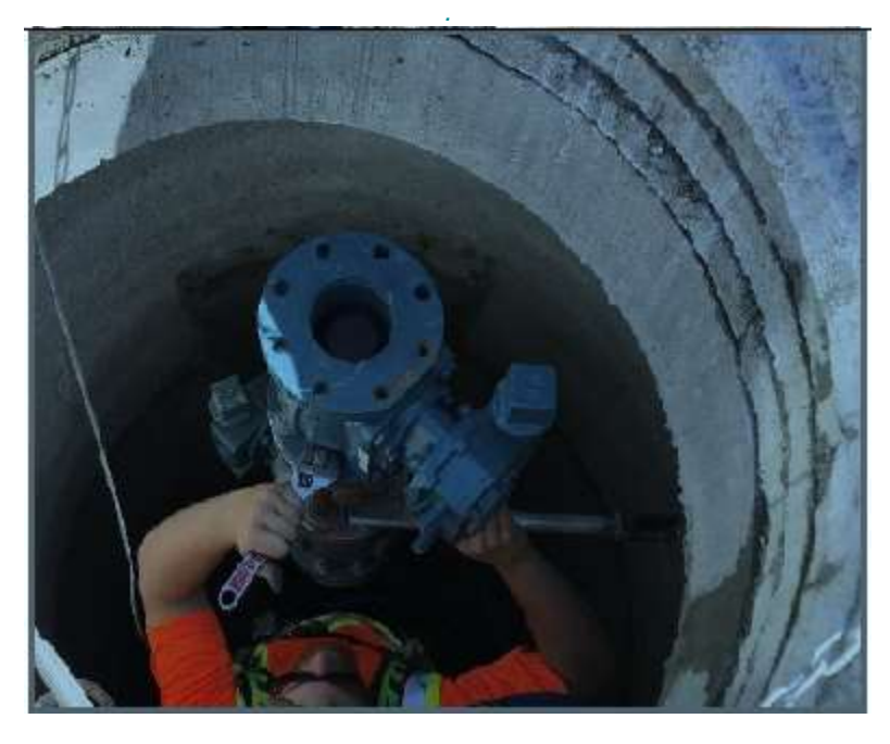
Figure 18-Residual Solids Pipes -Installing plug valves at Selkirk Ave.