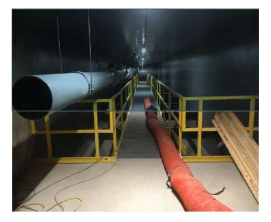
Figure 12–Macaulay Point Pump Station- Wet well fiberglass reinforced plastic platform installation.

Photographs of construction progress over the month of May at Macaulay Point Pump Station are shown in Figures 12-13.