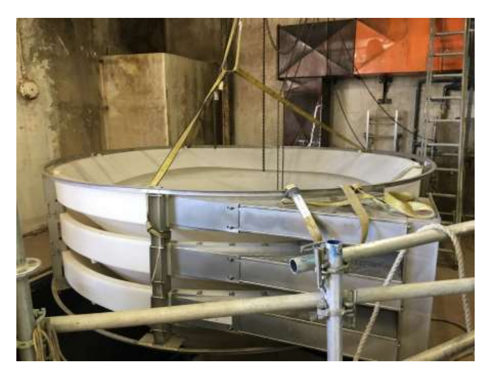
Figure 9-Clover Point Pump Station- Headcell installation.

Photographs of construction progress over the month of May at Clover Point are shown in Figures 9-11.