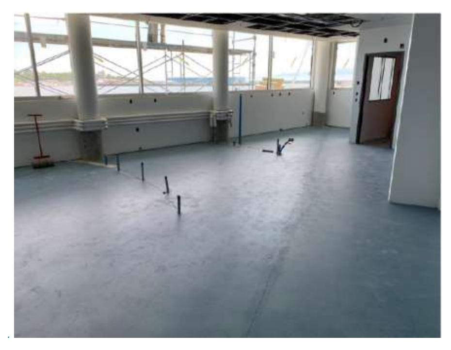
Figure 3- McLoughlin Point Wastewater Treatment Plant- Installed floor coating in the laboratory.