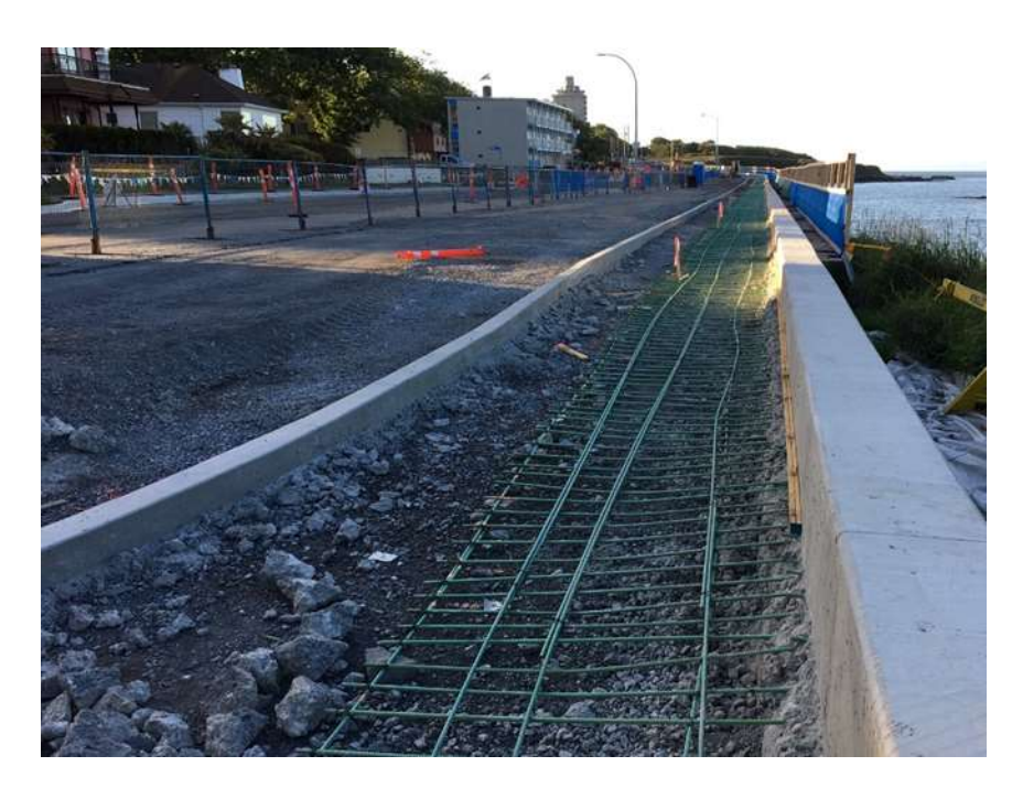
Figure 15–Clover Forcemain- New concrete wall replacing old balustrade wall, rebar installed for sidewalk and concrete curb delineating Cycle Track and sidewalk, Dallas Road from Dock Street looking east.