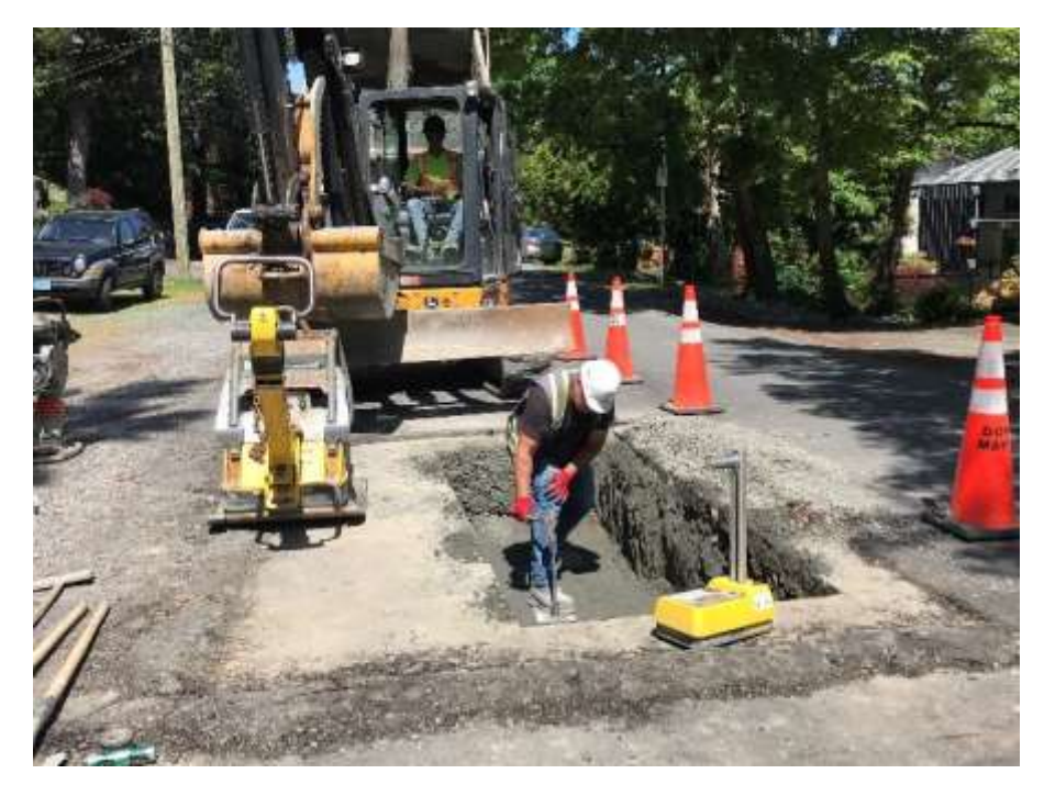
Figure 17–Residual Solids Pipes- Back fill and compaction on Grange Road after coupler repair.