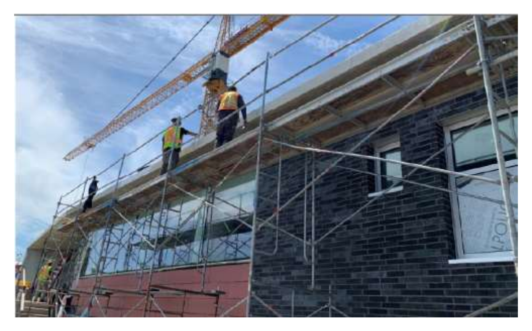
Figure 2– McLoughlin Point Wastewater Treatment Plant - Coating of leading edge Operations & Maintenance roofing.

Photographs of construction progress over the month of May at McLoughlin Point WWTP are shown in Figures 2-5.