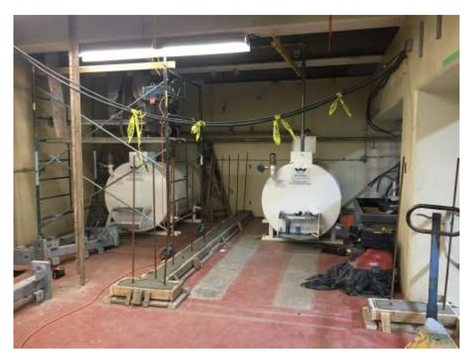
Figure 10-Clover Point Pump Station- Diesel fuel tank storage room location.