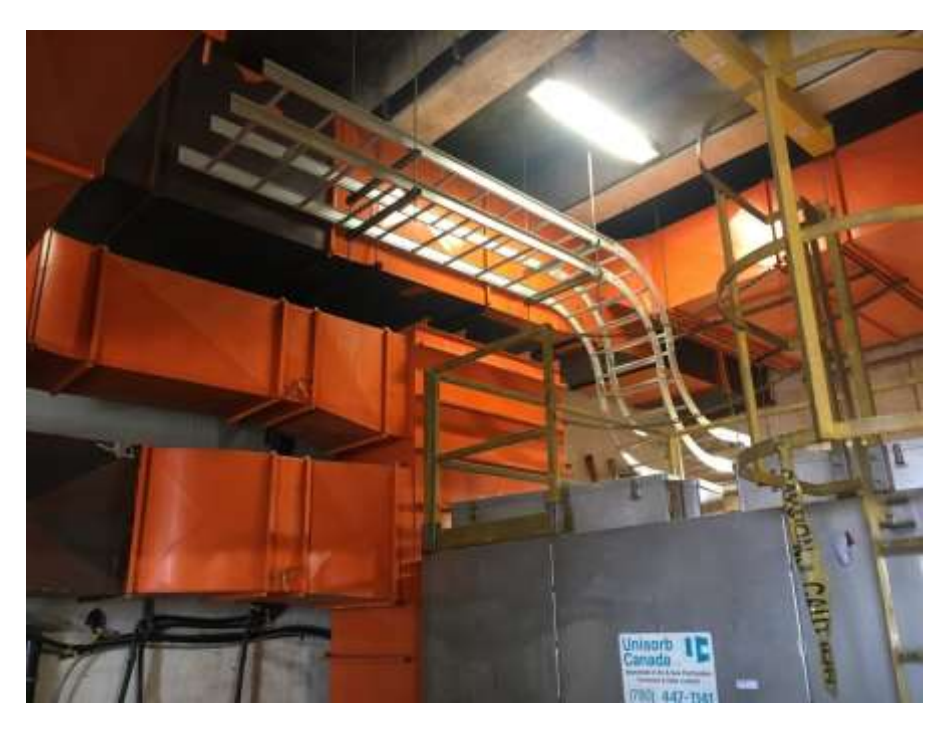
Figure 11- Clover Point Pump Station – Cable tray installation in screen & degritter room.