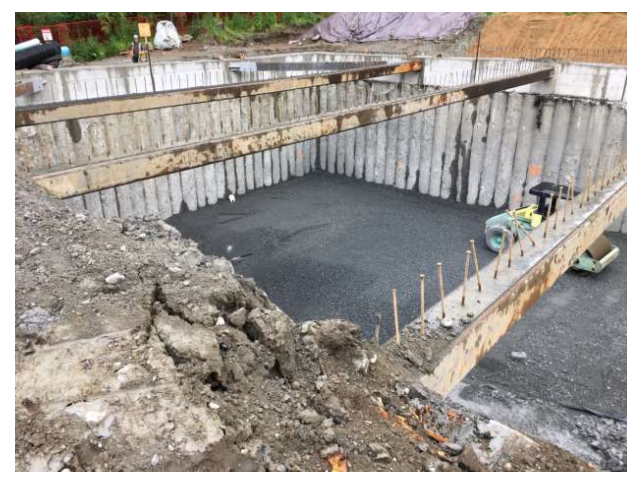
Figure 21-Arbutus Attenuation Tank- Excavation continues with placement of base course gravel installed.

A photograph of construction progress during the month of May at the Arbutus Attenuation Tank is shown in Figure 21.