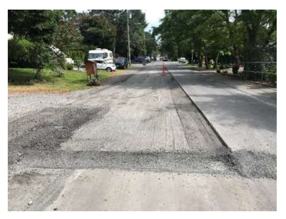
Figure 16- Residual Solids Pipes- Milling asphalt prior to paving on Grange Road.

Photographs of construction progress over the month of May on the Residual Solids Pipes are shown in Figures 16-18.