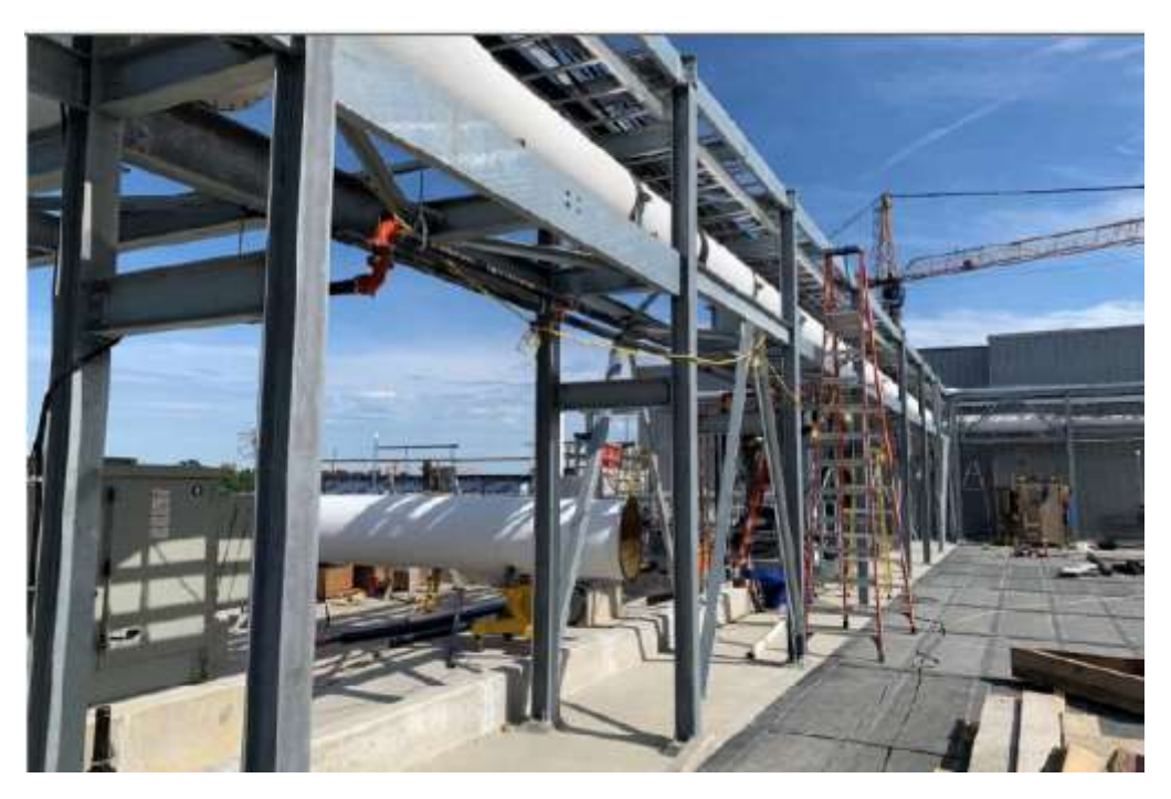
Figure 4- McLoughlin Point Wastewater Treatment Plant- Installation of Hydronic lines to Odour Control roof to unit.