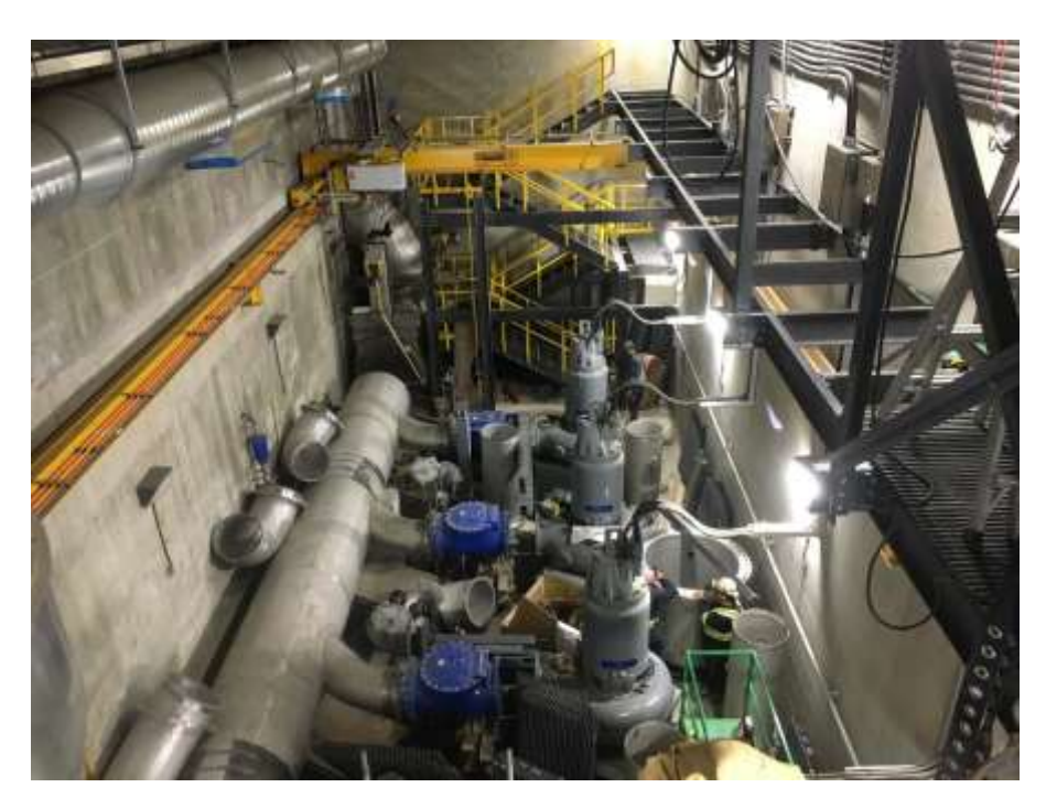
Figure 13–Macaulay Point Pump Station- Pump Room progression.