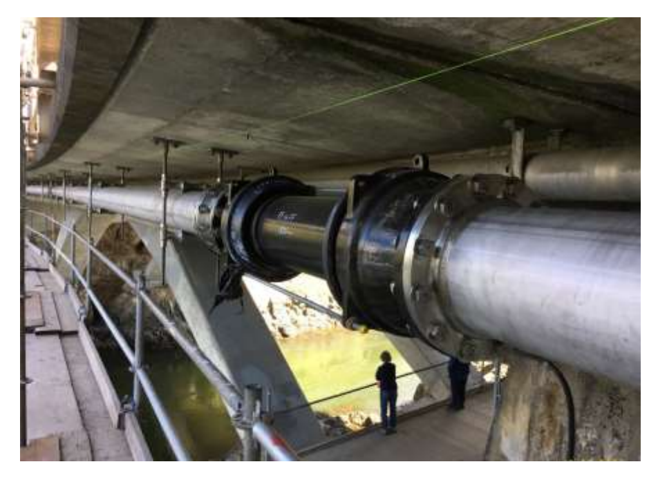
Figure 20 – Residual Solids Pump Stations – Tillicum Bridge pipe installed under Tillicum Bridge.