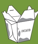
Uncoated takeout boxes