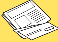
Newspapers, mail, envelopes