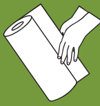
Soiled paper towels