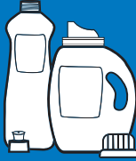
Plastic bottles and caps