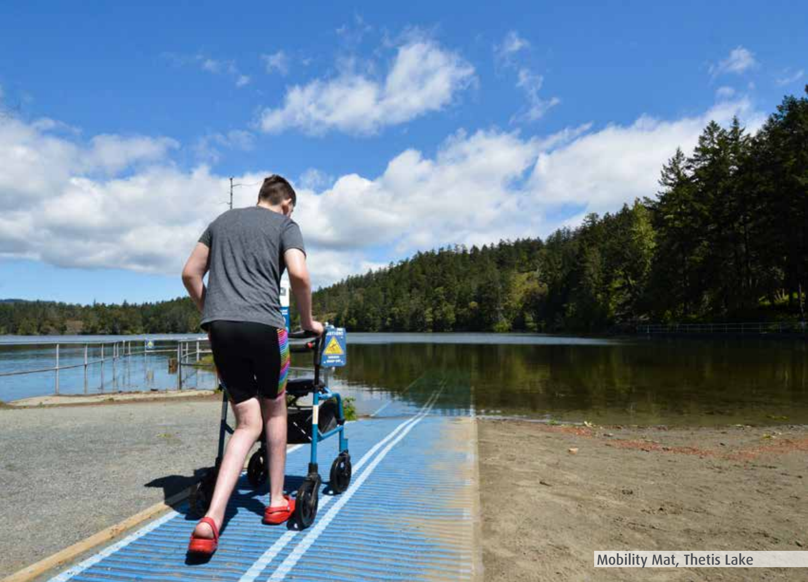
Mobility Mat, Thetis Lake