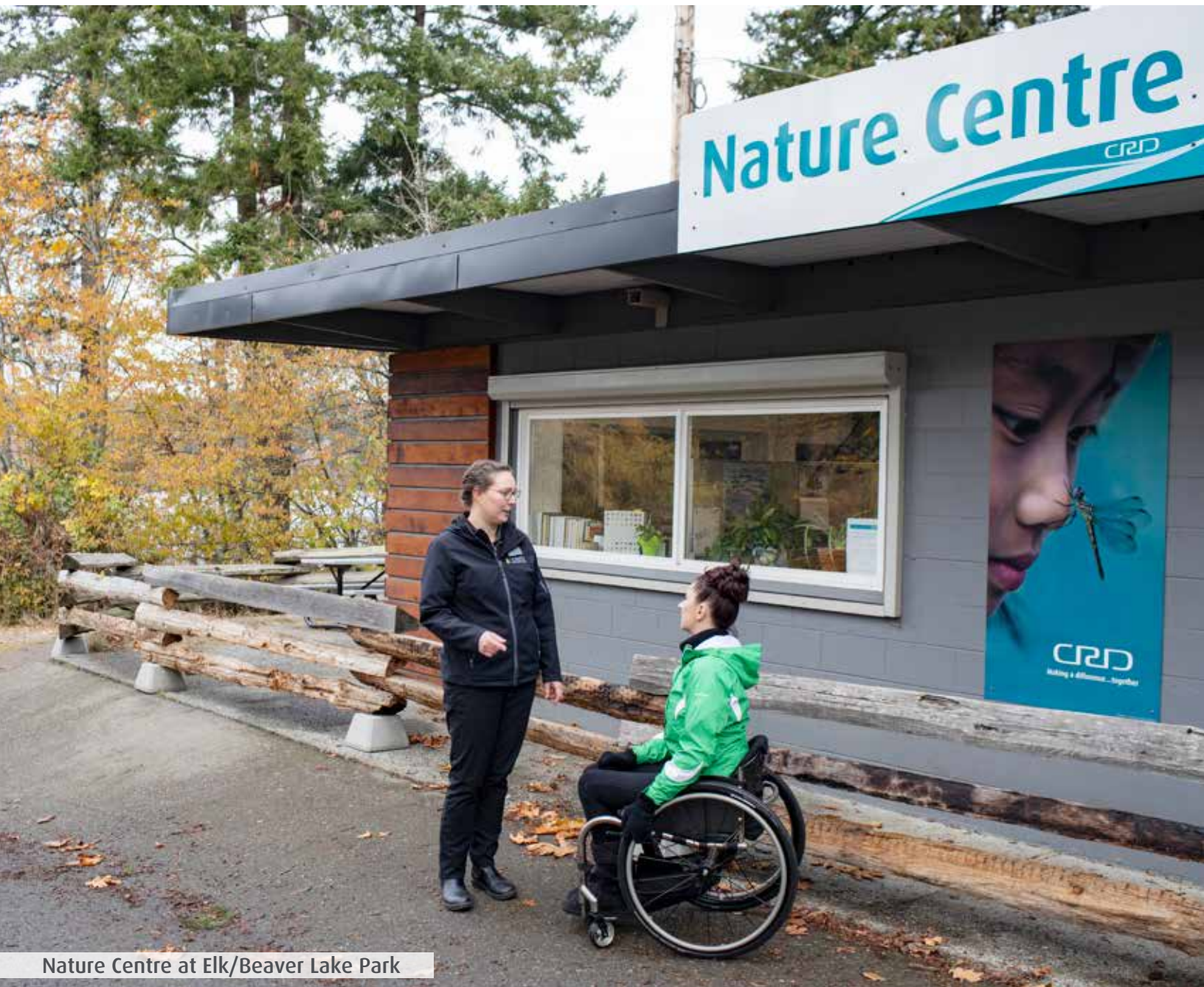
Nature Centre at Elk/Beaver Lake Park

We value equity, diversity, and inclusion and are committed to listening, learning and evolving on this journey to improve the sense of belonging for everyone at the CRD.