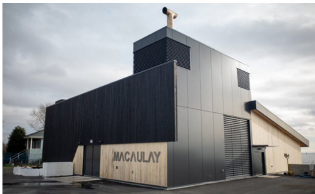
Macaulay Point Pump Station

Construction on the new Macaulay Point Pump Station is complete. Landscaping and restoration will create an attractive and welcoming waterfront space to be enjoyed. The new Macaulay Point Pump Station conveys wastewater from Esquimalt, View Royal, Langford, Colwood, Saanich, Victoria and the Esquimalt and Songhees Nations to the McLoughlin Point Wastewater Treatment Plant for treatment.