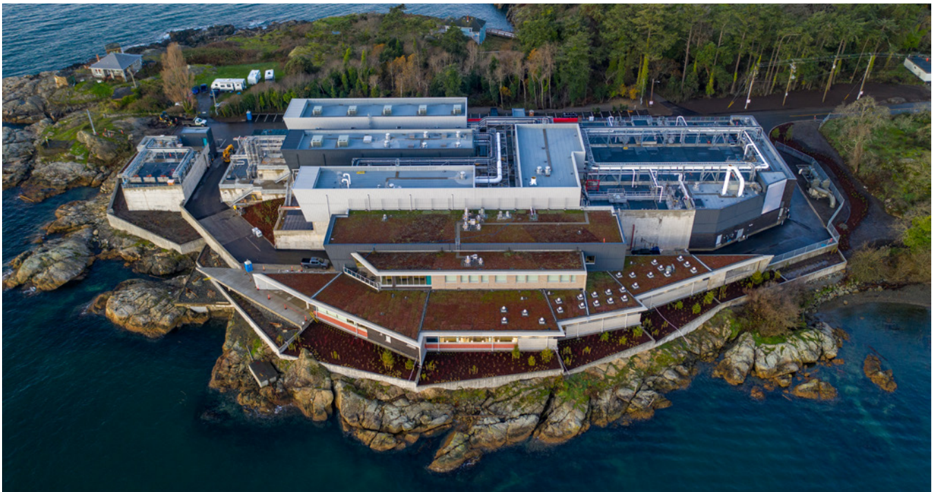
Aerial view of McLoughlin Point Wastewater Treatment Plant.

Construction is complete at the McLoughlin Point Wastewater Treatment Plant which is now in full operation treating wastewater to a tertiary level. The plant can treat 108 megalitres of wastewater per day from the core area municipalities of Victoria, Esquimalt, Saanich, Oak Bay, View Royal, Langford and Colwood, and the Esquimalt and Songhees Nations. The treatment plant includes a multi-level green roof, mature landscaping, an observation deck, and education space.