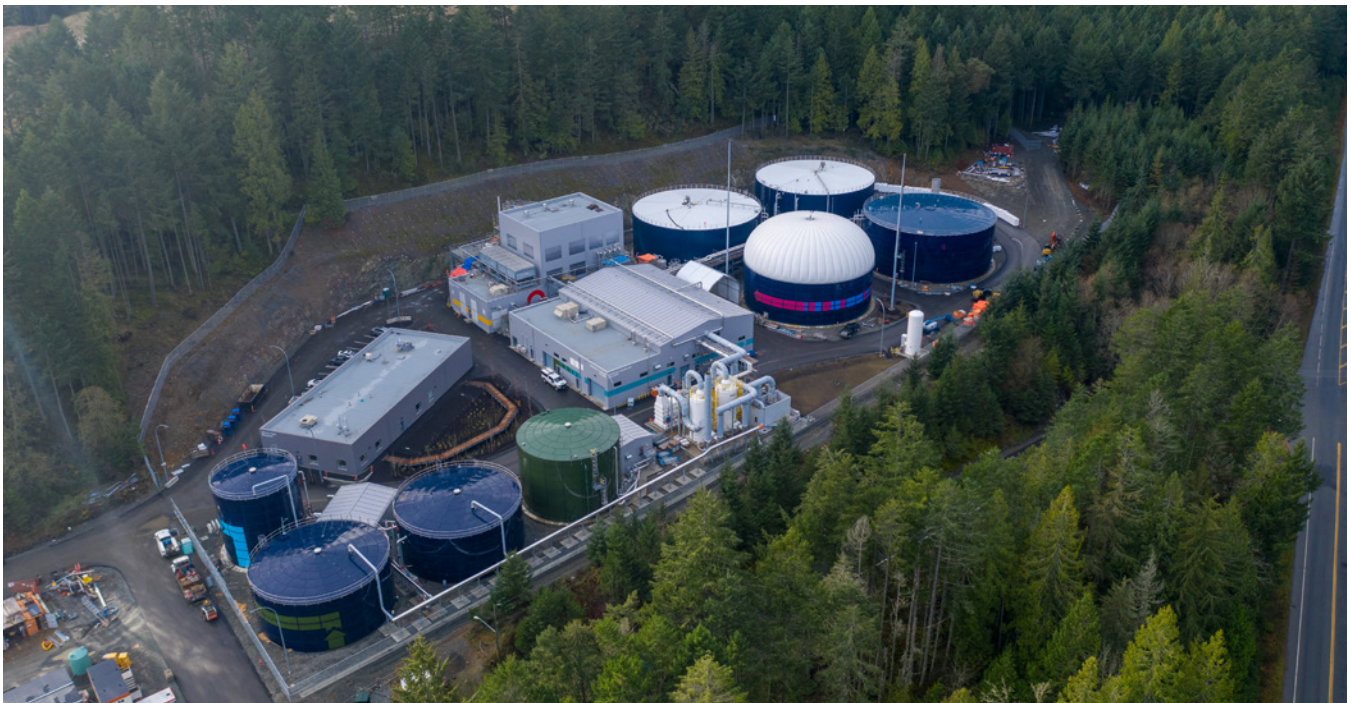
Aerial view of the Residuals Treatment Facility.

The Residuals Treatment Facility turns residual solids from the McLoughlin Point Wastewater Treatment Plant into Class A biosolids. These are the highest quality by-product suitable for beneficial use.