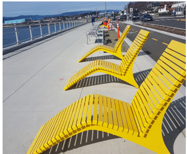
Infrastructure improvements along the Clover Forcemain