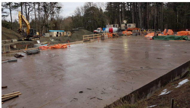
Construction progress at the Arbutus Attenuation Tank

The Arbutus Attenuation Tank will temporarily store wastewater flows during high volume storm events to reduce the number of sewer overflows. Excavation, shoring and pouring the concrete tank walls and roof are now complete. The tank is expected to be connected to the existing conveyance system in spring 2021. Once construction is complete the site will be planted with vegetation appropriate for the local woodland setting.