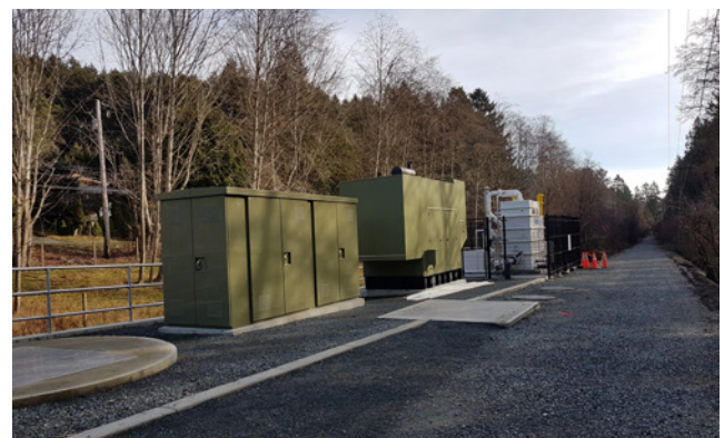
Landscaping still to be completed for Pump Station on Interurban Rail Trail

Construction on the Residual Solids Conveyance Line is complete. Final landscaping is expected to be finished in spring 2021.